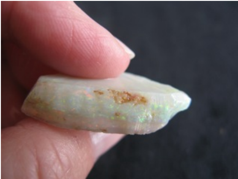
13. $840 IMG_0860 Mintubi $4,000/oz approximately 25mm x 25mm at widest point .21oz