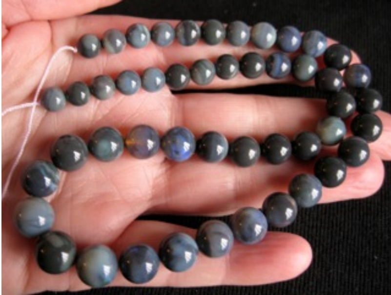
26. $393 IMG_5690 Lightning Ridge Black Opal 7-10mm round 171cts