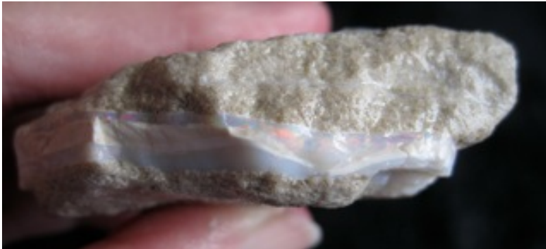
1. $40 IMG_9390 Mintubi Gem Bar Specimen

33. $295 IMG_9213 Lightning Ridge Black very large Frog 2" x 1.25" 72.38cts