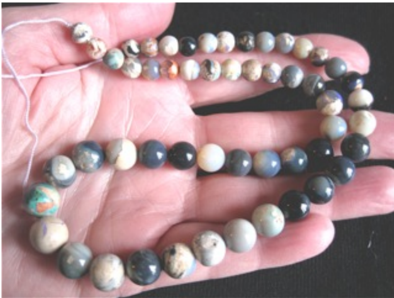
27. $448 IMG_5683 Lightning Ridge 7-11mm round 146cts