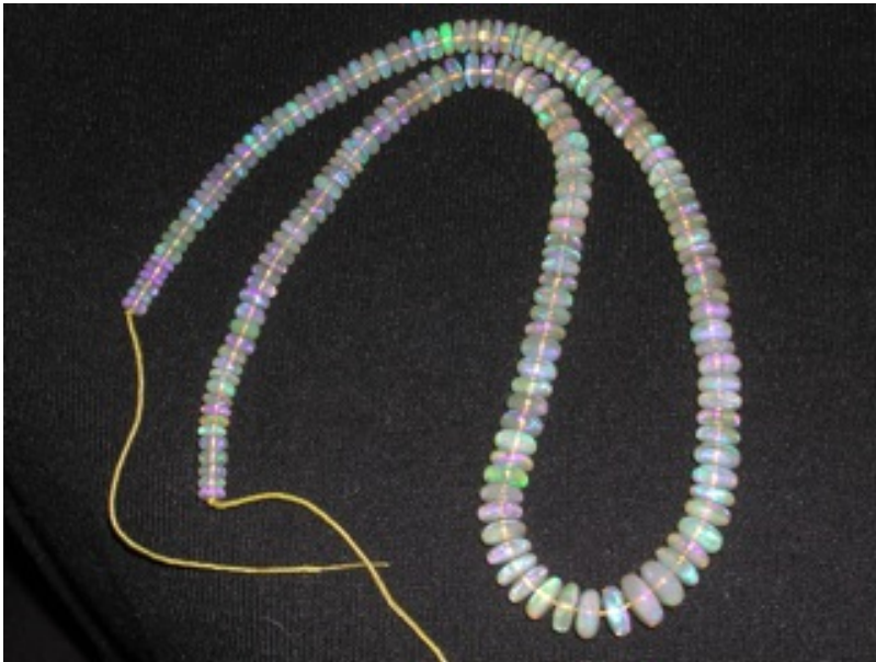
29. $1,500 DSCN3647 Andamooka 5-9mm rondel 96cts