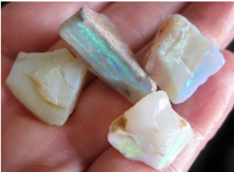
19. $946 IMG_0211 Mixed Gems $2,200/oz .43oz