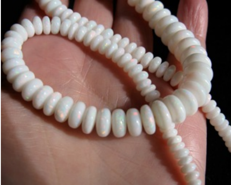
30. $2,750 IMG_9447 Mintubi White Base Reds & Greens 4-11mm rondel 135cts $15/ct