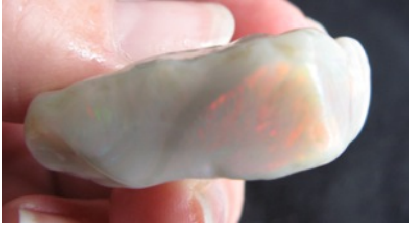
8. $306 IMG_0930 Dead Horse Gully $600/oz 33mm x 28mm x 14mm thick .51oz - a great stone