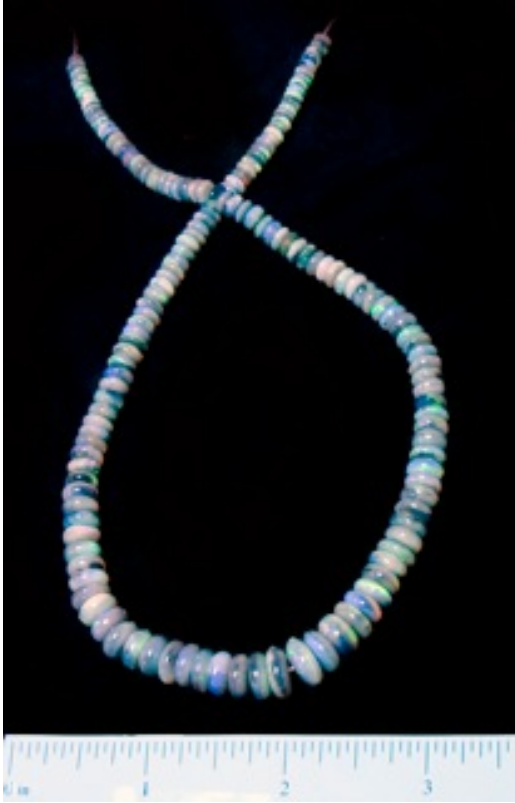
28. $1,495 MsbrnBak1 Mintubi Semi Black 5-10mm rondel 114cts