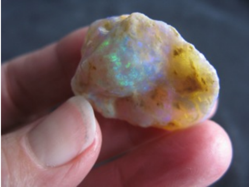
18. $900 IMG_0789 Shell Super Gem double sided 48.15cts