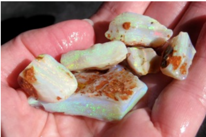
35. $1,500 IMG_5461 SPECIAL Lambina Dark Base Blue Green some Red 1oz