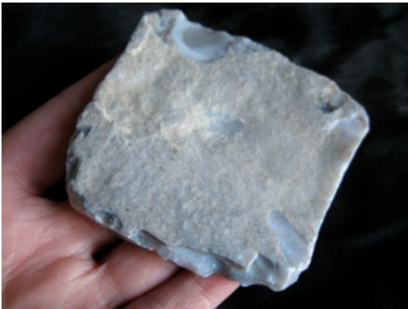
31. $880 IMG_2885 Mintubi Dark Base $400/oz 2.2oz