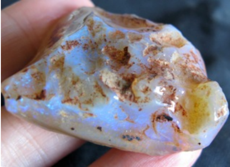
10. $170 IMG_6008 Lambina Blues $200/oz .85oz