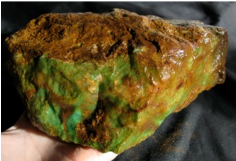
27. $475 IMG_2936 Chrysoprase very very good quality $250/kilo 1.9 kilos 8"x4.5"x2" thick