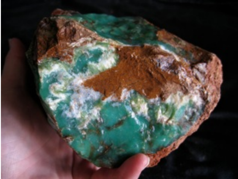
4. $105 IMG_8923 Chrysoprase $60/kilo 1.75kgs