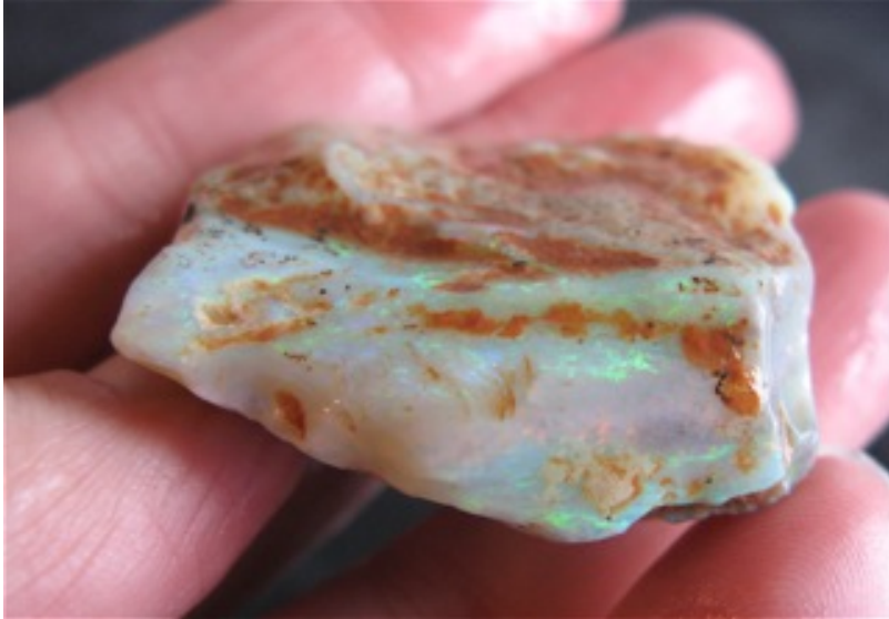
34. $1,330 IMG_1818 15 Mile Dark Base Gem Reds Golds Greens $2,000/oz .655oz (37mm x 34mm x 14mm)