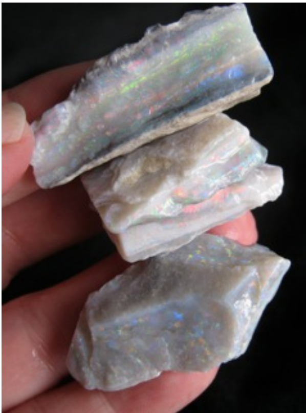
21. $328 IMG_9737 Mintubi Dark Base $400/oz .82oz