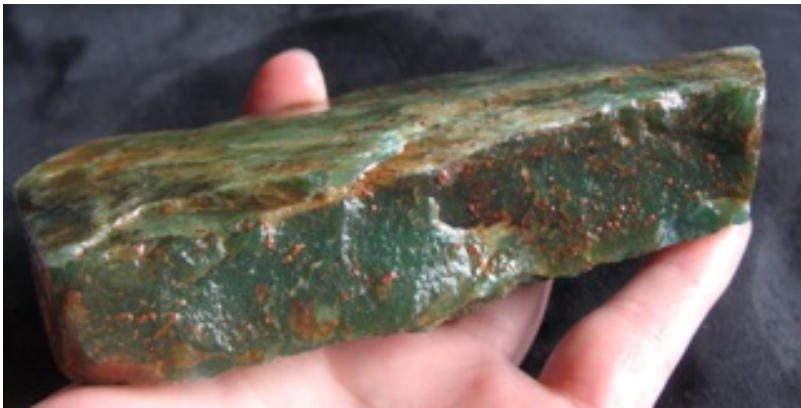
11. $174 IMG_5565 Imperial Prase $400/kilo .435kilo