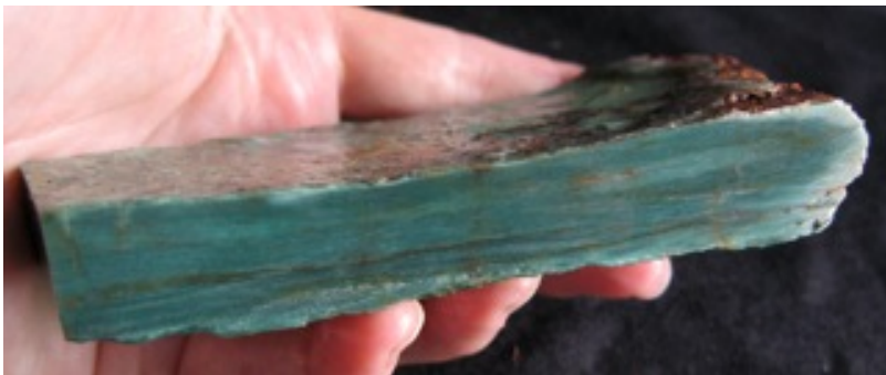
5. $114 IMG_5571 Imperial Prase $400/kilo .285kilo