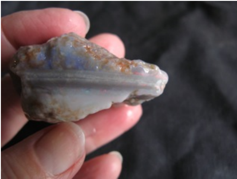
3. $97.75 IMG_5634 Dead Horse Gully Dark Base $85/oz 1.15oz