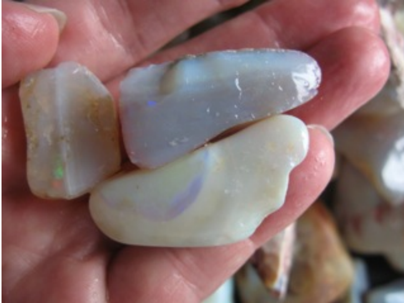
26. $392 IMG_5695 Andamooka Potch & some Colour tumbled to a polish and some amber potch $3.50/oz 112oz (will sell in 15oz lots)