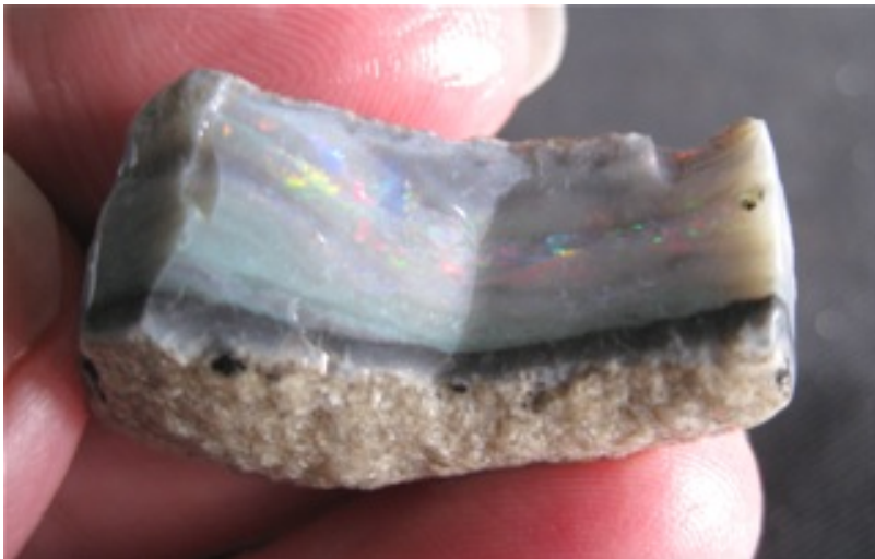
8. $150 IMG_3597 Mintubi Black Rub .252oz