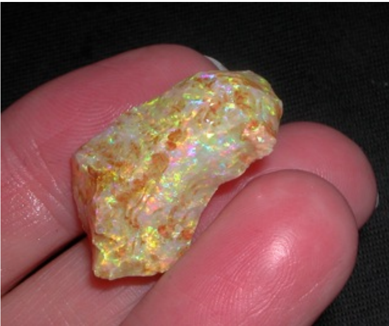
33. $1,062 DSCN6301 Mintubi Super Gem $225/g MG2c 4.72grams