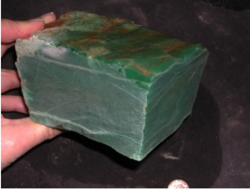
30. $720 DSCN4129 Prase P4 1.8kg $400/kilo