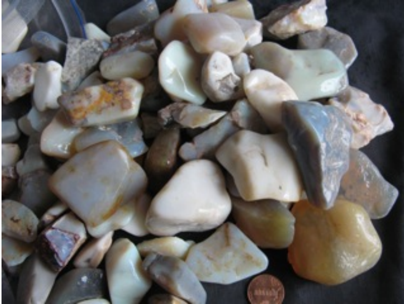
24. $392 IMG_5688 Andamooka Potch & some Colour tumbled to a polish and some amber potch $3.50/oz 112oz (will sell in 15oz lots)