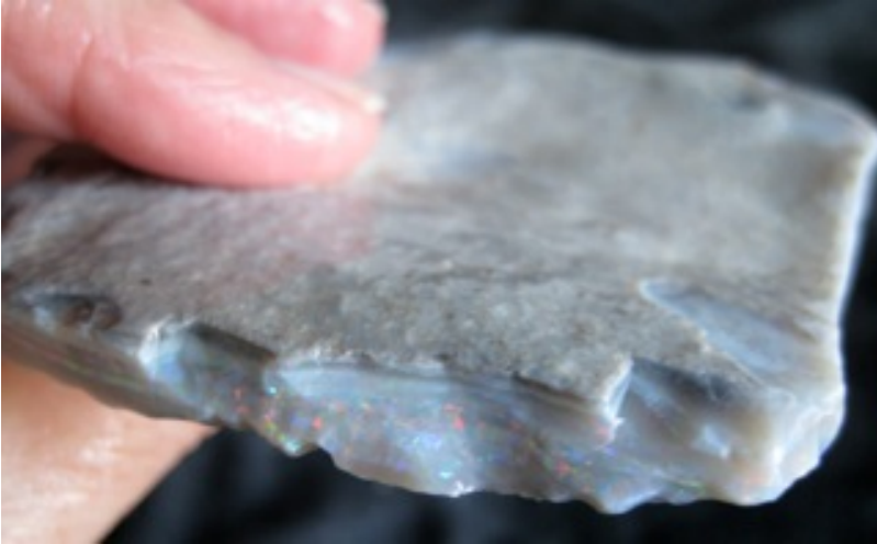
32. $880 IMG_2889 Mintubi Dark Base $400/oz 2.2oz