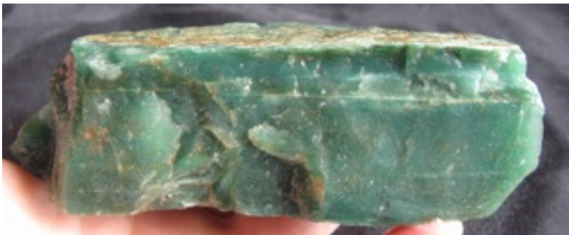
9. $152 IMG_5566 Imperial Prase $400/kilo .38kilo