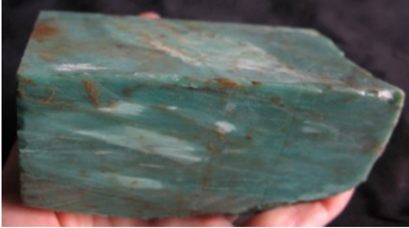
20. $316 IMG_5563 Imperial Prase $400/kilo .79kilo