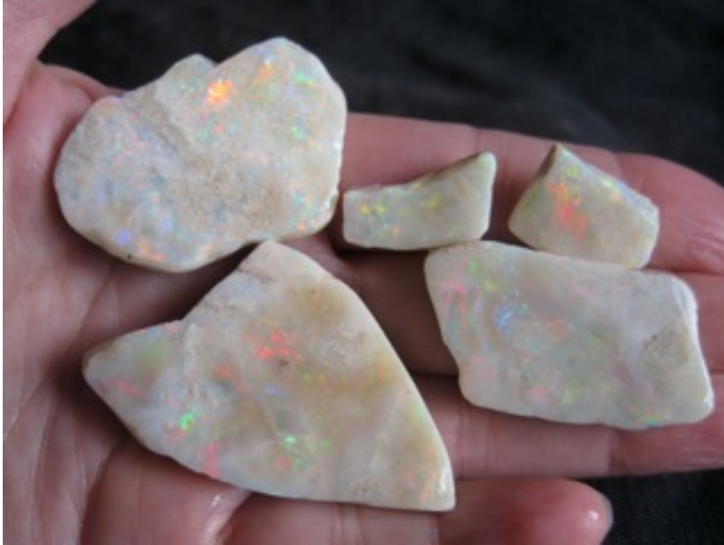
28. $560 IMG_3170 Mintubi Faced on Sandstone $400/oz 1.4oz