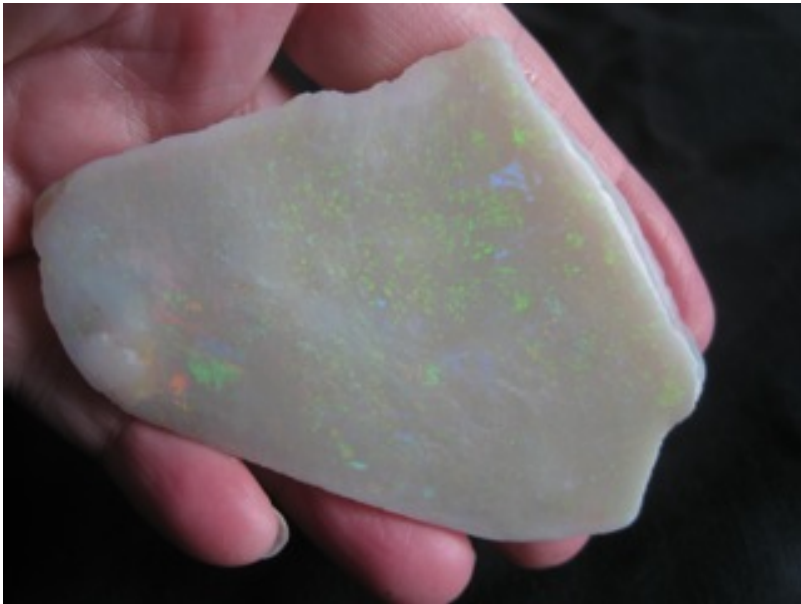
23. $384 IMG_3152 Mintubi faced stone $300/oz 1.28oz