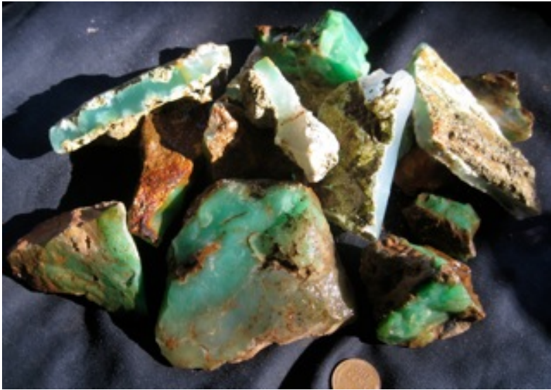
7. $150/kilo IMG_1081 Chrysoprase Mixed 1 kilo $150