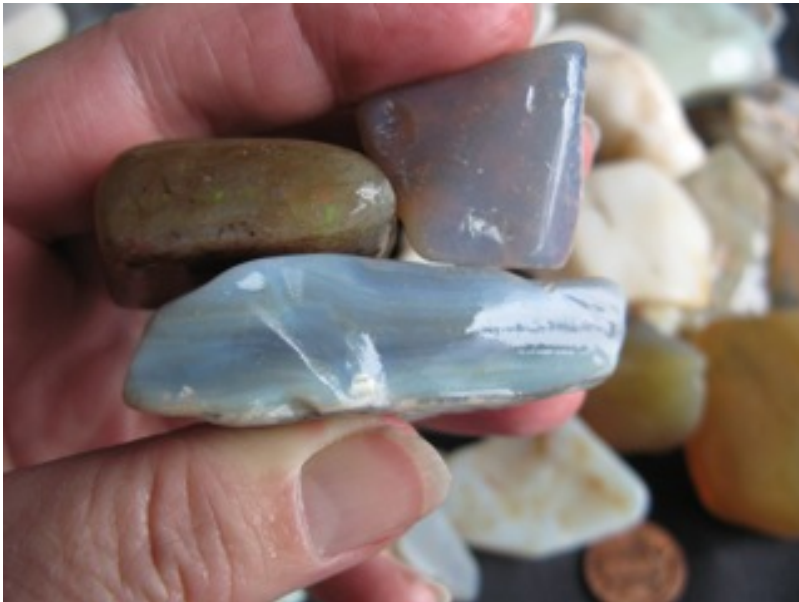
25. $392 IMG_5690 Andamooka Potch & some Colour tumbled to a polish and some amber potch $3.50/oz 112oz (will sell in 15oz lots)