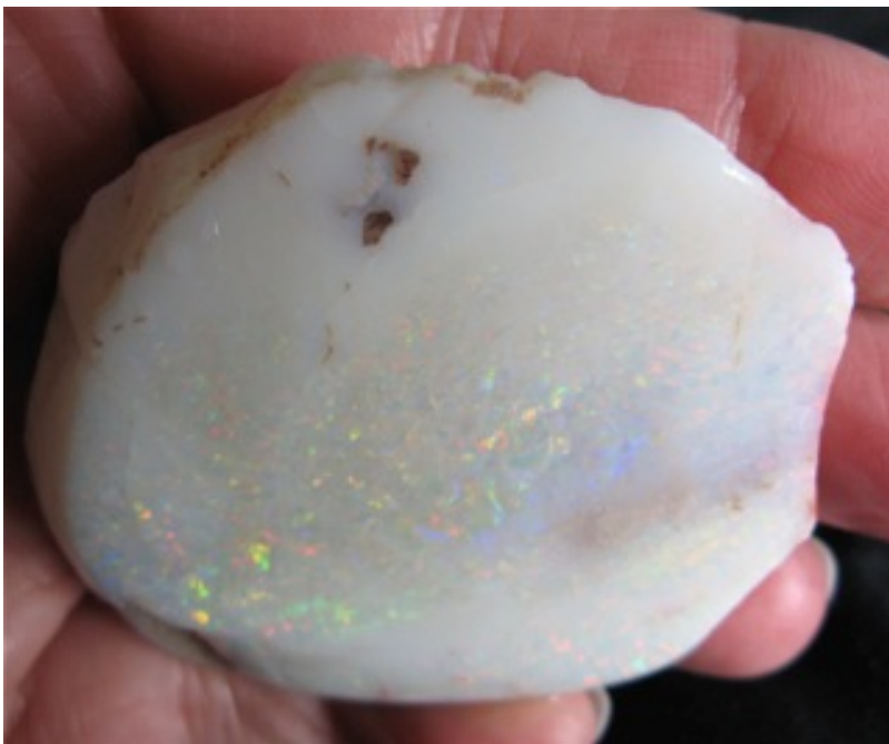
19. $308 IMG_9593.JPG Coober Pedy 8 Mile "cleaned up" $200/oz 1.54oz