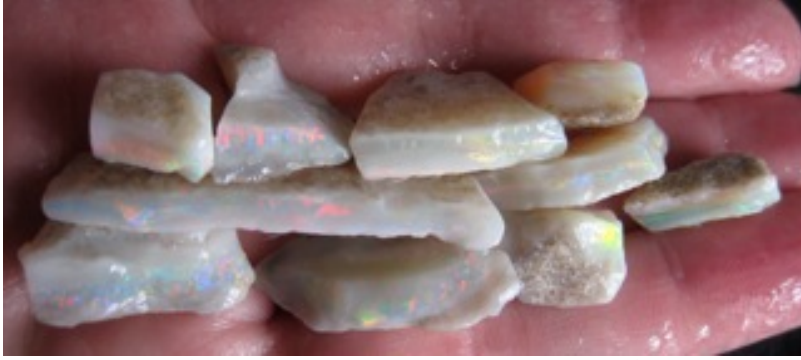
15. $200 IMG_0398 Mintubi Special $400/oz .5oz