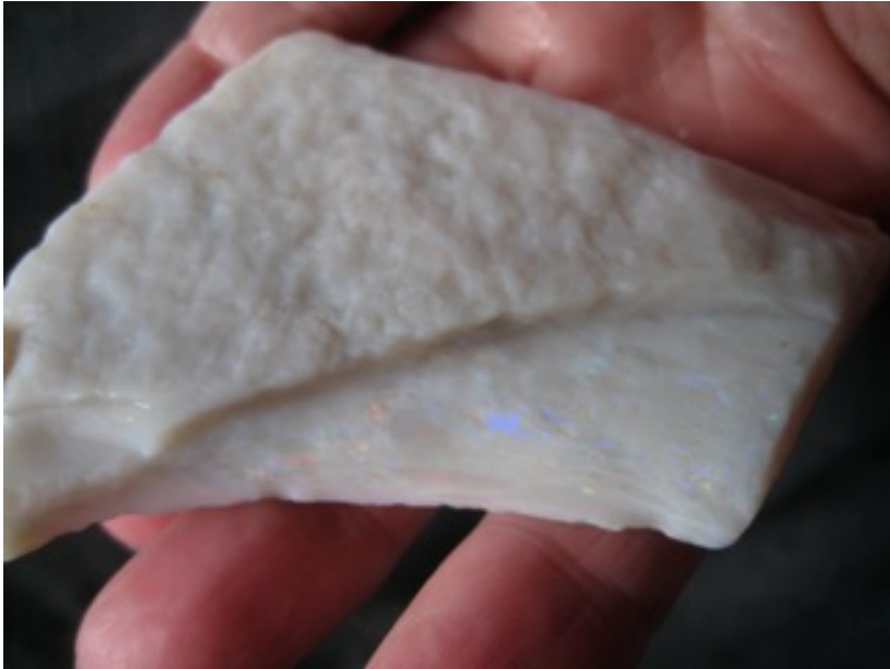
16. $245 IMG_3120 Mintubi $125/oz 2" x 2.1" x .5" thick 1.96oz