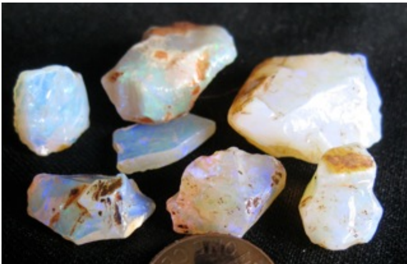
17. $280 IMG_6699 Lambina Blue Green .56oz $500/oz