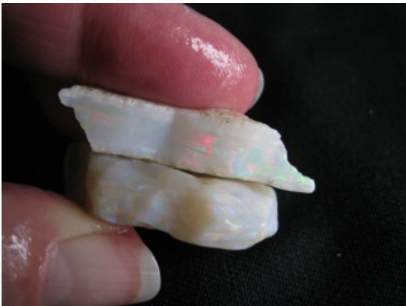
6. $140 IMG_6925 Mintubi $300/oz .469oz