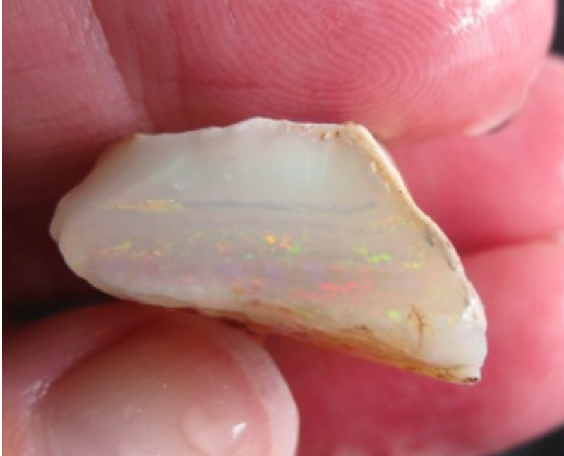
2. $85.60 IMG_0960 Olympic $400/oz .214oz