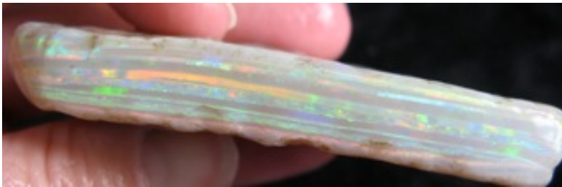
29. $15,360 IMG_0675 Mintubi Plate $8,000/oz 3" x 1.25" x .435" thick 1.92oz