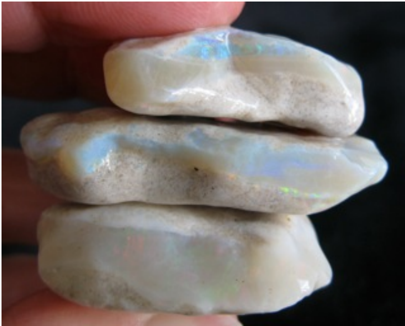
2. $115 IMG_0607 Mintubi on Sandston $100/oz 1.15oz