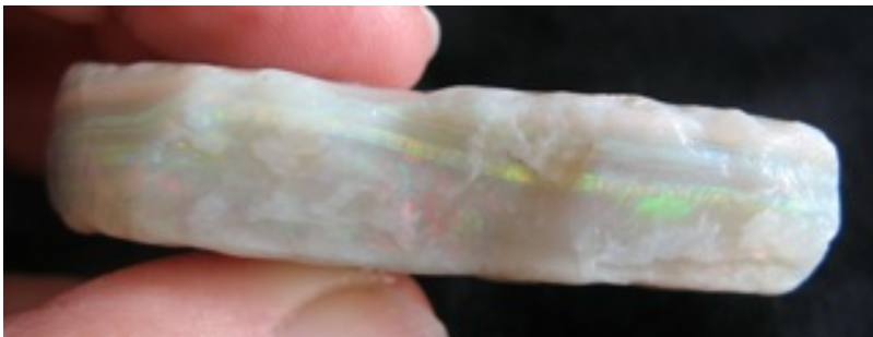
12. $2,992.50 IMG_0613 Mintubi on Sandstone 40mm x 30mm x 12mm