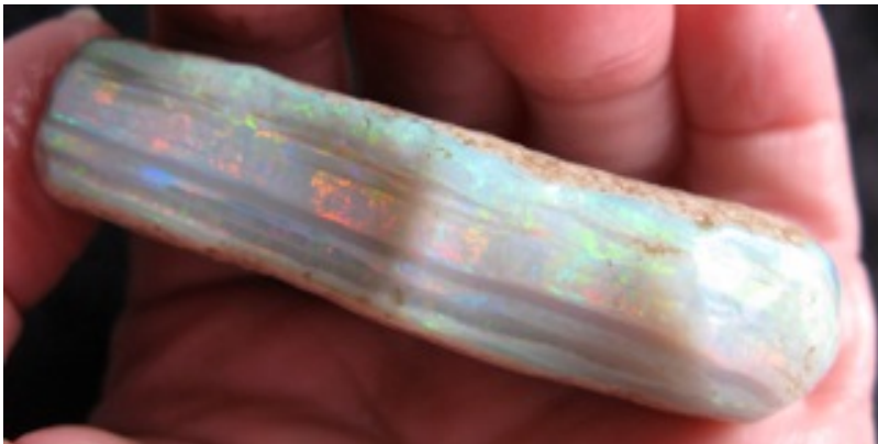
17. $9,300 IMG_4299 Mintubi Super Gem "Rainbow Opal" $6,000/oz 68mm x 22mm x 16mm thick 1.55oz