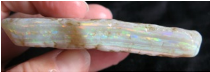
26. $15,360 IMG_0671 Mintubi Plate $8,000/oz 3" x 1.25" x .435" thick 1.92oz