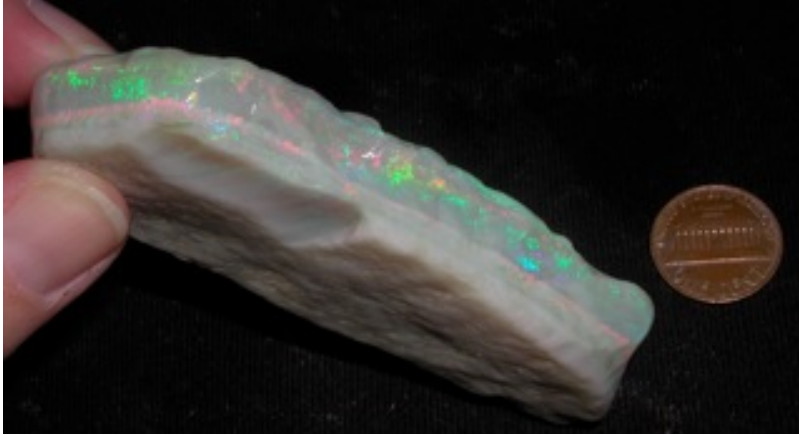
15. $5,200 DSCN1186 Mintubi Gem $2,500/oz 2.08oz