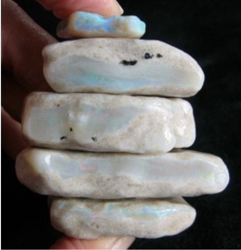
3. $116 IMG_0668 Mintubi on Sandstone $40/oz 2.9oz