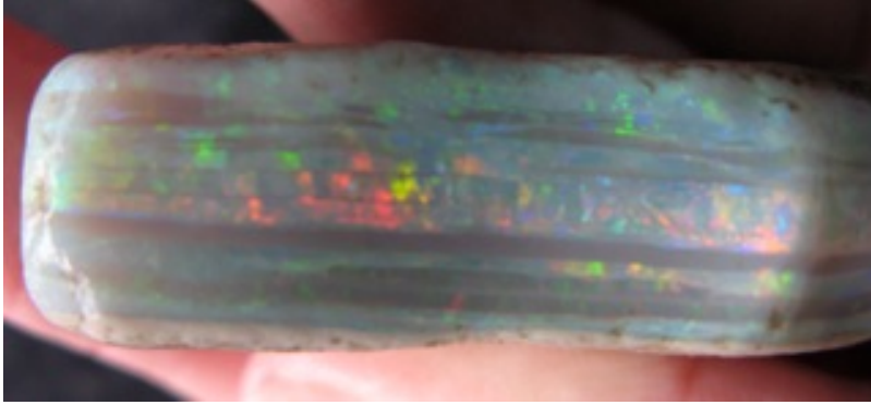
18. $9,300 IMG_4302 Mintubi Super Gem "Rainbow Opal" $6,000/oz 68mm x 22mm x 16mm thick 1.55oz