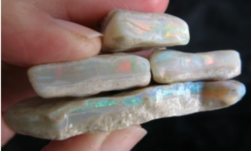
8. $406 IMG_0635 Mintubi on Sandstone (large stone could cut a $1,000 stone) very very beautiful $325/oz 1.25oz