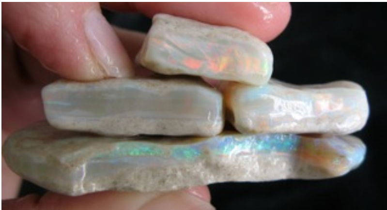
9. $406 IMG_0637 Mintubi on Sandstone (large stone could cut a $1,000 stone) very very beautiful $325/oz 1.25oz