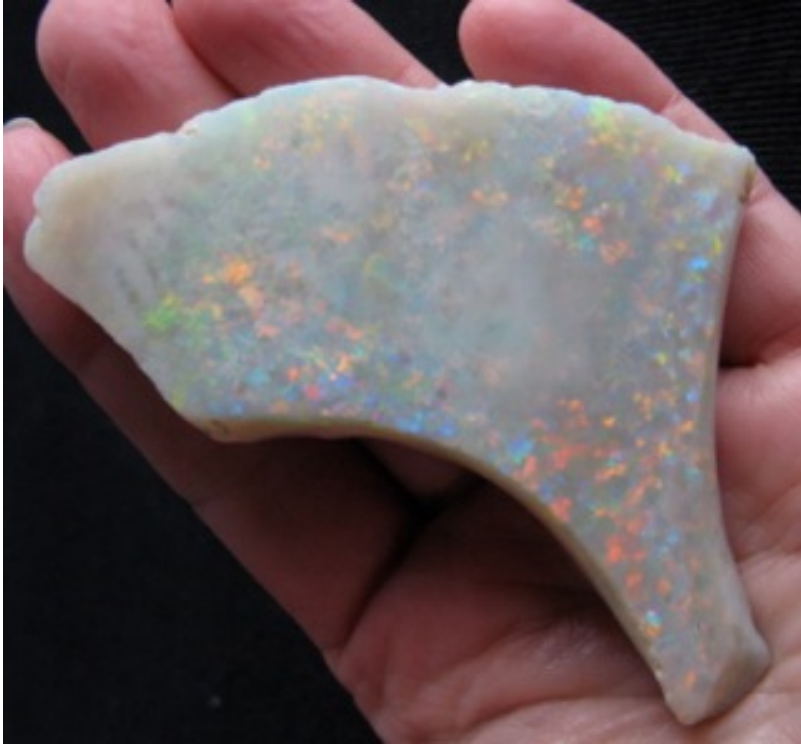
21. $11,200 IMG_3675 Mintubi Plate Gem $8,000/oz 1.4oz