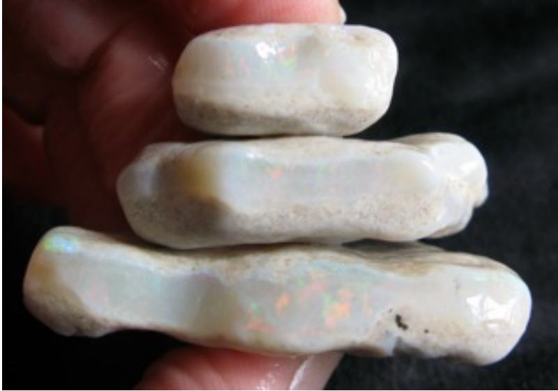
1. $52 IMG_0647 Mintubi on Sandstone $40/oz 1.3oz