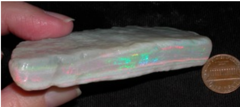
16. $5,200 DSCN1187 Mintubi Gem $2,500/oz 2.08oz