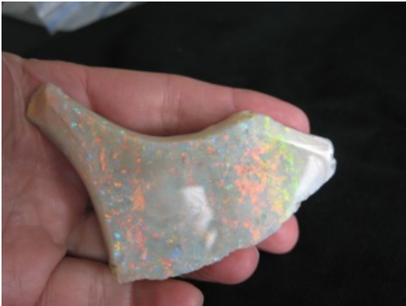
24. $11,200 IMG_0688 Mintubi Gem Plate $8,000/oz 1.4oz