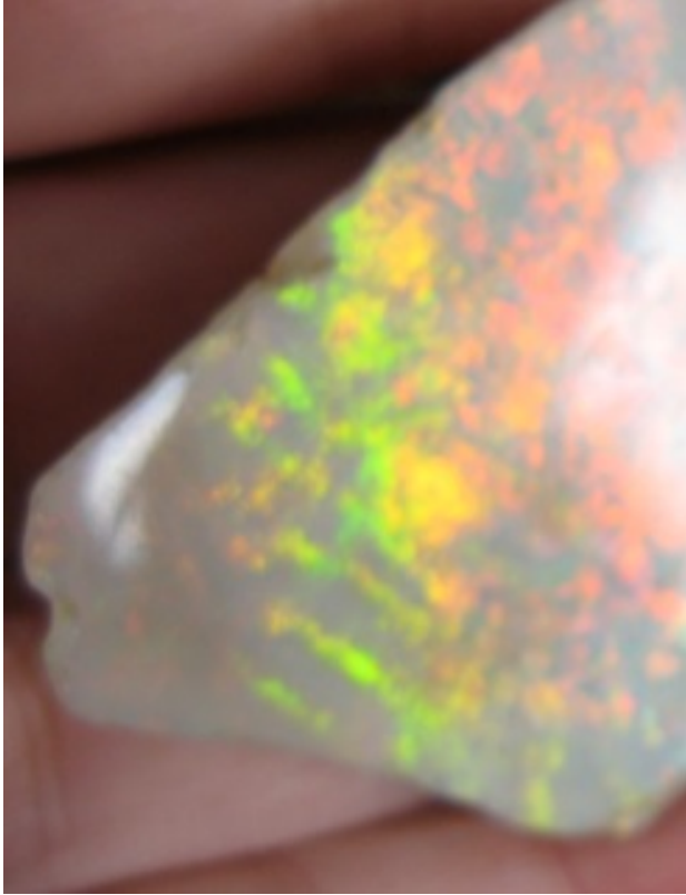
25. $11,200 IMG_0690 Mintubi Gem Plate $8,000/oz 1.4oz