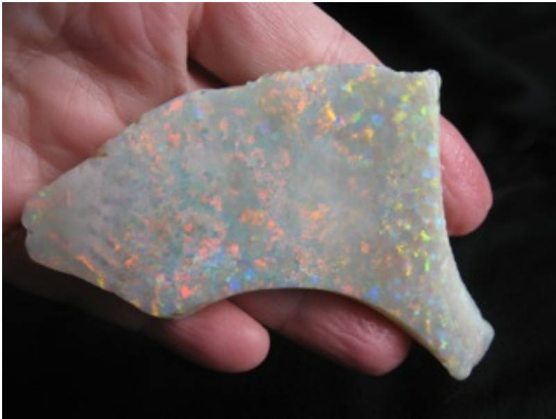
22. $11,200 IMG_0681 Mintubi Gem Plate $8,000/oz 1.4oz