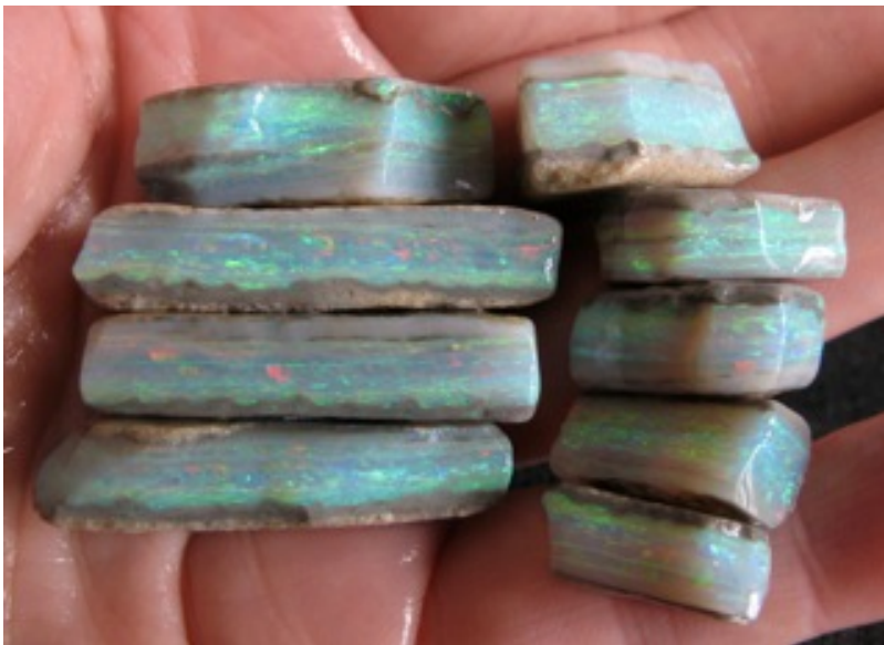
14. $2,955 IMG_0663 Mintubi Dark Base $3,000/oz .985oz