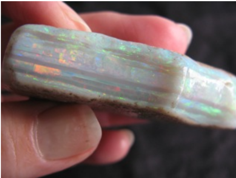
20. $9,300 IMG_4305 Mintubi Super Gem "Rainbow Opal" $6,000/oz 68mm x 22mm x 16mm thick 1.55oz