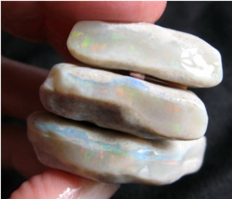
4. $118 IMG_0640 Mintubi on Sandstone $100/oz 1.18oz