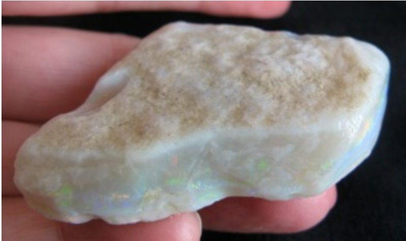
13. $2,992.50 IMG_0615 Mintubi on Sandstone 40mm x 30mm x 12mm thick $2,850/oz 1.05oz