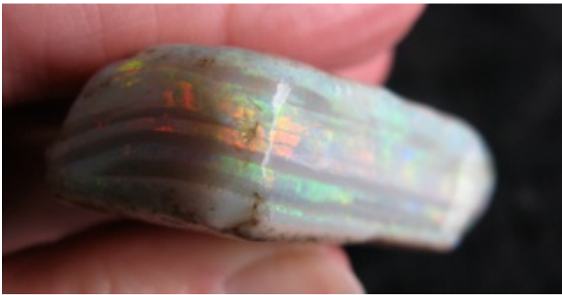
19. $9,300 IMG_4304 Mintubi Super Gem "Rainbow Opal" $6,000/oz 68mm x 22mm x 16mm thick 1.55oz