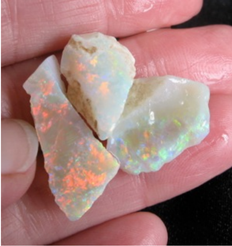
10. $845 IMG_0603 Mintubi (3 stones) $5,000/oz .169oz