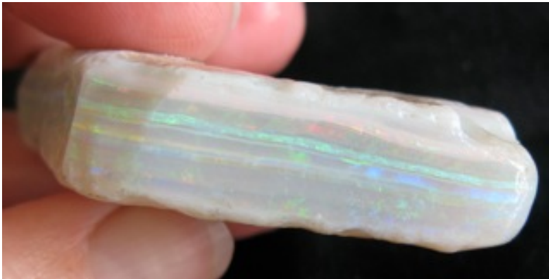
11. $2,992.50 IMG_0611 Mintubi on Sandstone 40mm x 30mm x 12mm thick $2,850/oz 1.05oz