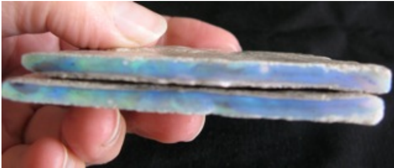
6. $230 IMG_0658 Mintubi Dark Base - Black $100/oz - these two pieces fit together, collector's opal 4" x 3" x .125" thick 2.3oz