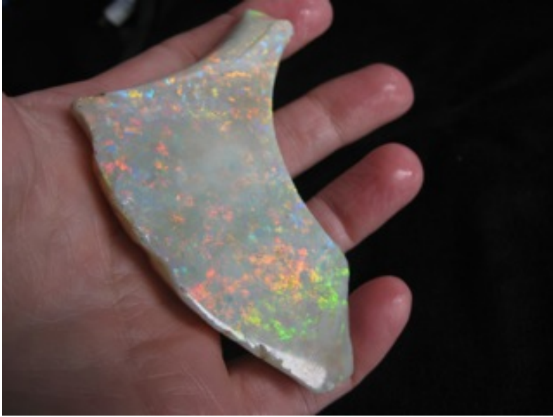
23. $11,200 IMG_0685 Mintubi Gem Plate $8,000/oz 1.4oz