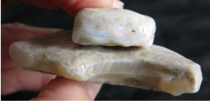
5. $130 IMG_0656 Mintubi on Sandstone $100/oz 1.3oz