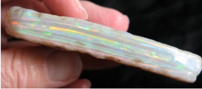
28. $15,360 IMG_0674 Mintubi Plate $8,000/oz 3" x 1.25" x .435" thick 1.92oz