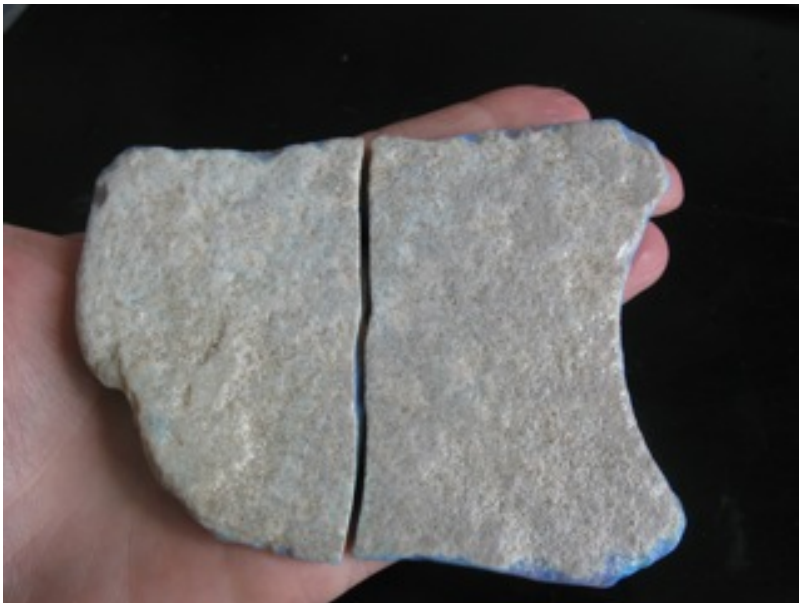
7. $230 IMG_0661 Mintubi Dark Base - Black $100/oz - these two pieces fit together, collector's opal 4" x 3" x .125" thick 2.3oz