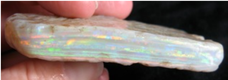
27. $15,360 IMG_0673 Mintubi Plate $8,000/oz 3" x 1.25" x .435" thick 1.92oz