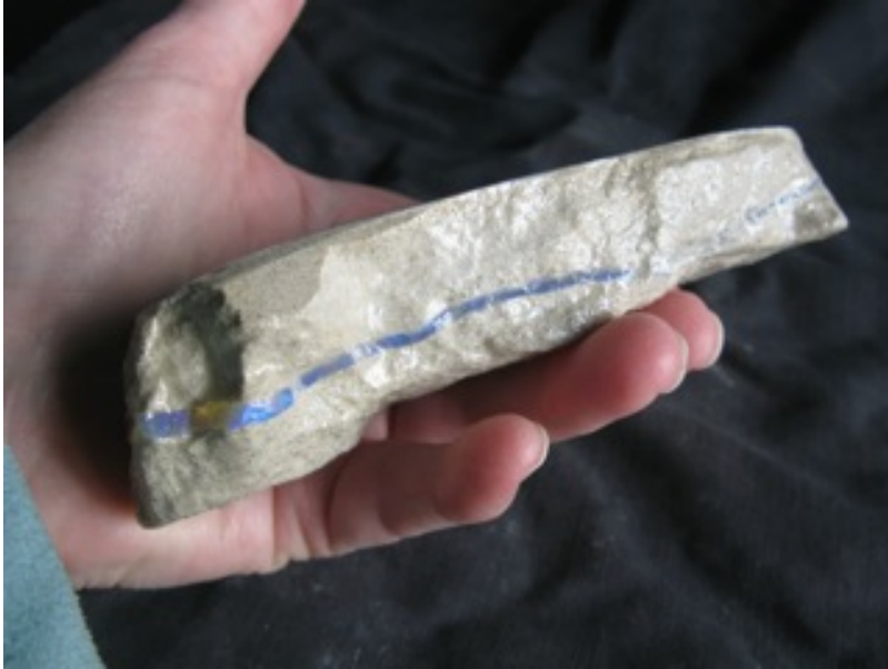
18. $325 IMG_7583 Mintubi Specimen double bar approx 14cm x 5cm x 2cm thick