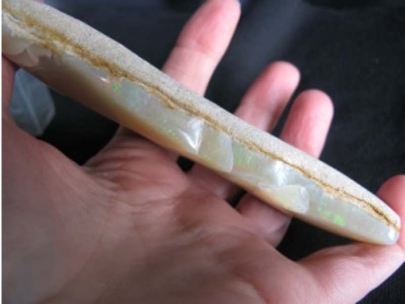
24. $435 IMG_7619 Mintubi on Sandstone jelly pinfire cut solids almost beautiful specimen 4." x 1.5" 3.1oz