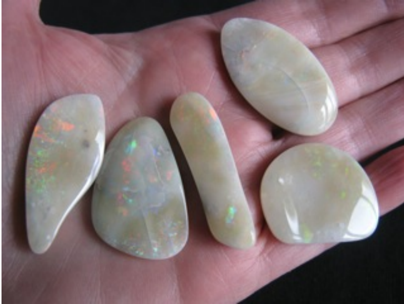
8. $175 or $35 each IMG_7663 Mintubi on Sandstone (5 stones) .769oz