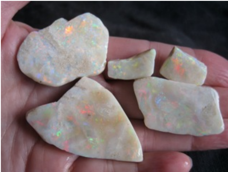
26. $560 IMG_3170 Mintubi Faced on Sandstone $400/oz 1.4oz