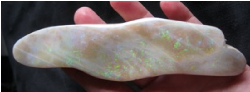
25. $535 IMG_0958 Mintubi Gem Specimen approximately 5.5" x 1.25"