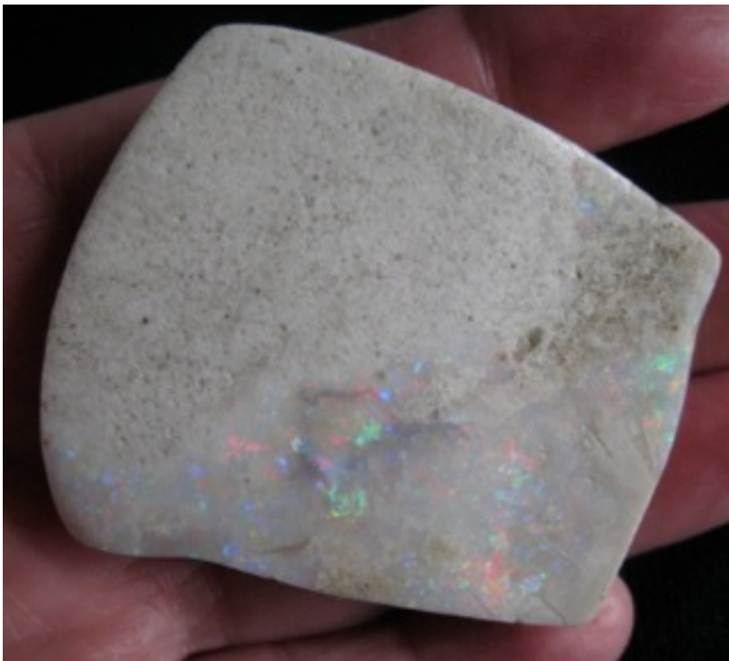
9. $195 IMG_3278 Mintubi Gem Bar Specimen 2.2oz