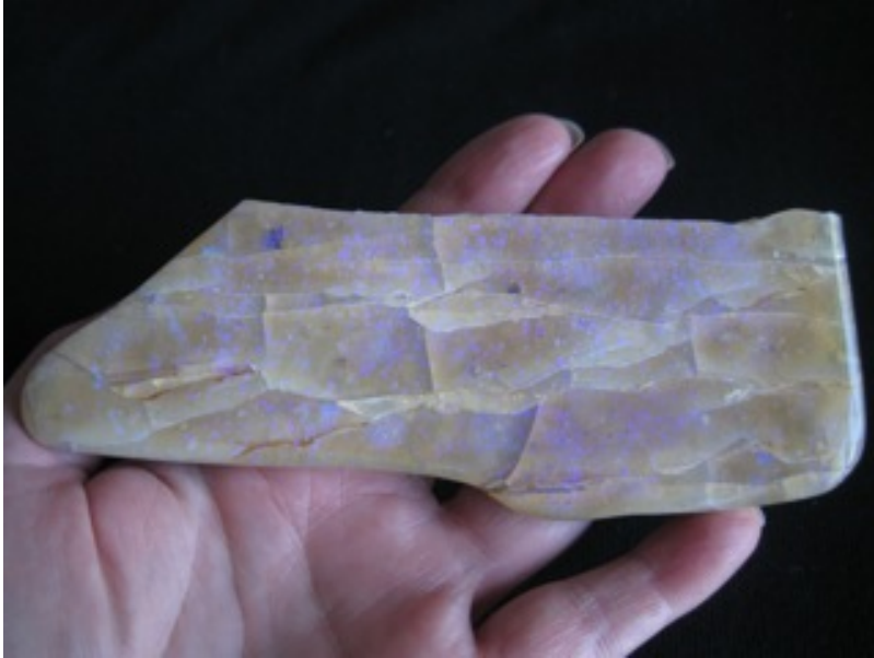
20. $350 IMG_8791 Mintubi on Sandstone purples 5.5" x 1.75" 4.75oz