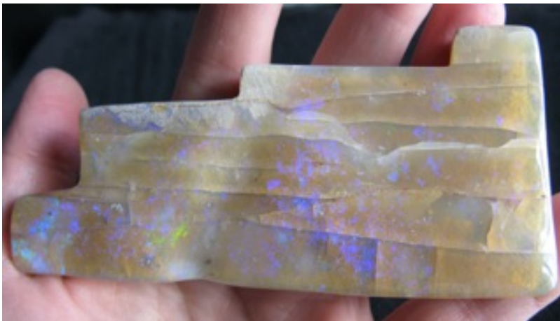
21. $375 IMG_7595 Mintubi on Sandstone brilliant blue & green jelly 4.3" x 1.5" 3.09oz