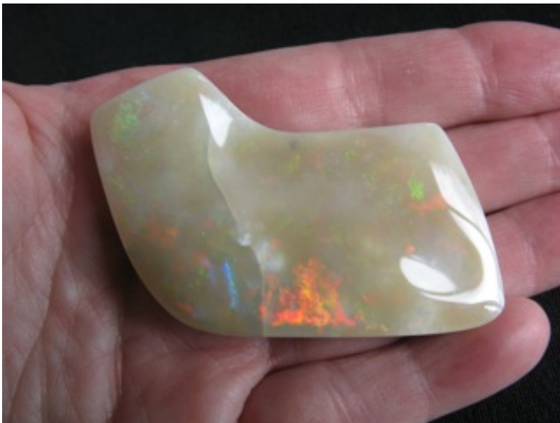
19. $335 IMG_7637 Mintubi on Sandstone Gem Reds & Greens 2" x 1.1" cut great stones