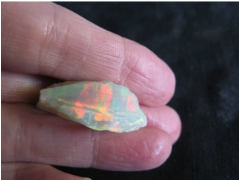
9. $910 IMG_7380 Mintubi Vertical $5,000/oz .182oz