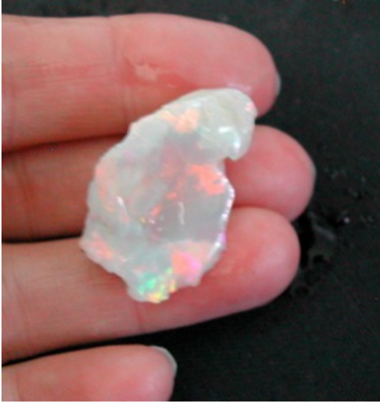
2. $910 DSCN9769.JPG Mintubi Vertical $5,000/oz .182oz