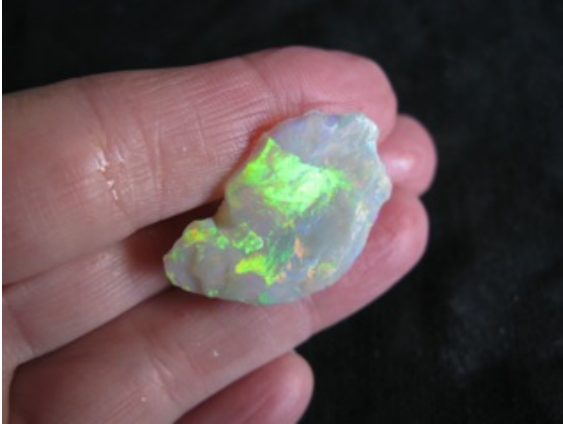
6. $910 IMG_7375 Mintubi Vertical $5,000/oz .182oz