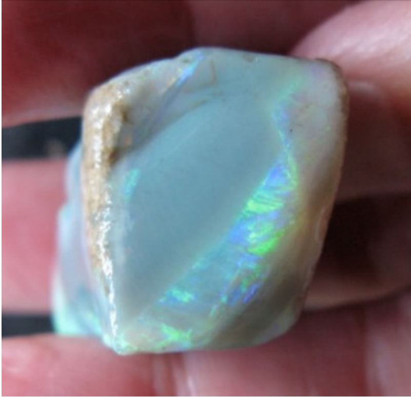
21. $1,674 IMG_7360 Mintubi Dark Base Semi Black Gem Bar $3,000/ oz .558oz