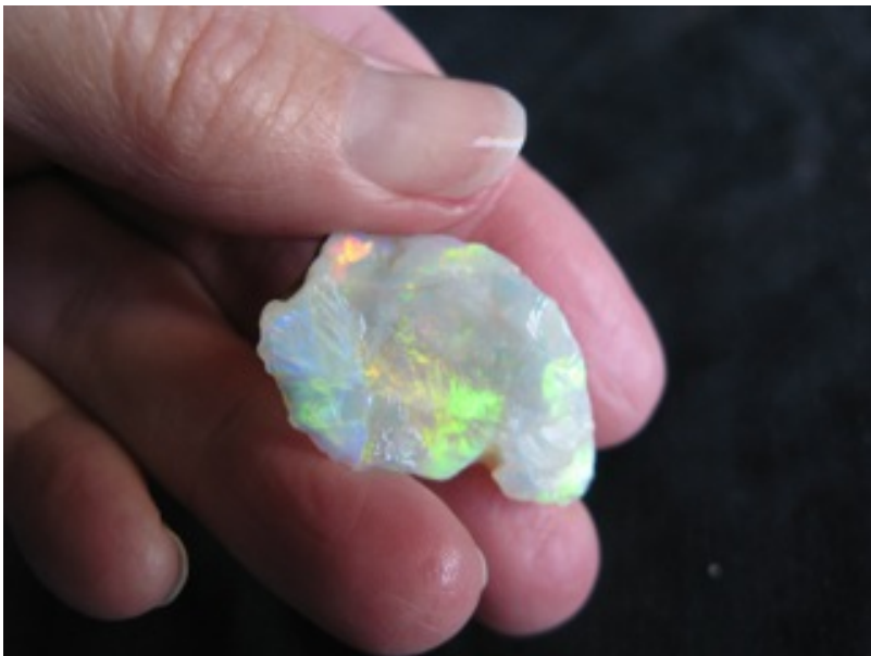
11. $910 IMG_7382 Mintubi Vertical $5,000/oz .182oz