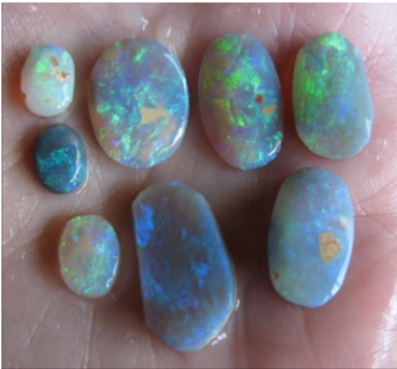
16. $1,430 parcel IMG_7347 Lightning Ridge (8) $50/ct or $1,200 24cts