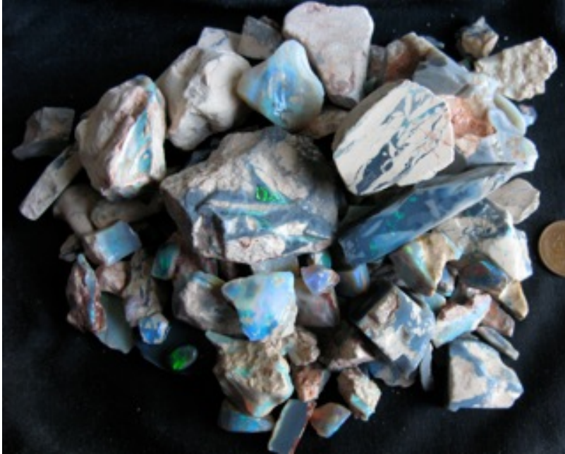
15. $1,430 parcel IMG_7350 Lightning Ridge 14oz faced Greens & Blacks