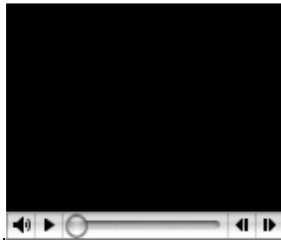
13. $910 IMG_7383 Mintubi Vertical $5,000/oz .182oz