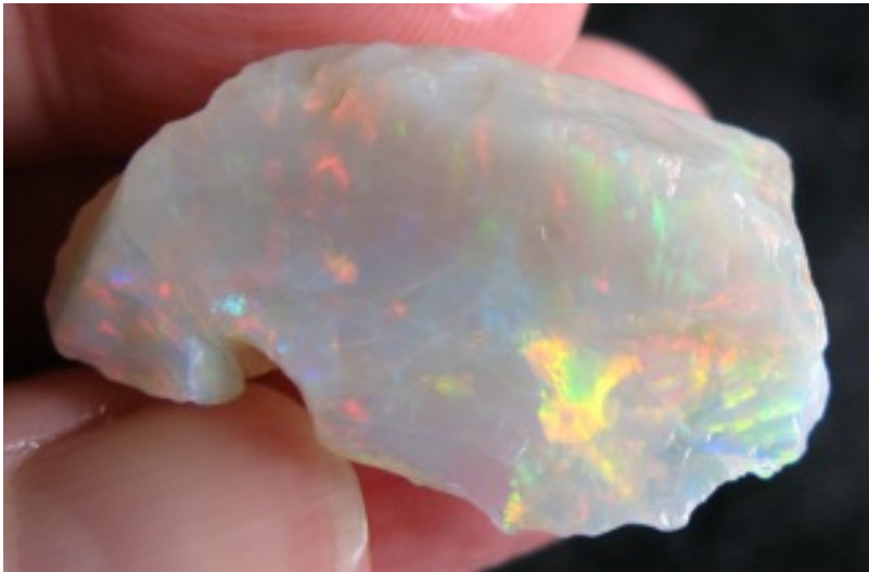
5. $910 IMG_4922 Mintubi Vertical $5,000/oz .182oz (side 3)