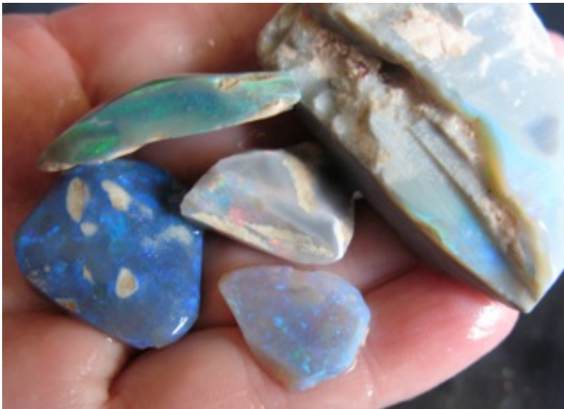
18. $1,430 parcel IMG_7340 Lightning Ridge Black Opals faced (5) 1.3oz part of 14oz parcel