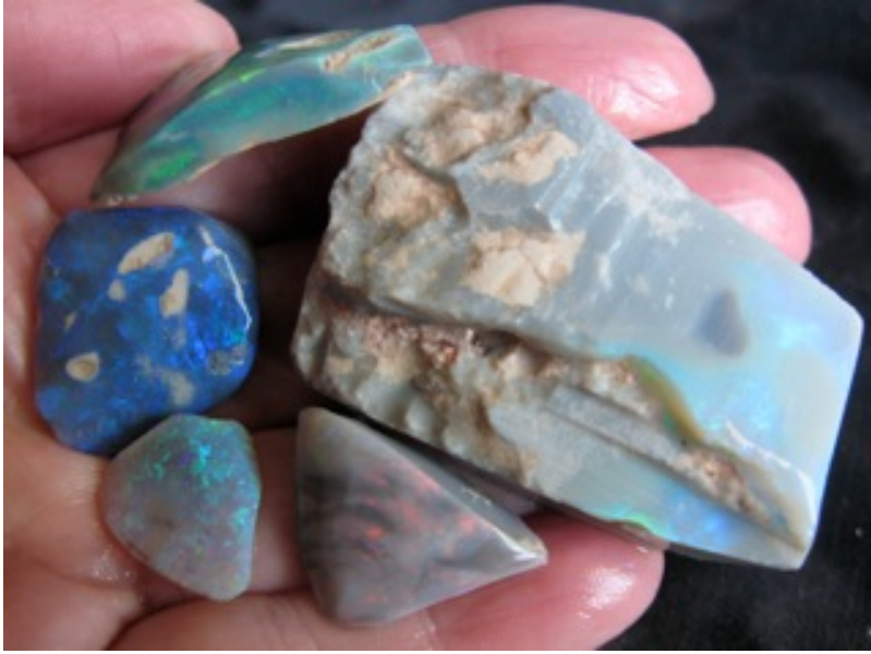
17. $1,430 parcel IMG_7336 Lightning Ridge Black Opals faced (5) 1.3oz part of 14oz parcel