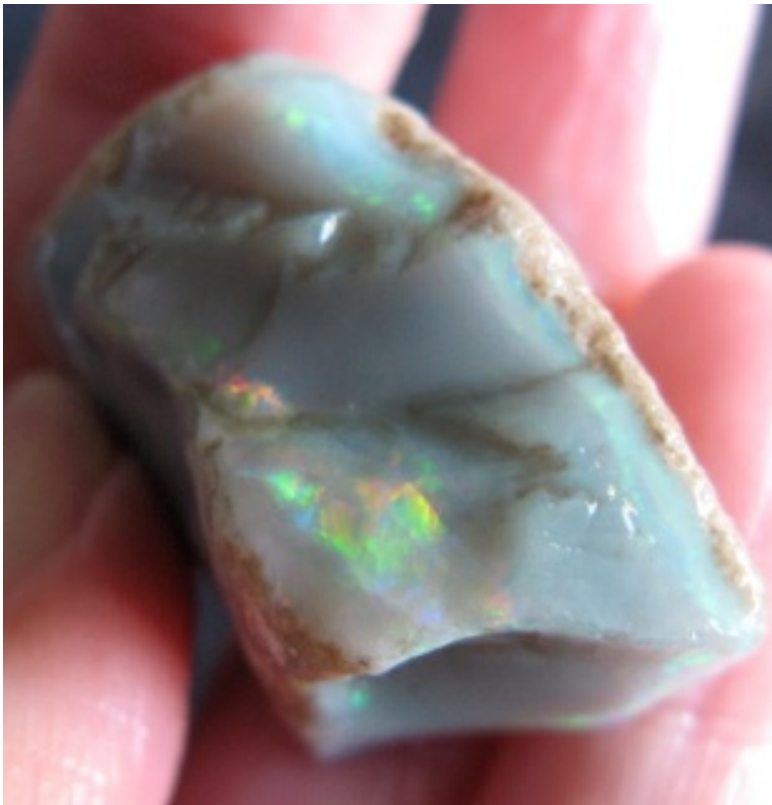
22. $1,674 IMG_7374 Mintubi Dark Base Semi Black Gem Bar $3,000/