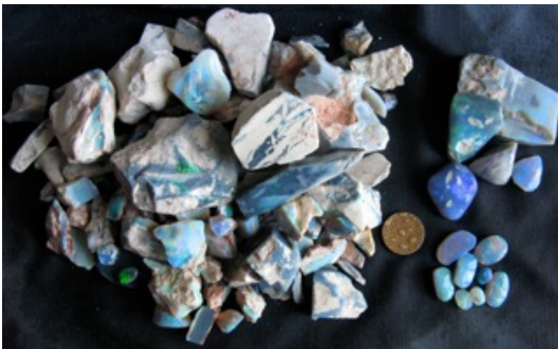
14. $1,430 parcel IMG_7351 Lightning Ridge faced Greens & Blacks 14oz