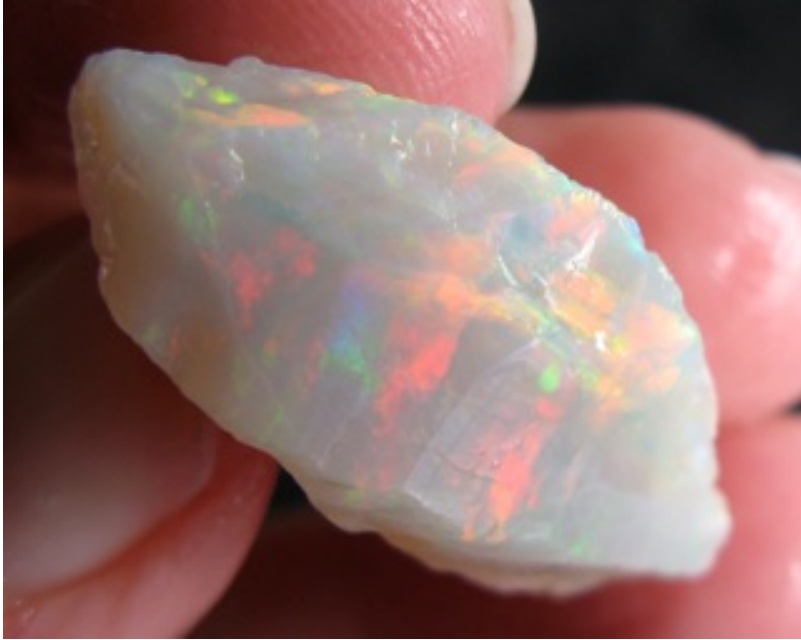
4. $910 IMG_4921 Mintubi Vertical $5,000/oz .182oz (side 2)