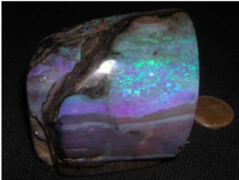
1. $875 Boulder 5.5oz