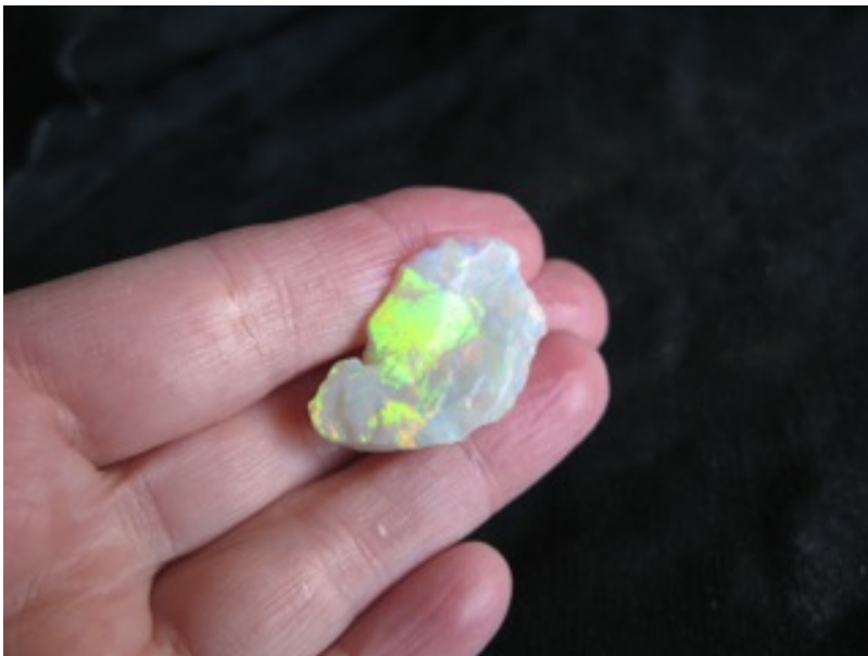
7. $910 IMG_7376 Mintubi Vertical $5,000/oz .182oz