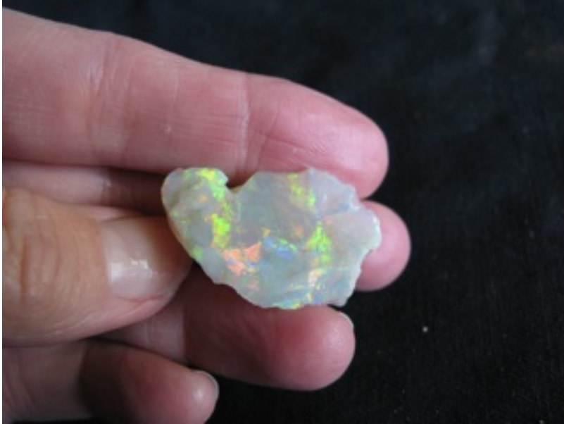
8. $910 IMG_7378 Mintubi Vertical $5,000/oz .182oz