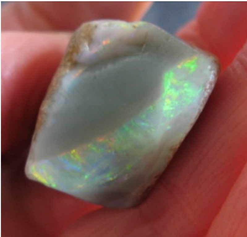
20. $1,674 IMG_7369 Mintubi Dark Base Semi Black Gem Bar $3,000/ oz .558oz