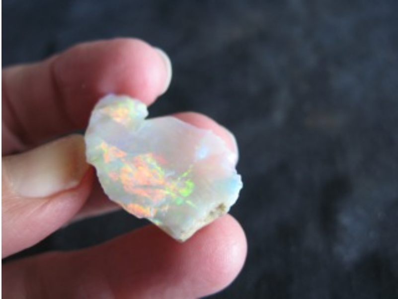
10. $910 IMG_7381 Mintubi Vertical $5,000/oz .182oz