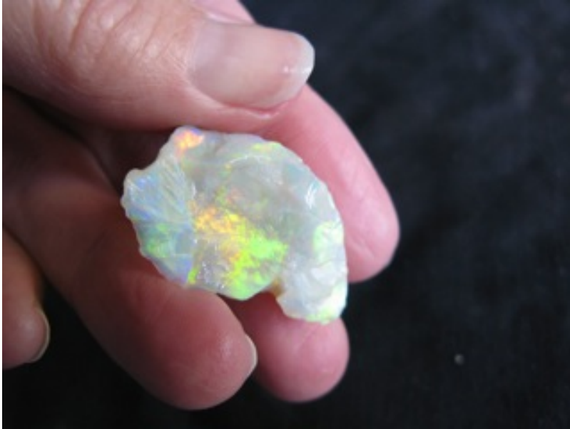
12. $910 IMG_7383 Mintubi Vertical $5,000/oz .182oz