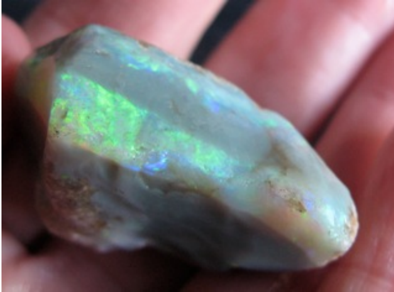
19. $1,674 IMG_7365 Mintubi Dark Base Semi Black Gem Bar $3,000/ oz .558oz