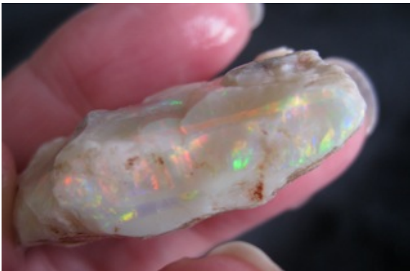
19. $1,452.50 IMG_0494 Olympic Gem Reds $3,500/oz .415oz