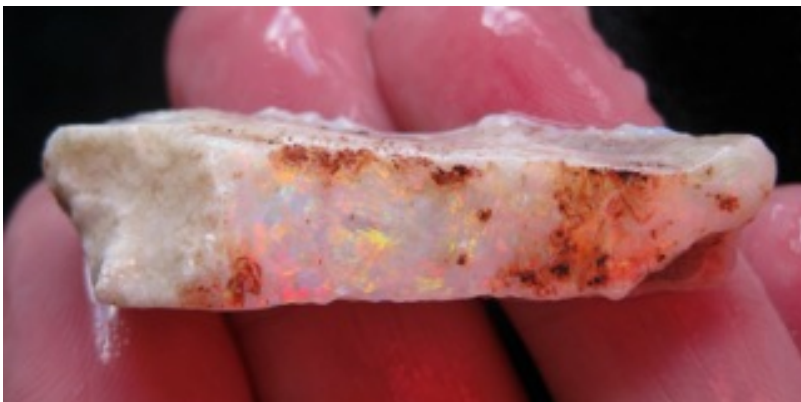
8. $665 IMG_0527 Olympic Vertical $3,500/oz .19oz