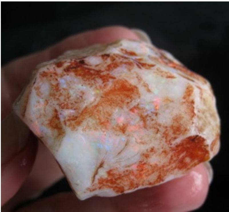
25. $2,200 IMG_0484 Coober Pedy 8 Mile Reds $1,800/oz 1.27oz