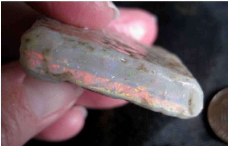
27. $4,254 IMG_0761.JPG Mintubi Plate $6,000/oz .709oz