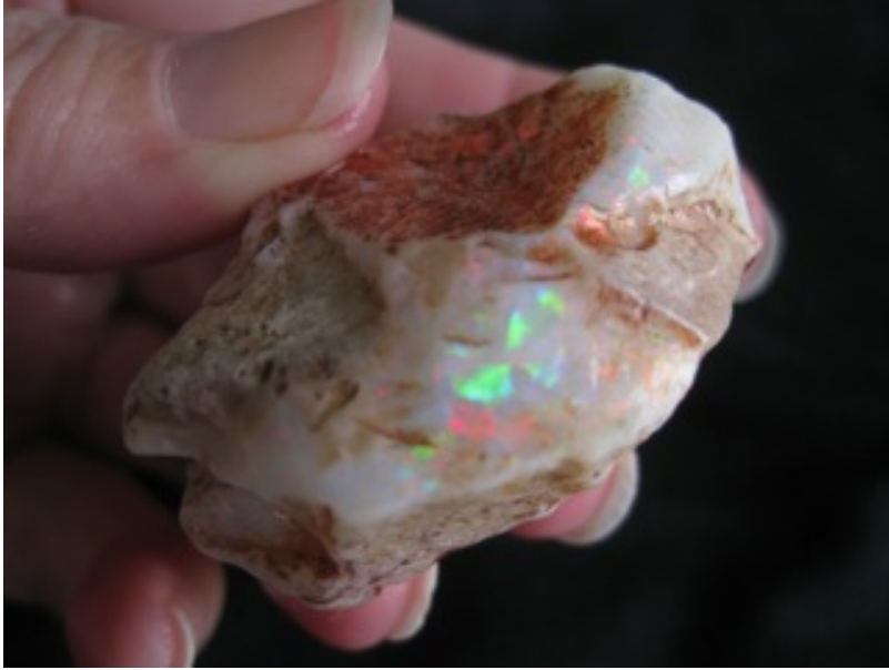
26. $2,200 IMG_0485 Coober Pedy 8 Mile Reds $1,800/oz 1.27oz