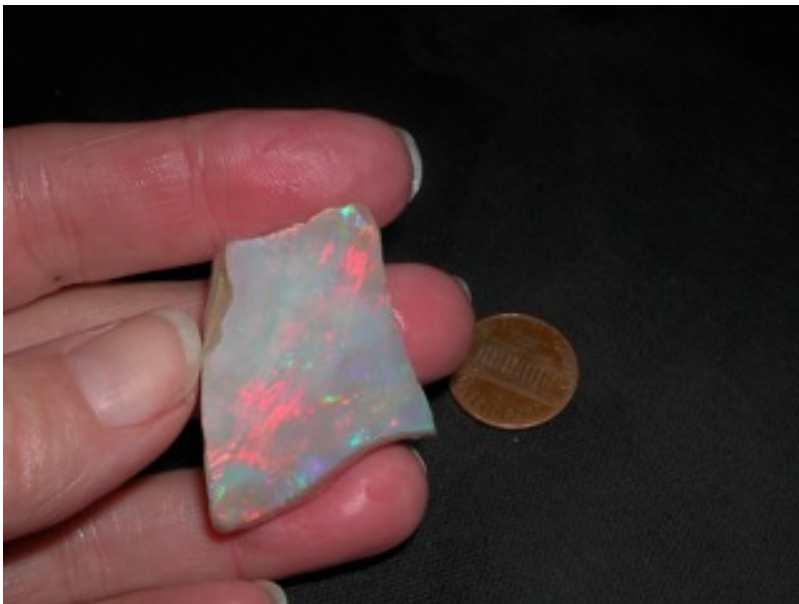
16. $1,132.50 MG3c Mintubi Gem Faced $2,500/oz .453oz