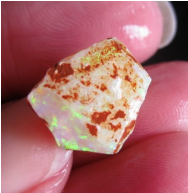
3. $357 IMG_0540 Mintubi Super Gem $225/gram 1.59grams