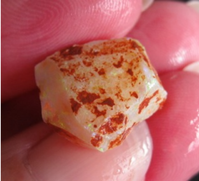
4. $357 IMG_0543 Mintubi Super Gem $225/gram 1.59grams