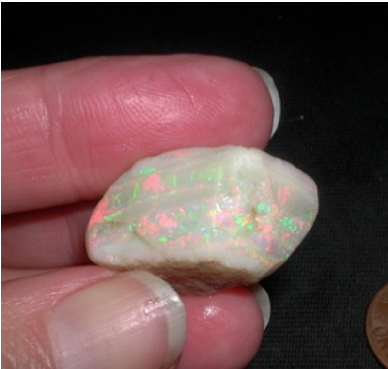
14. $920.50 MG5b Mintubi Gem Special $3,500/oz .263oz