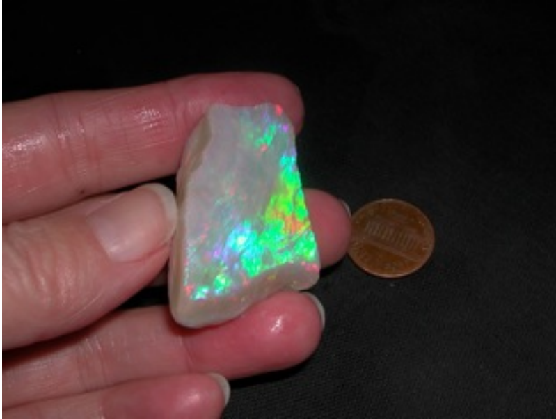
15. $1,132.50 MG3b Mintubi Gem Faced $2,500/oz .453oz