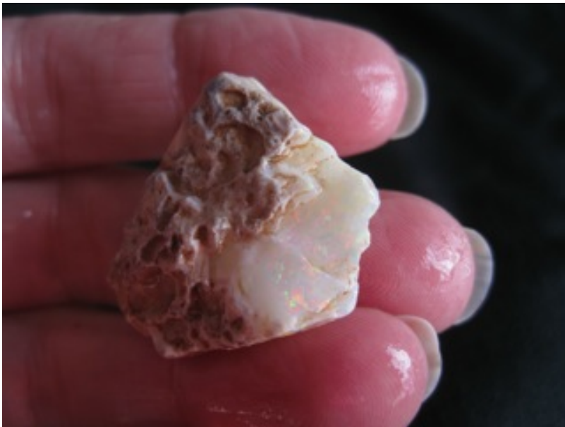
7. $462.50 IMG_0535 Coober Pedy 8 Mile $2,500/oz .185oz