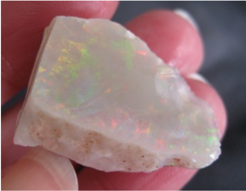
12. $750 IMG_0509 Jasper Field $3,000/oz .25oz