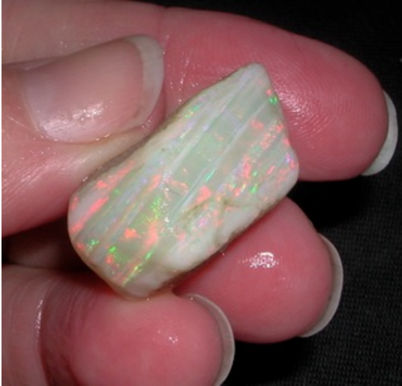
13. $920.50 MG5a Mintubi Gem Special $3,500/oz .263oz