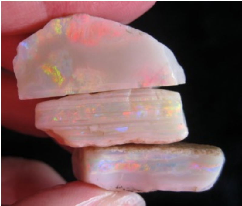
22. $1,923.60 IMG_0523 Mintubi Gem $2,800/oz .687oz