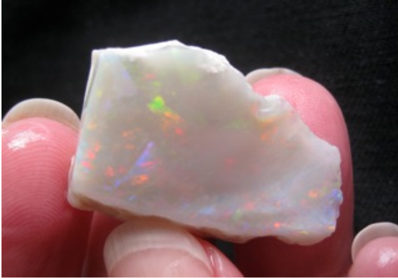
11. $750 IMG_0505 Jasper Field $3,000/oz .25oz