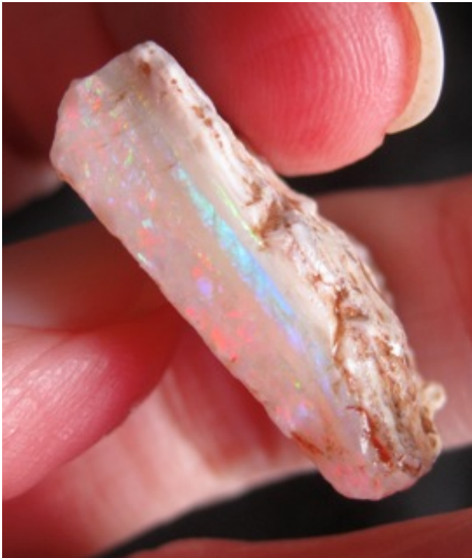
5. $462.50 IMG_0532 Coober Pedy 8 Mile $2,500/oz .185oz