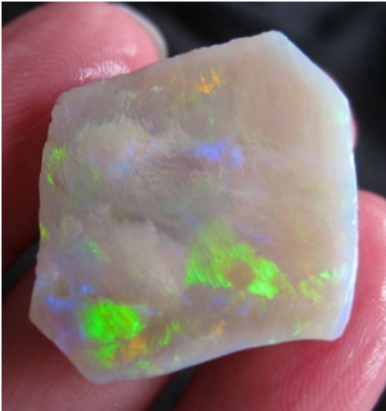
10. $700 IMG_0514 Mintubi Gem broad flash Green faced $3,500/oz .2oz