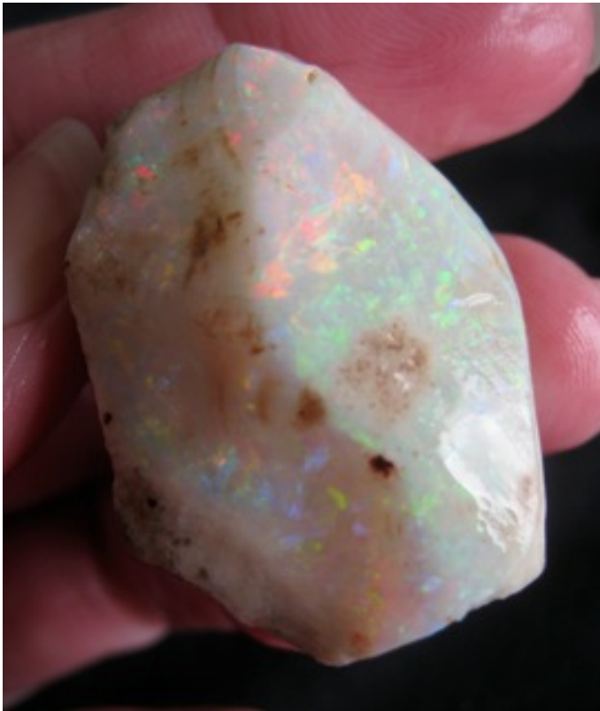
21. $1,560 IMG_0521 Coober Pedy $2,600/oz .6oz