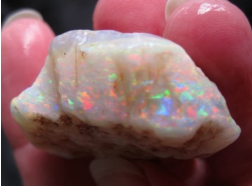
24. $2,047 IMG_0503 Shell Patch Gem $4,500/oz .55oz