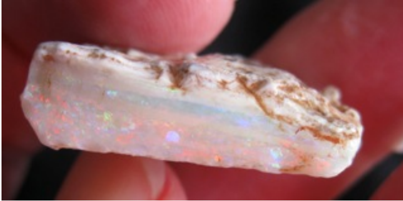
6. $462.50 IMG_0534 Coober Pedy 8 Mile $2,500/oz .185oz