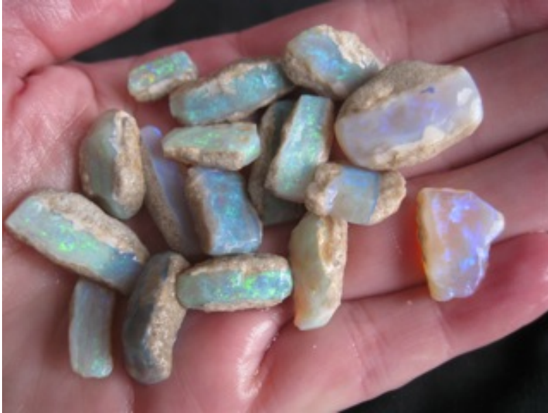
2. SOLD IMG_0483 Mintubi bright Blue Green Verticals some Dark Base $400/oz .85oz