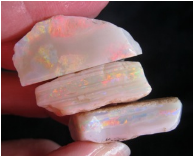
23. $1,923.60 IMG_0524 Mintubi Gem $2,800/oz .687oz