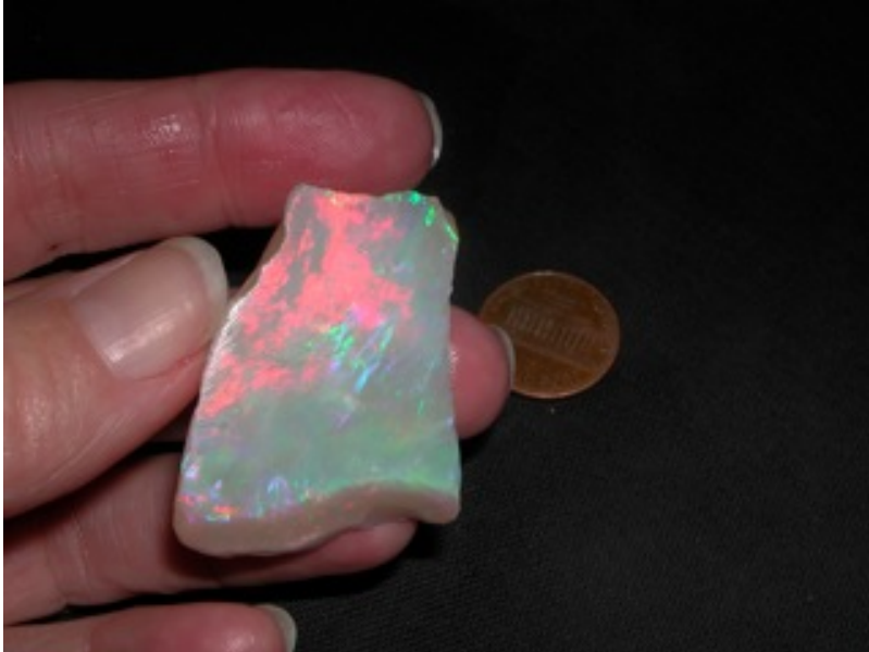
17. $1,132.50 MG3e Mintubi Gem Faced $2,500/oz .453oz