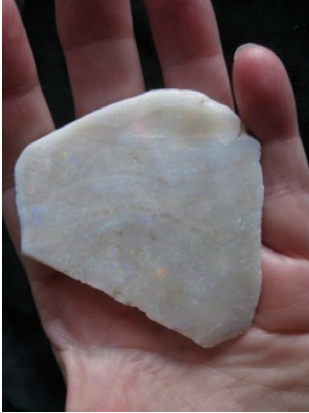
14. $357 IMG_3747 Mintubi Faced stone $300/oz 1.19oz