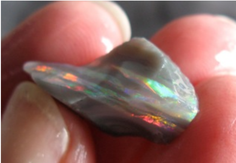
19. $468 IMG_5050 Mintubi Black $10,000/oz .0468oz