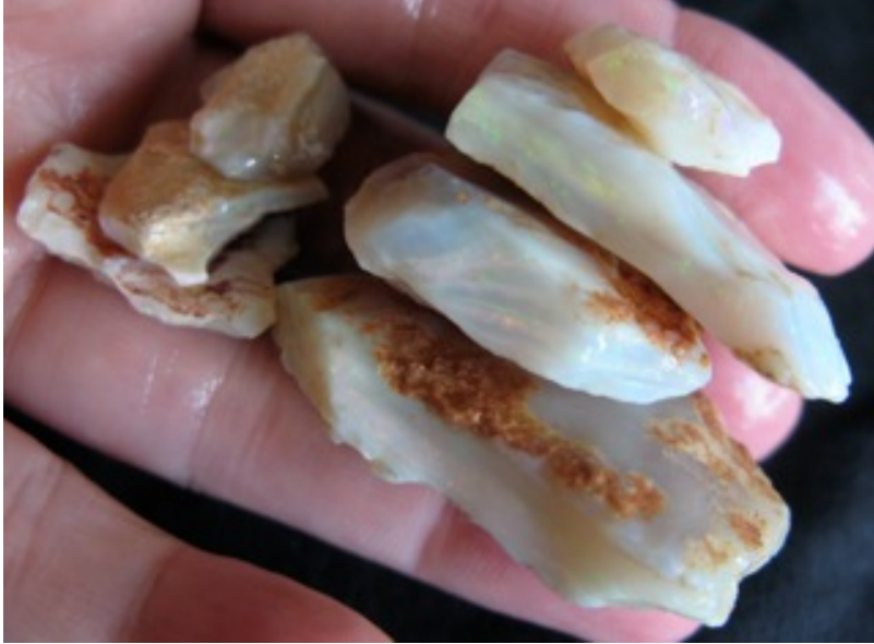
20. $600 IMG_6813 17 Mile Reds & Greens $400/oz 1.5oz