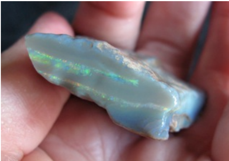
13. $342 IMG_6769 17 Mile Dark Base $500/oz .685oz