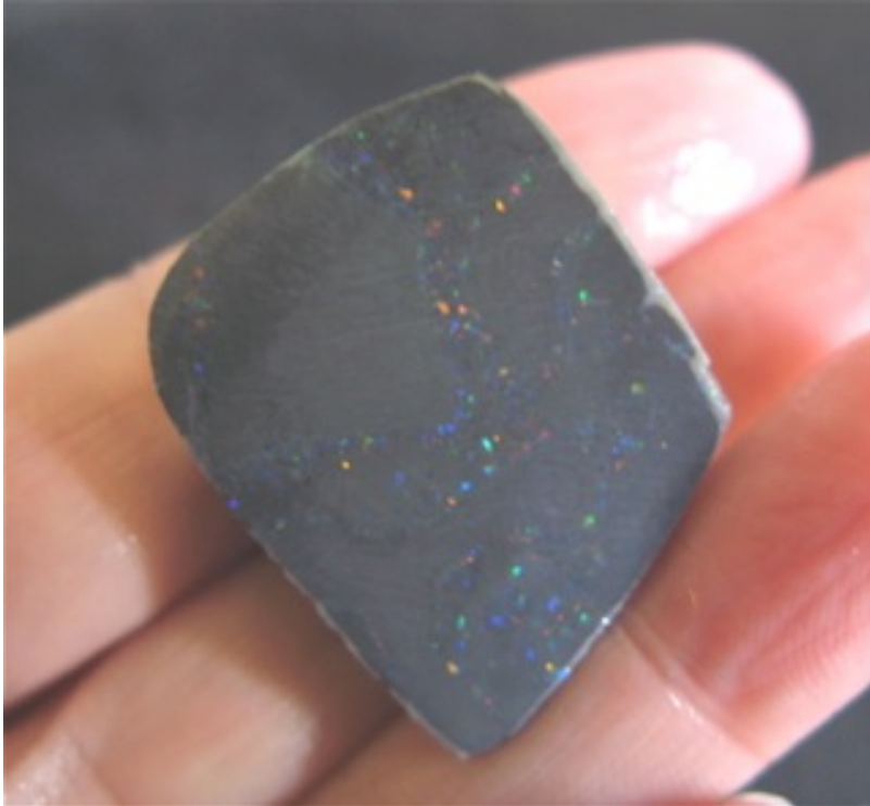
10. $260 IMG_1147.JPG Lightning Ridge Black Opal Rub .419oz "night lights"