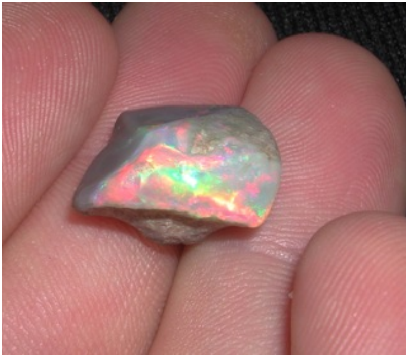
26. $1,350 DSCN2174.JPG Mintubi Black .09oz $15,000/oz