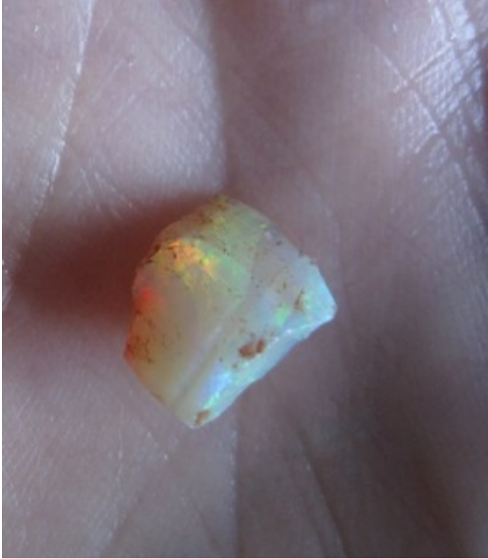
6. $154 IMG_3724 Andamooka Super Gem 2.38cts