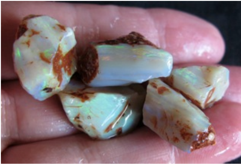
9. $220 IMG_6774 Lambina Dark Base very bright $400/oz .55oz