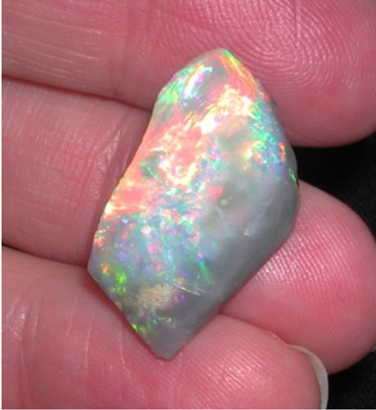
27. $2,000 DSCN2655.JPG Mintubi Gem Black .081oz