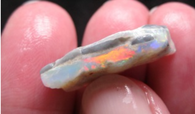
18. $459 IMG_9760 Mintubi Black Super Gem $225/gram 2.04g