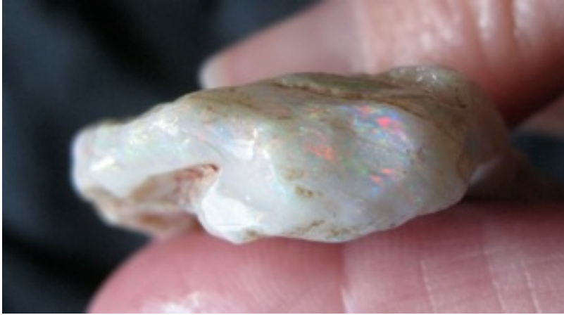
22. $640 IMG_3714 Andamooka Reds $1,500/oz .427oz