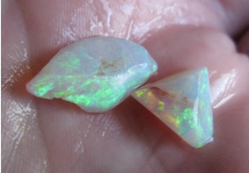
12. $325 IMG_3740 Andamooka Gems (2) 6.5cts