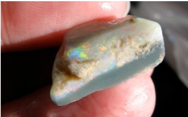
23. $1,011.60 IMG_1712.JPG Mintubi Black $12,000/oz .0843oz