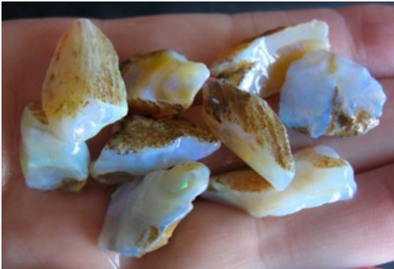
3. $61.46 IMG_6787 Queensland Opal $140/oz .439oz