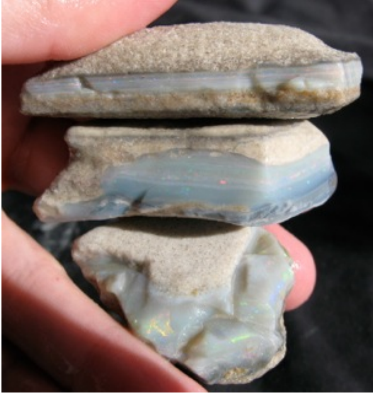
4. $72.50 IMG_3355 Mintubi Dark Base in Sandstone (3 stones) $25/oz 2.9oz (largest 60x30mm, thickest 10mm) terrific value from old stock