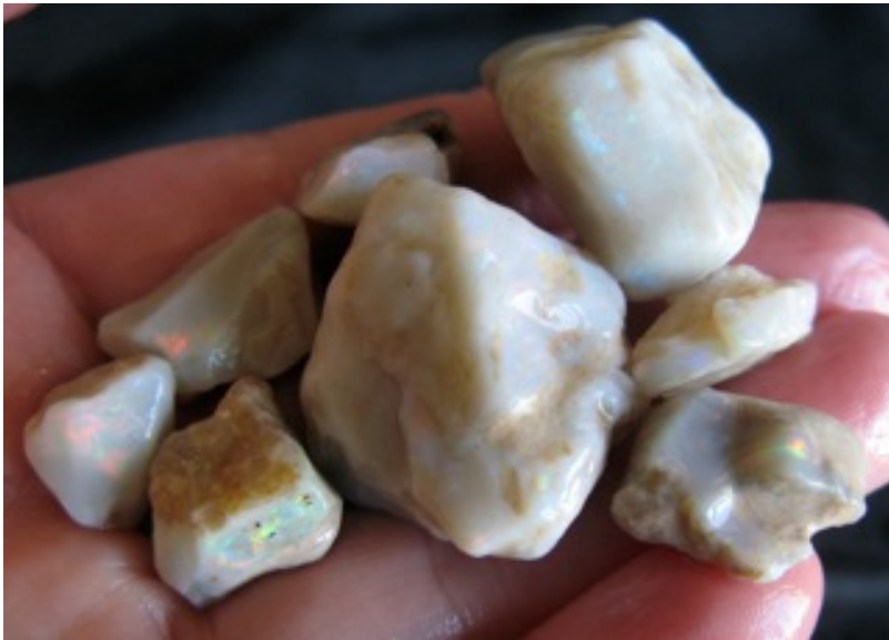
15. $373.75 IMG_6819 Dead Horse Gully 1.15oz