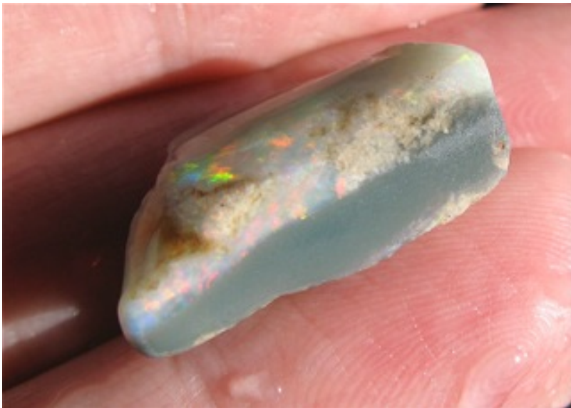
24. $1,011.60 IMG_1715.JPG Mintubi Black $12,000/oz .0843oz