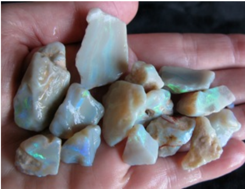
11. $300 IMG_6781 Dead Horse Gully $200/oz 1.5oz