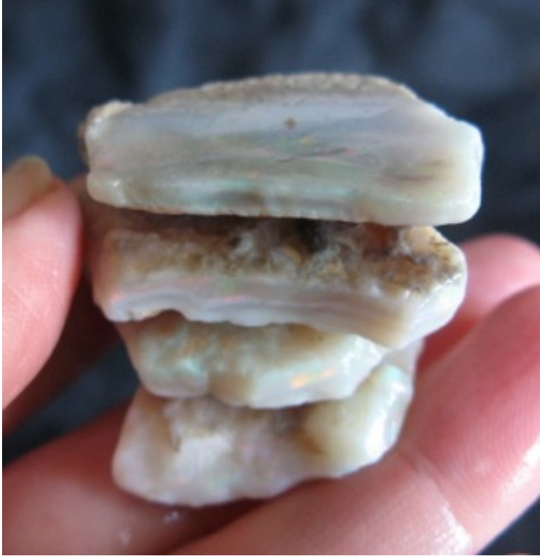
8. $217 IMG_6784 Mintubi $250/oz .87oz