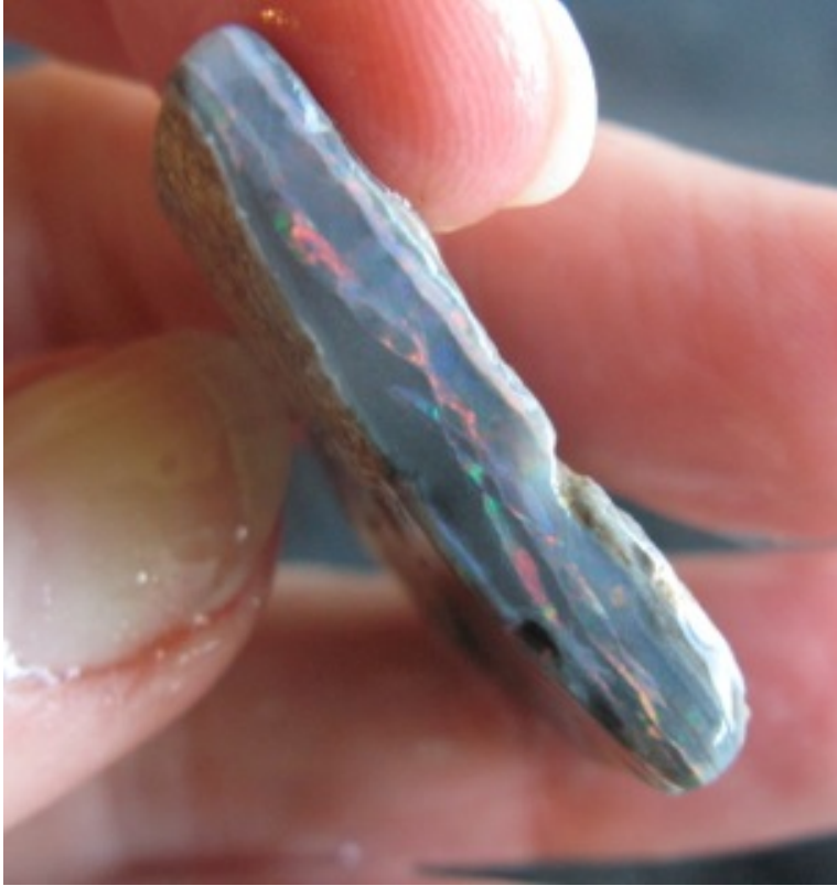
29. $3,258 IMG_5606 Mintubi Black $6,000/oz .543oz