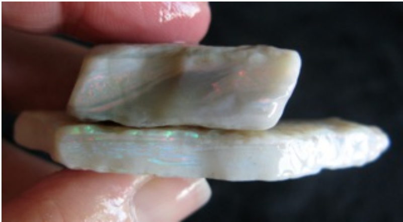
5. $143.10 IMG_6790 Mintubi Plate Grey Base $150/oz