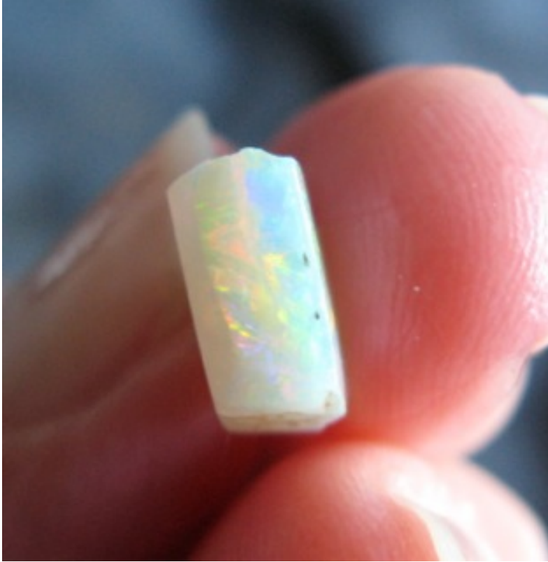
2. $60 IMG_6765 Andamooka Gem 2.7cts