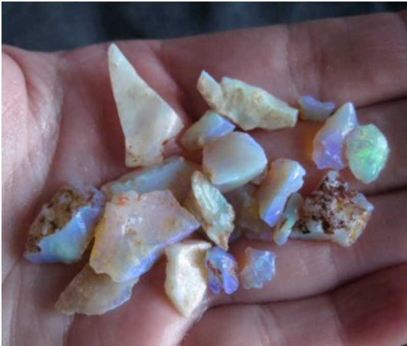
17. $400 IMG_3705 Andamooka $800/oz .5oz