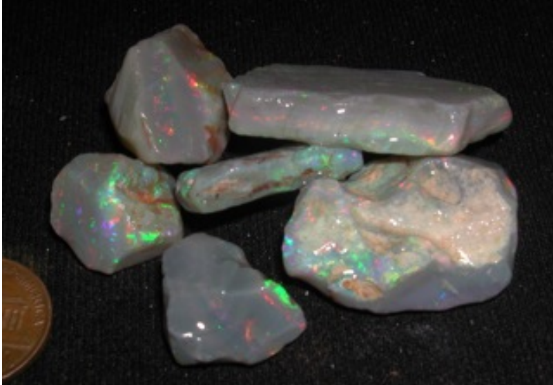
25. $1,097 DSCN3923 Lambina Dark Base .998oz $1,100/oz