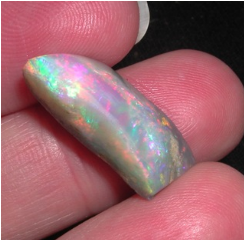
28. $2,000 DSCN2658.JPG Mintubi Gem Black .081oz