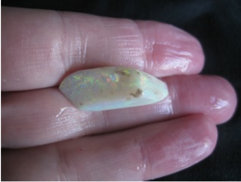
16. $374 IMG_3725 Andamooka Green Orange Gem $128/gram 2.922 grams