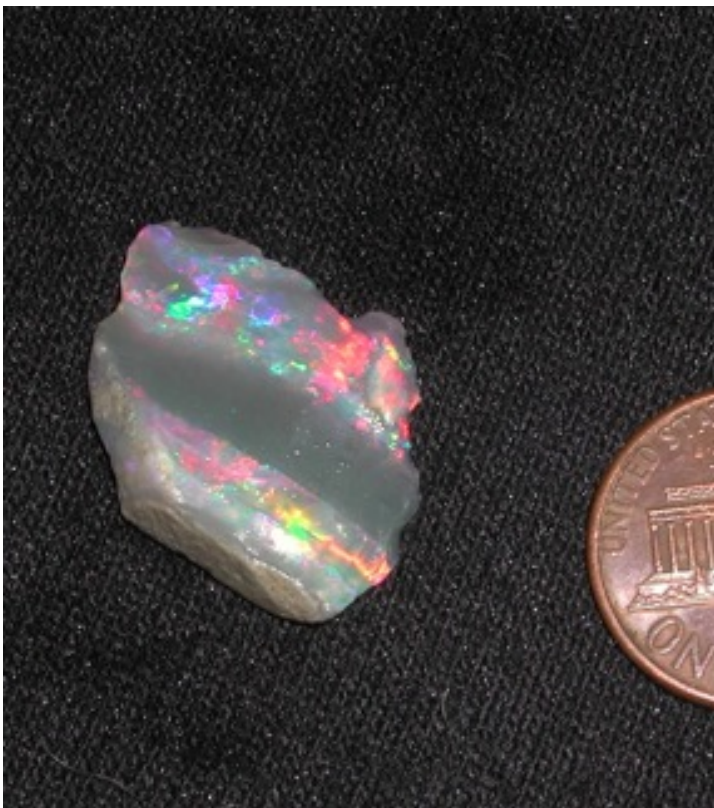
21. $624 DSCN4378 Mintubi Black Gem Special #11 .052oz $12,000/oz