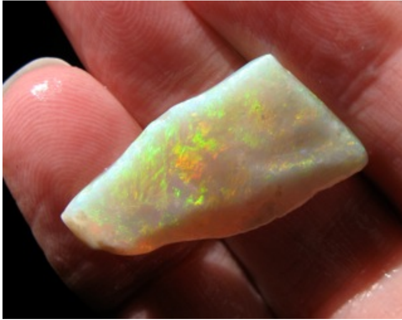
25. $760 IMG_3386 Mintubi Super Gem double sided $10,000/oz .076oz (22x14x4-5mm thick) "a beauty"