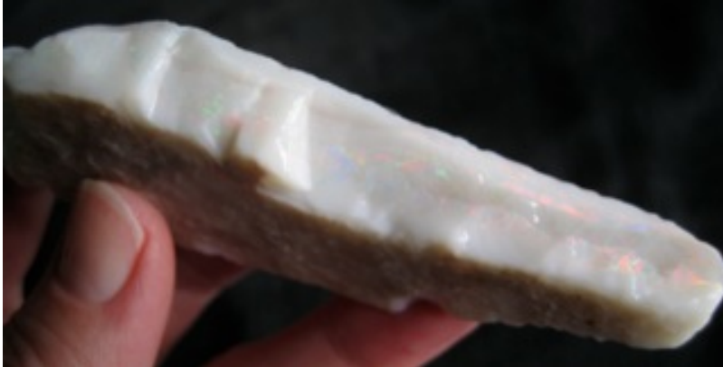
19. $360 IMG_9704 Mintubi White Base Reds 1.44oz 85mm x 20mm x 12mm thick $250/oz