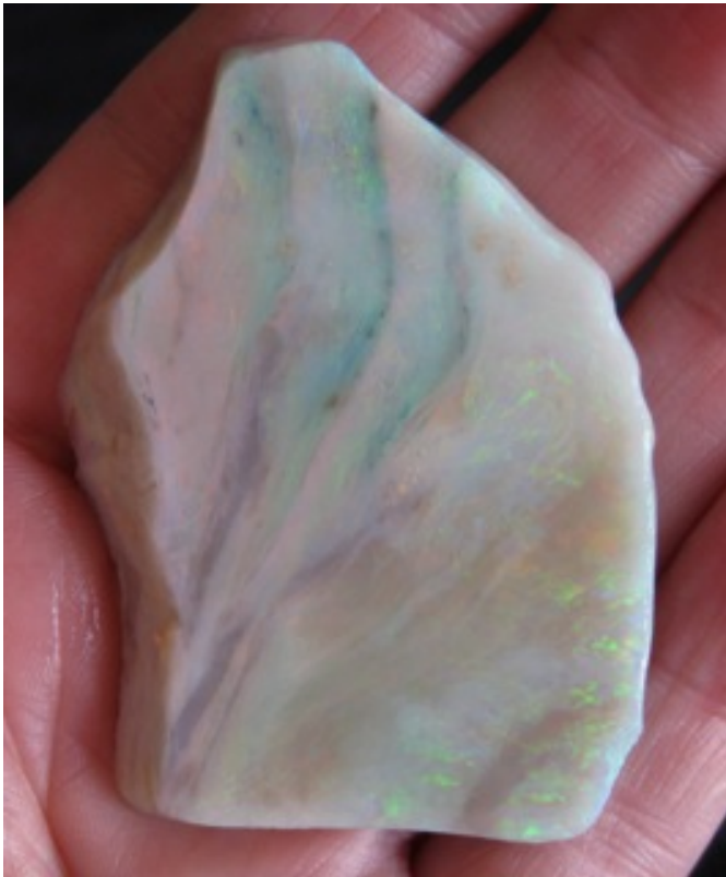
22. $528 IMG_0197 Mintubi Picture Stone $800/oz .661oz