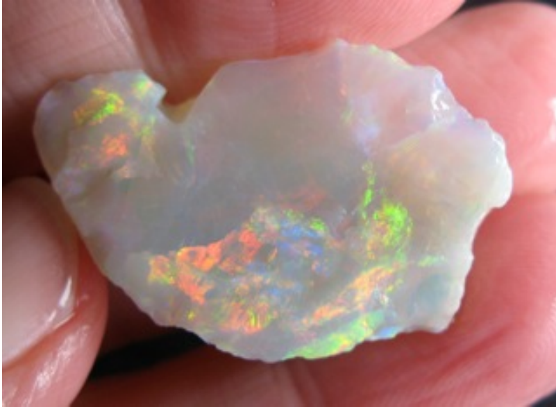
27. $910 IMG_4918 Mintubi Vertical $5,000/oz .182oz