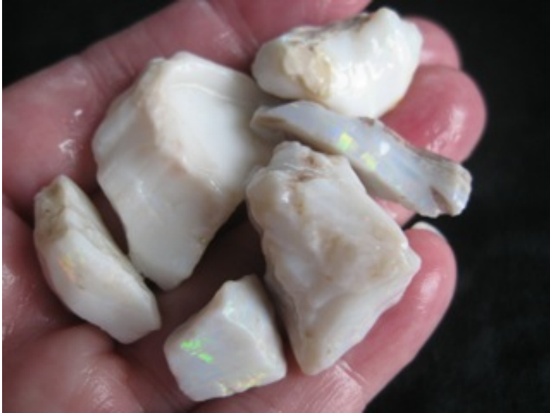
8. $188 IMG_0673 Mintubi $200/oz .94oz