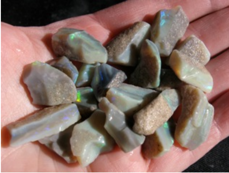
6. $95 IMG_3369 Mintubi Dark Base Greens