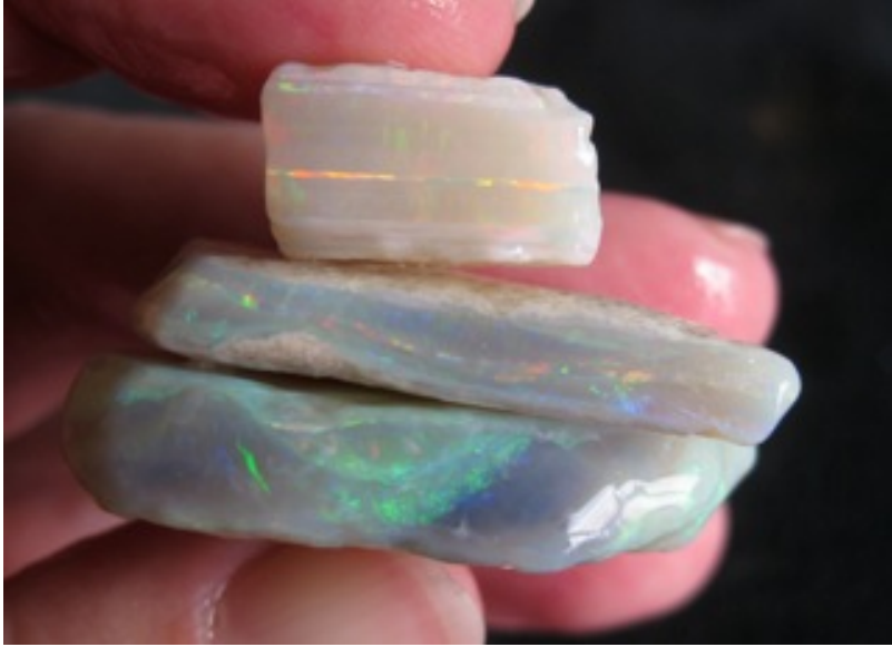
16. $248 IMG_9775 Mintubi Gems Greens & Reds $400/oz .62oz