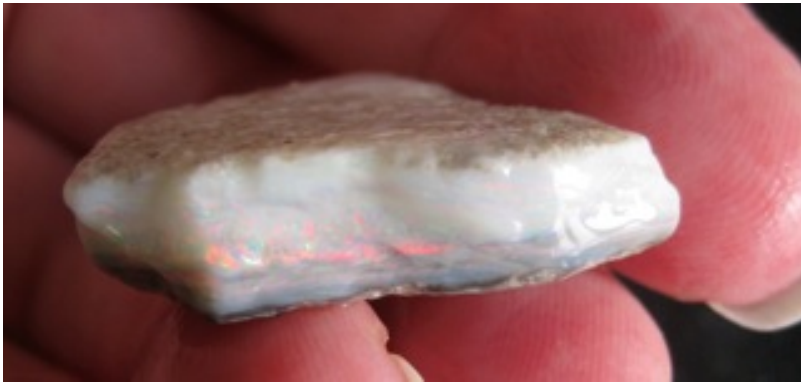
5. $94.50 IMG_1174 Mintubi White Base $16.30/g 5.84g