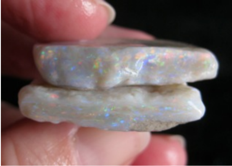
14. $240 IMG_9791 Mintubi Reds Greens some Purples $600/oz .4oz