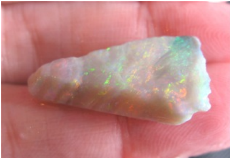
20. $395 IMG_1765 Mintubi Dark Base Super Gem solid colours .067oz (22x14mm)