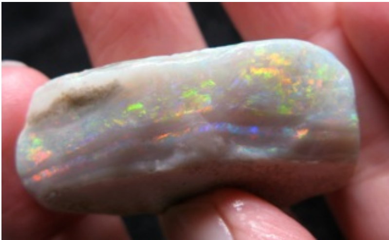
30. $3,000 IMG_4914 Mintubi Dark Base striped .639oz