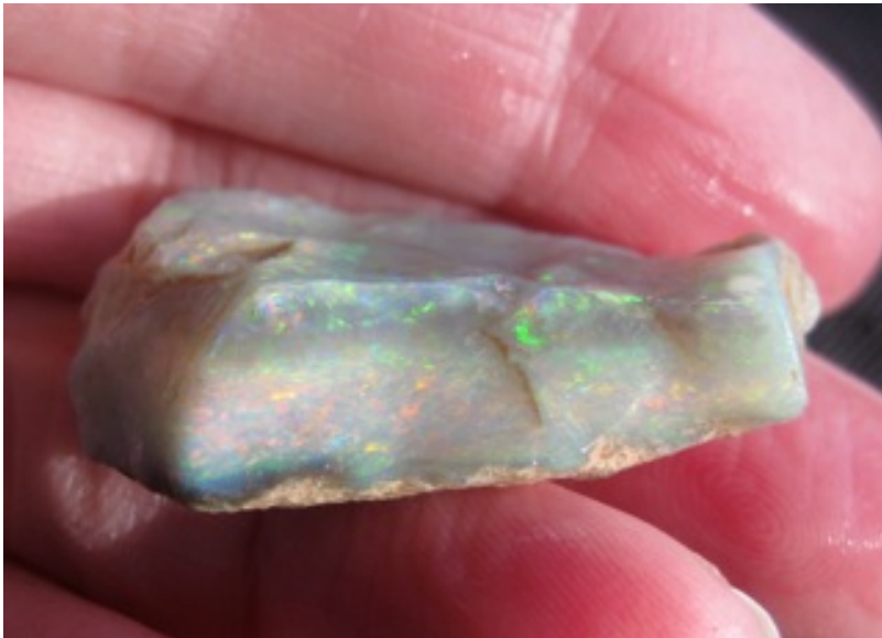
24. $640 IMG_1769 SPECIAL Mintubi "Licorice" $96/g 6.67 grams