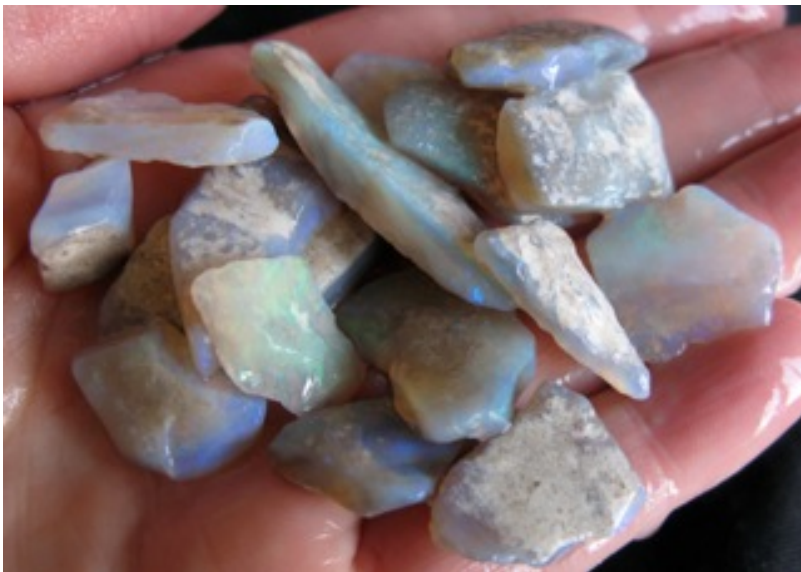
9. $200 IMG_4895 Mintubi Dark Base 1oz