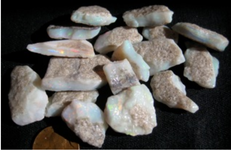
21. $500 IMG_1062 Mintubi Reds & Greens very bright little stones $400/ oz 1.25oz