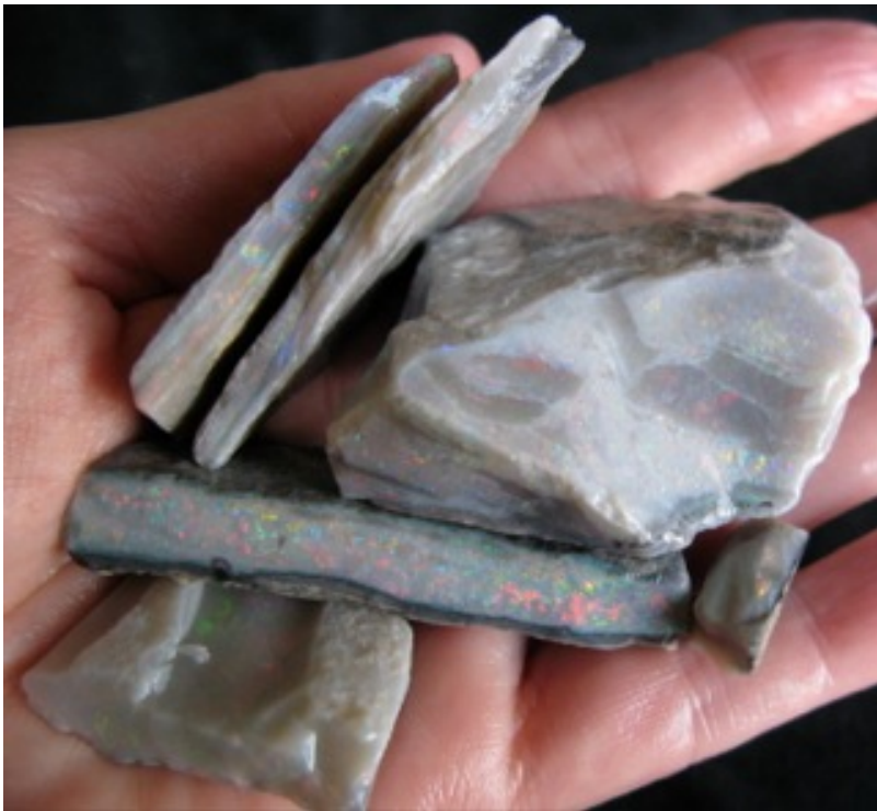
28. $1,350 IMG_4902 Mintubi Black $450/oz 3oz