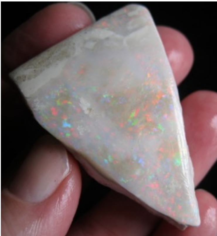
7. $150 IMG_9742 Mintubi Specimen can cut solids approx 50mm x 35mm