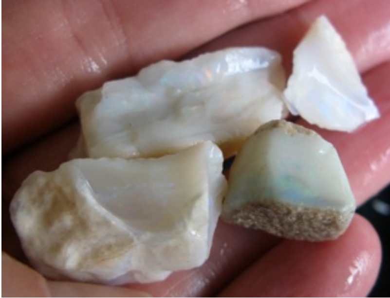
2. $46 IMG_4894 Mintubi Reds & Greens $125/oz .375oz