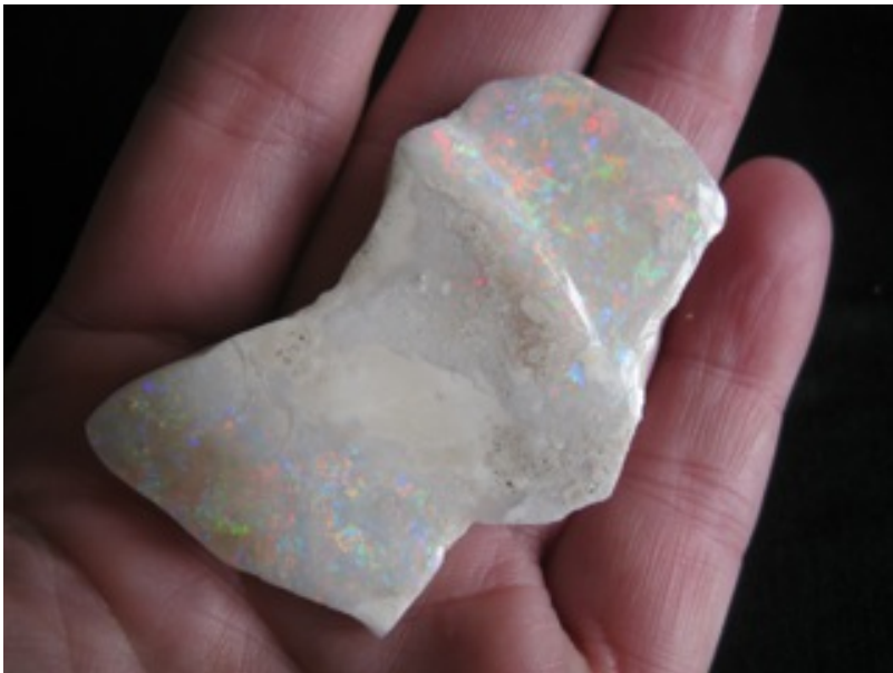
11. $200 IMG_9801 Mintubi specimen can cut solids approx 55mm x 30mm