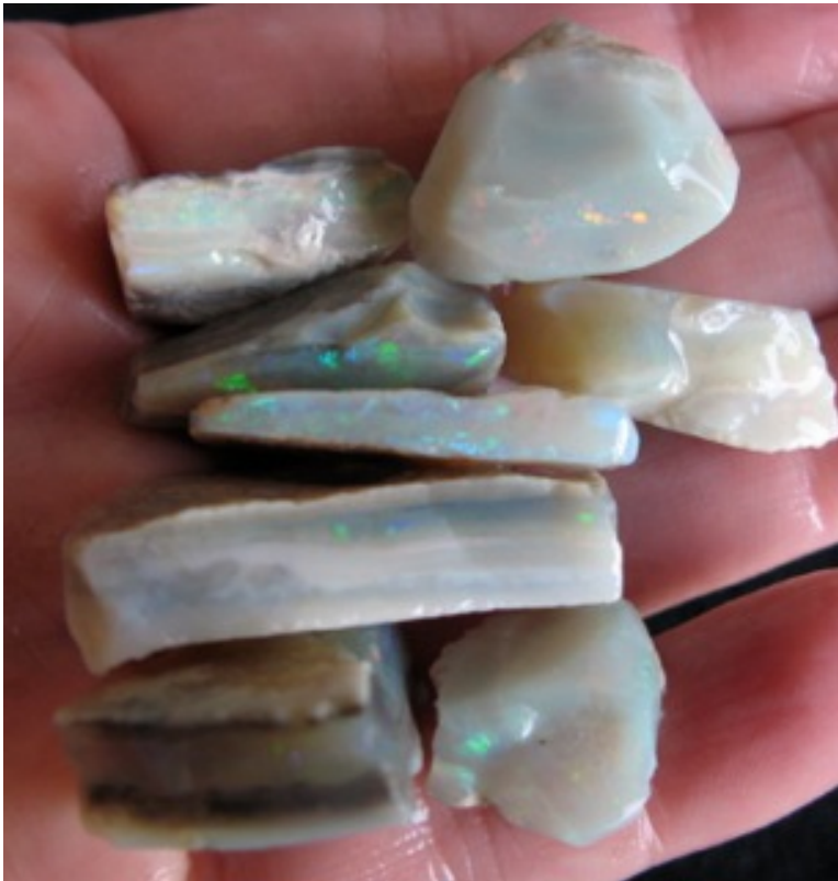
17. $255 IMG_4907 Mintubi Mixed $100/oz 2.55oz