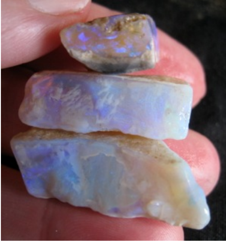
4. $94 IMG_9370 Mintubi Dark Base $200/oz .47oz