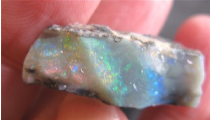
10. $218.40 IMG_1811 Mintubi Dark $1,200/oz .182oz (30mm x 11mm)