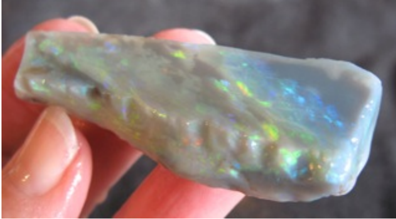
29. $1,691 IMG_1786 Mintubi Black $2,750/oz .615oz (65x20mm)