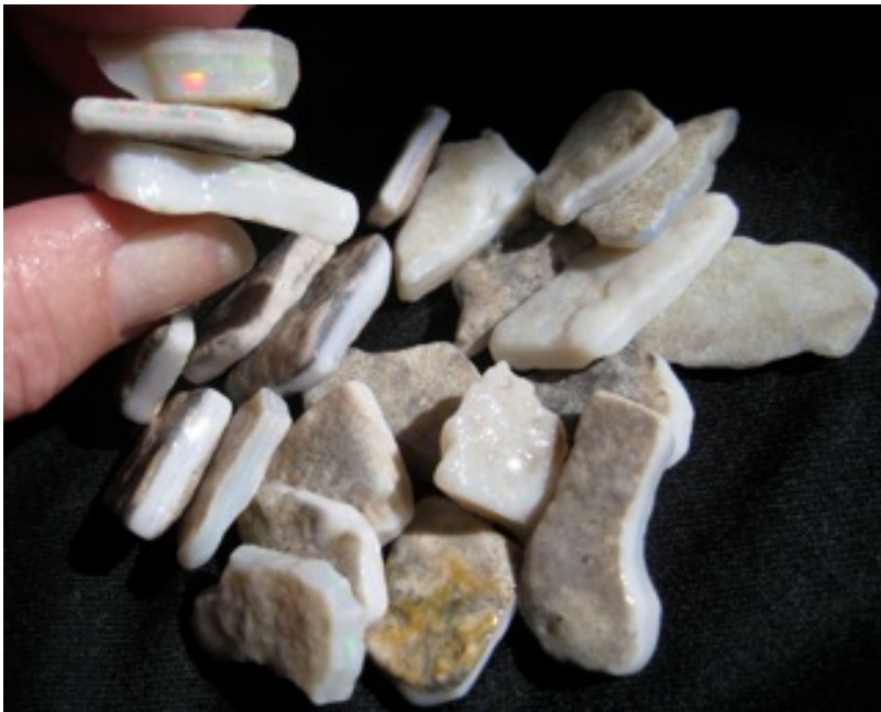
13. $200 IMG_0686 Mintubi Bars $100/oz 2oz