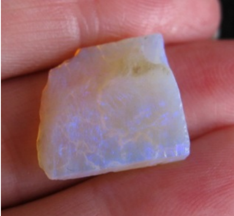
12. $200 IMG_0219 Mintubi Blue Green Crystal .06oz approx 15mm x 5mm