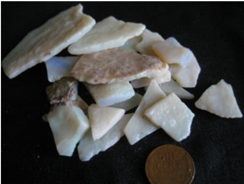
3. $72 IMG_9351 Mintubi thin material for Triplets or Doublets $60/oz 1.2oz