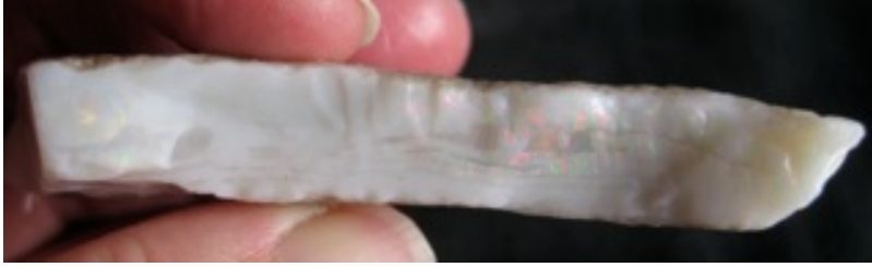
18. $302 IMG_9708 Mintubi White Base Reds 60mm x 25mm x 12mm thick 1.21oz $250/oz