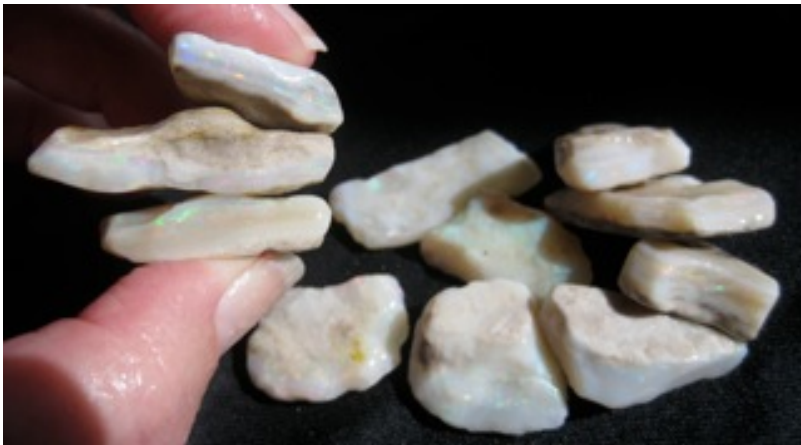
15. $240 IMG_0682 Mintubi White Base Reds & Greens $150/oz 1.6oz