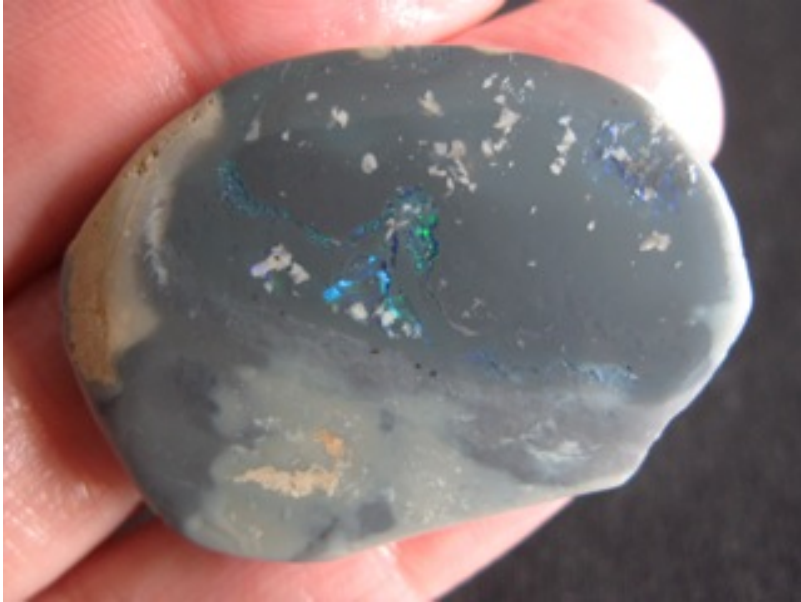
2. $42 IMG_0016 Lightning Ridge 41.5cts