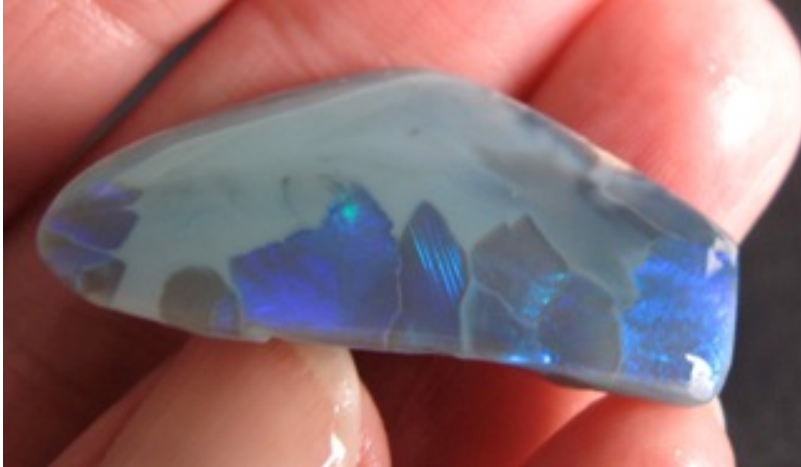
6. $76 IMG_0030 Lightning Ridge Black broad brilliant patterns blue green 23.4cts