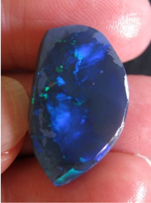
23. $800 IMG_9024 Lightning Ridge Black Rub blues greens reds 13.35cts 25mm x 15mm