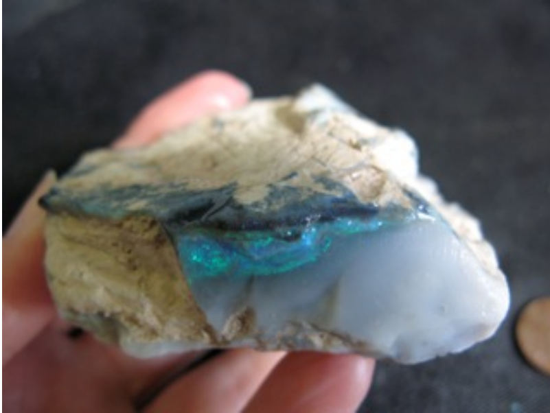
29. $2,000 IMG_1168.JPG Lightning Ridge 70x60x25mm 4.5oz