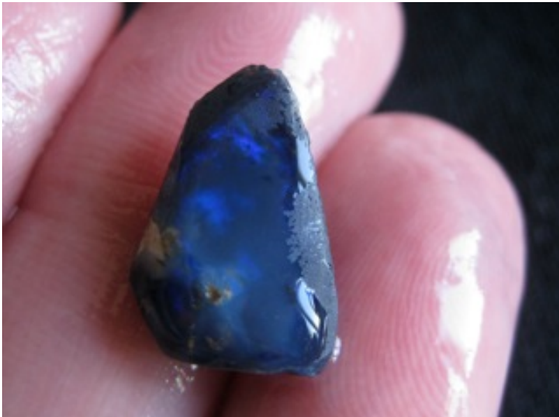
22. $600 IMG_9045 Lightning Ridge Rub .029oz