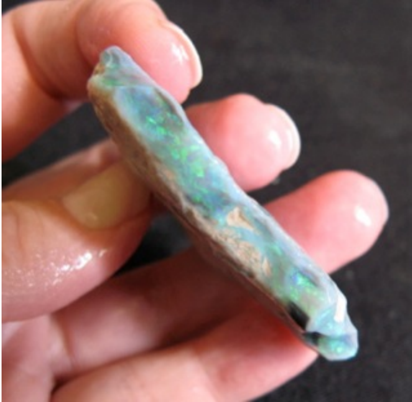
31. $2,000 IMG_1189.JPG Lightning Ridge 50x35mm .729oz