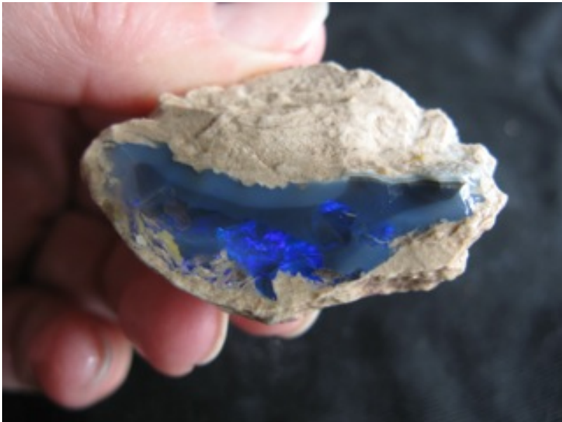
18. $420 IMG_5042 Lightning Ridge (1 really great Black) $400/oz 1.05oz