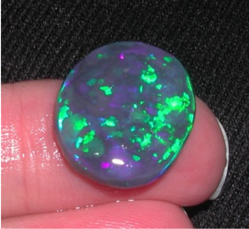
27. $1,800 DSCN0961.JPG Lightning Ridge Greens & Blues Gem 9.776cts