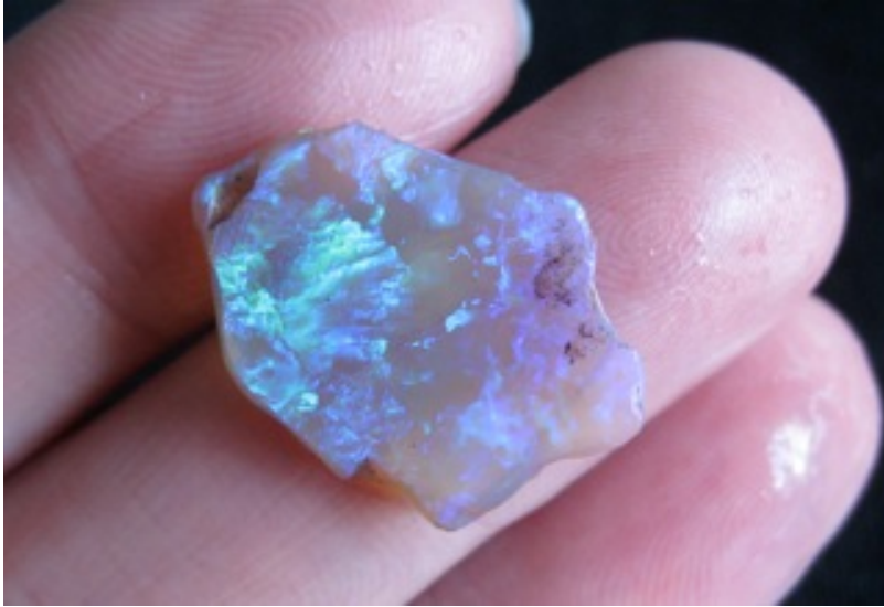
7. $154.50 IMG_9078 Lightning Ridge Rub $150/g 1.03g