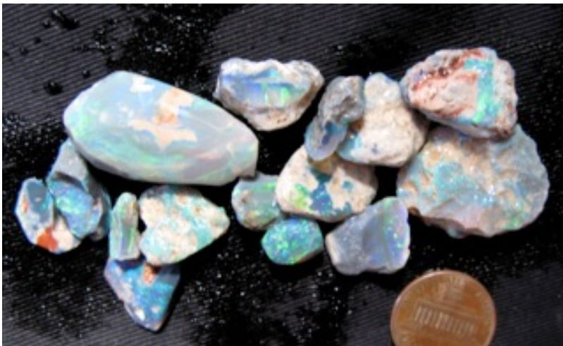
24. $900 the lot IMG_0238.JPG Lightning Ridge .73oz