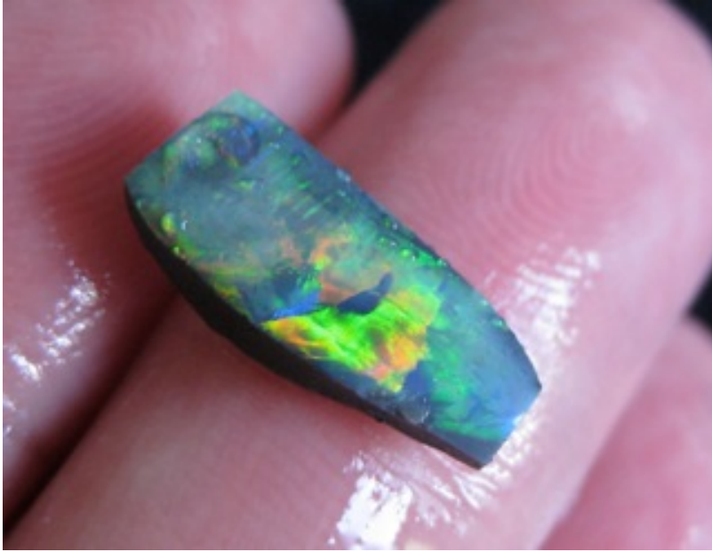
25. $900 IMG_9032 Lightning Ridge Super Gem Rub 2.41cts