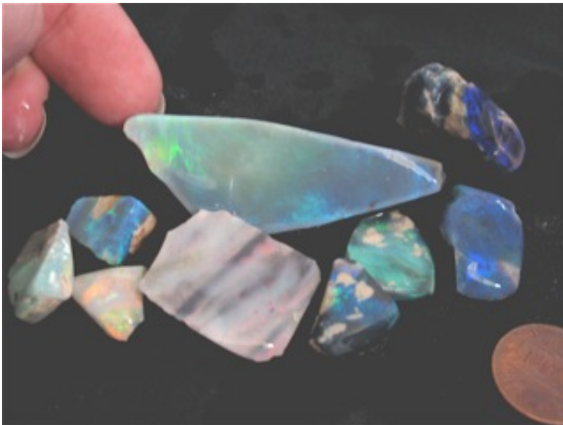
12. $300 IMG_8350.JPG Lightning Ridge Ridge Faced 1oz