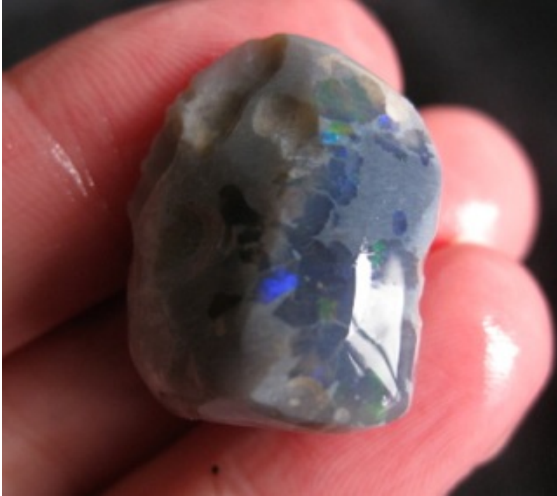
11. $295 IMG_9889 Lightning Ridge Black 39.18cts (reds, greens & blues)