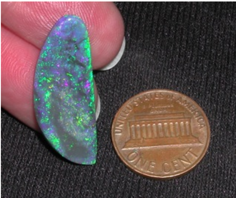
26. $1,000 DSCN0008.JPG Black Mintubi 6.79cts