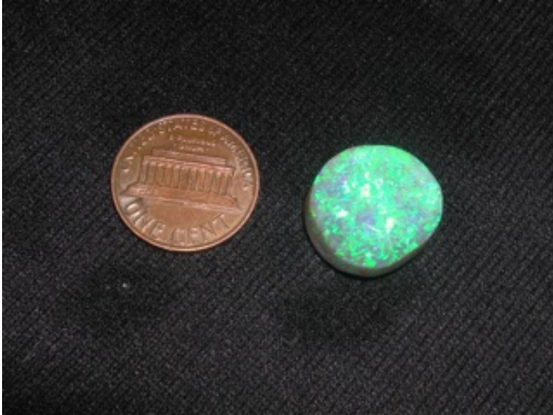
21. $600 DSCN0953.JPG Lightning Ridge Green Crystal Rub 17.23 carats