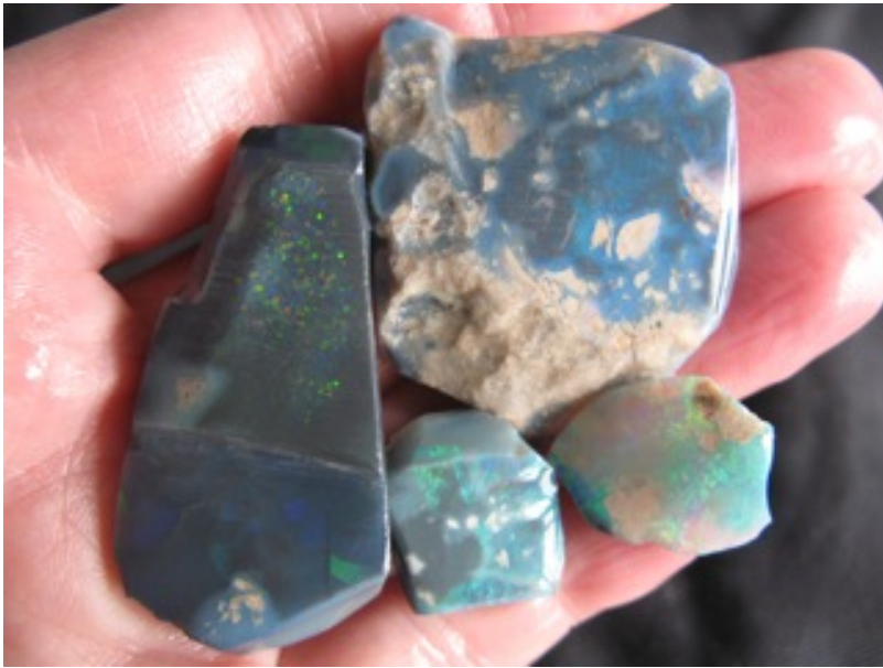
16. $405 IMG_5012 Lightning Ridge Blacks $500/oz .81oz