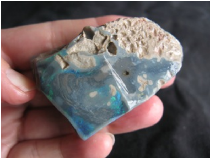
8. $175 IMG_5028 Lightning Ridge Monster Black Opal colour in the top 1.69oz - this will make a great "picture stone" or carving stone