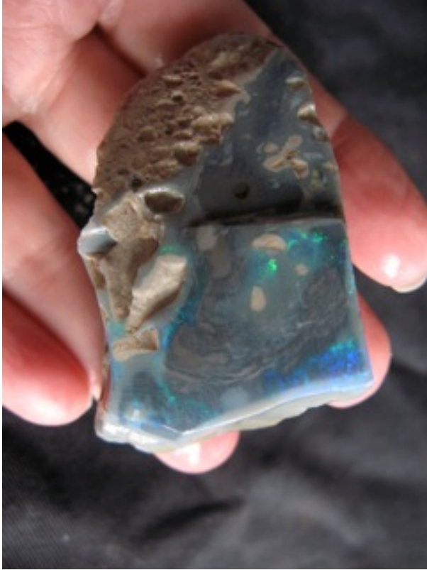
9. $175 IMG_5030 Lightning Ridge Monster Black Opal colour in the top 1.69oz - this will make a great "picture stone" or carving stone