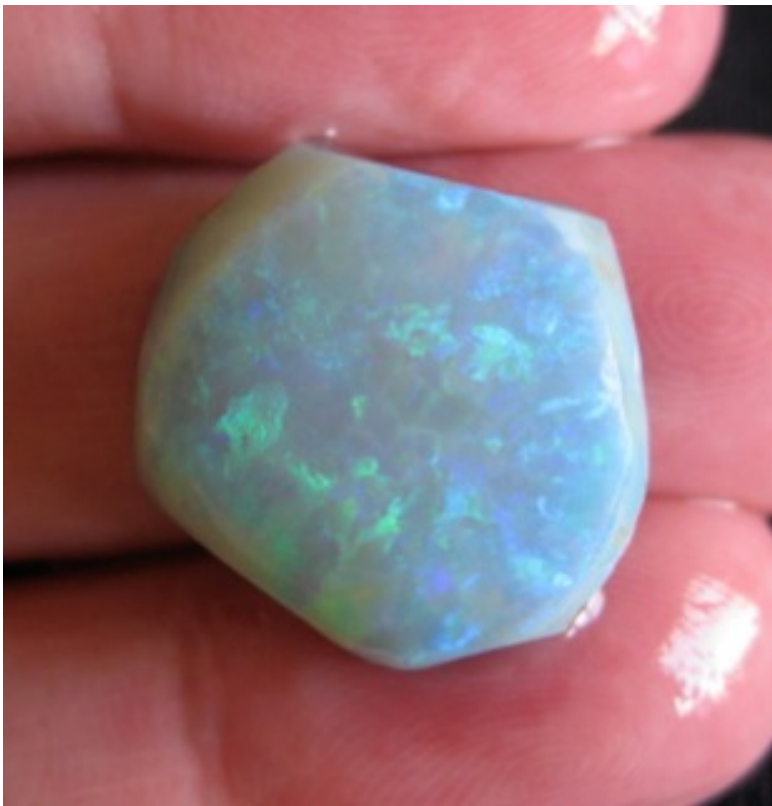
30. $2,000 IMG_9003 Lightning Ridge Crystal Blue Green Rub 20mm x 18mm x 7mm 17.1cts