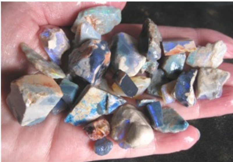
10. $234 IMG_5030.JPG Lightning Ridge off cuts (28 stones, each stone will cut some sort of stone) 2.34oz