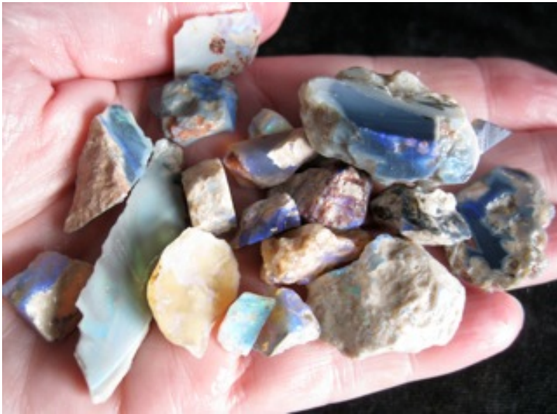
4. $80 IMG_5046.JPG Lightning Ridge off cuts $50/oz 1.6oz