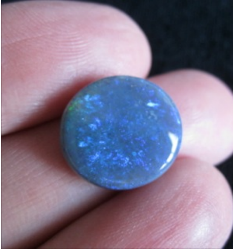
19. $450 IMG_9071 Lightning Ridge 8.02cts 16mm x 15mm