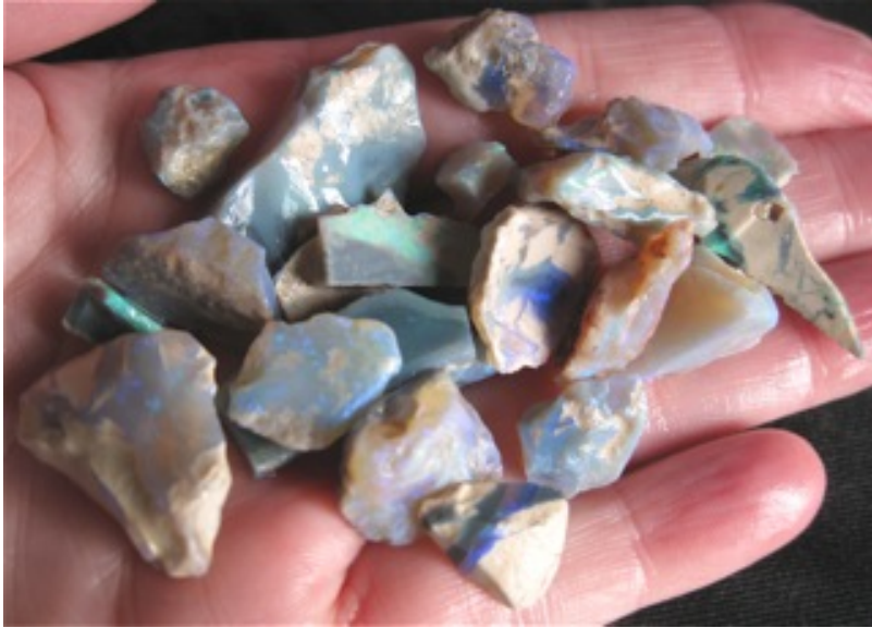
3. $75 IMG_5032.JPG Lightning Ridge off cuts 1oz