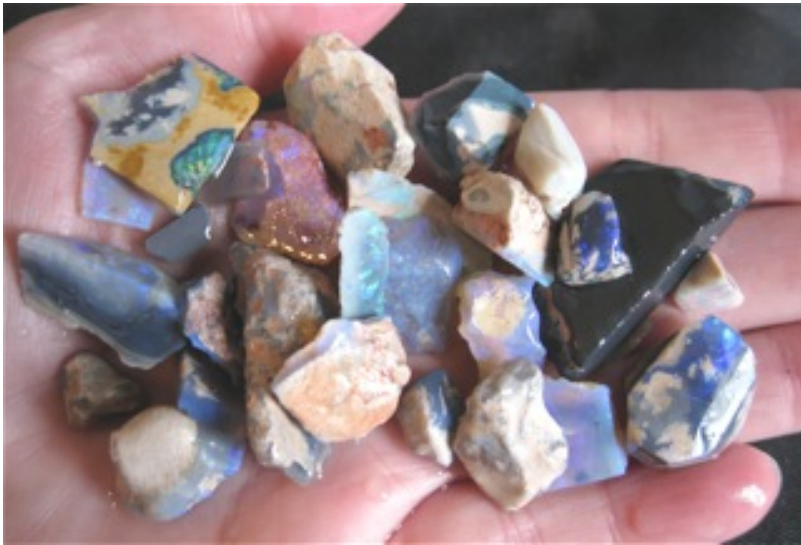
6. $150 IMG_4952.JPG Lightning Ridge very bright off cuts 1.5oz