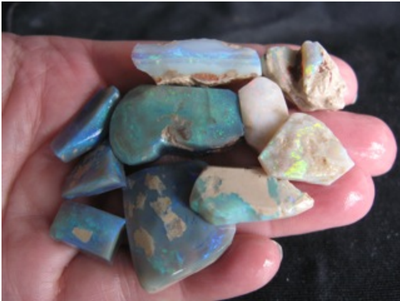
20. $495 IMG_5025 Lightning Ridge all colours (10 stones) 1oz