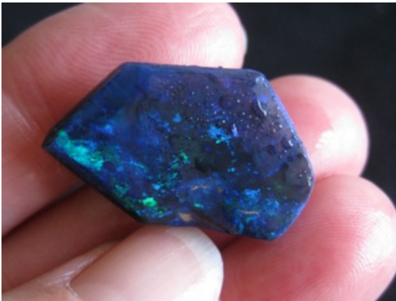
32. $2,250 IMG_9022 Lightning Ridge Electric Blue Rub 15.24cts