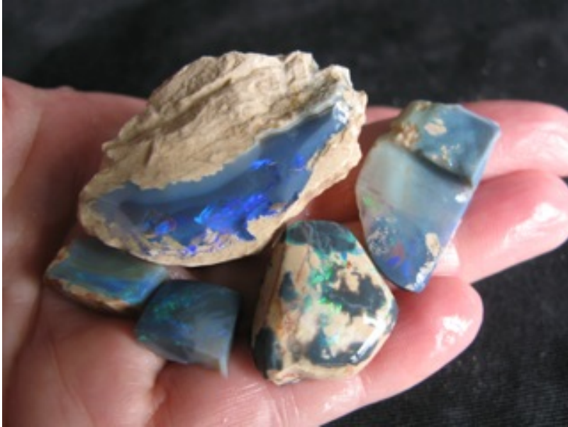
17. $420 IMG_5039 Lightning Ridge (1 really great Black) $400/oz 1.05oz