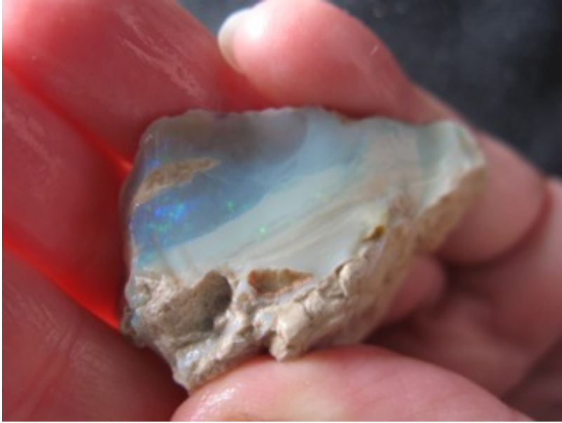
15. $353 IMG_5020 Lightning Ridge $600/oz .589oz