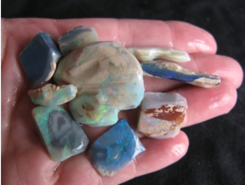
13. $340 IMG_5035 Lightning Ridge Mixed including Black $400/oz . 85oz