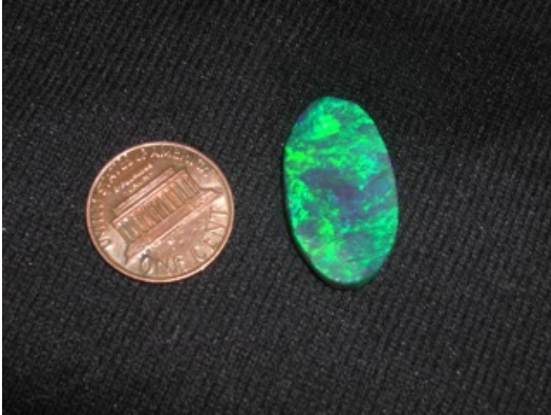
33. $2,800 DSCN0946 Lightning Ridge Rub