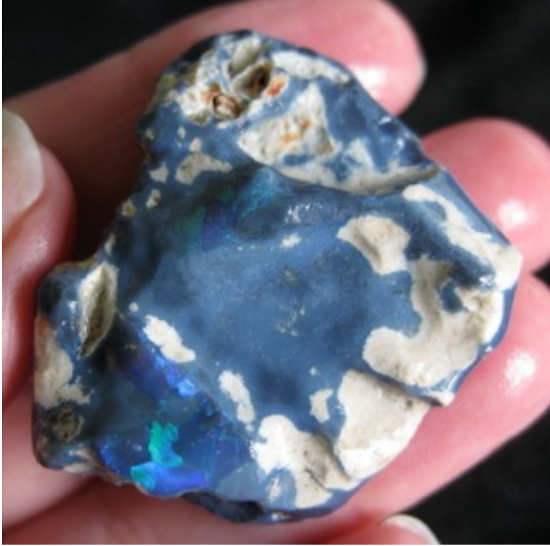
5. $125 IMG_7658 Lightning Ridge Black Opal .6oz