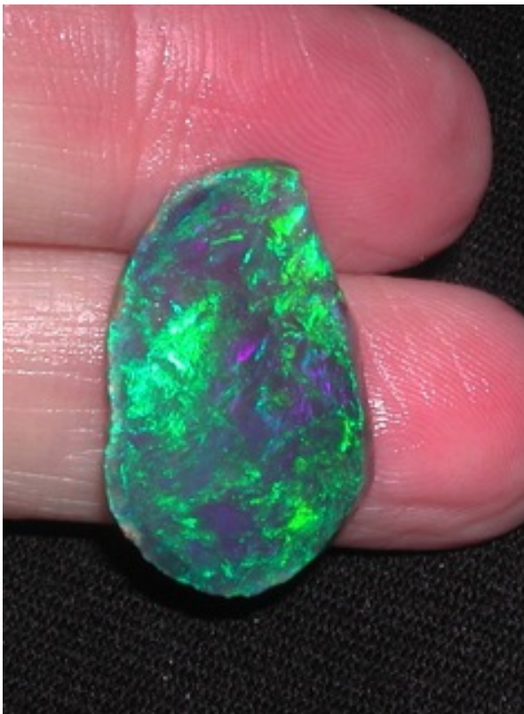
28. $1,800 the stone DSCN0736.JPG Lightning Ridge 9.93 carats