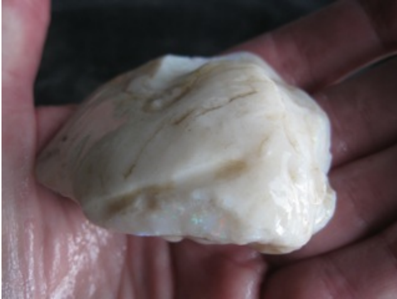
$2,400 IMG_1246 Shell Giant 1.95oz 64mm x 50mm x 25mm 302cts