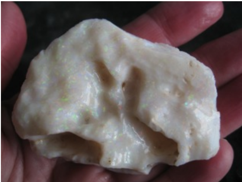
$2,400 IMG_1235 Shell Giant 1.95oz 64mm x 50mm x 25mm 302cts