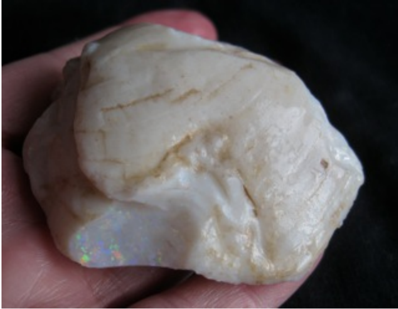
$2,400 IMG_1229 Shell Giant 1.95oz 64mm x 50mm x 25mm 302cts