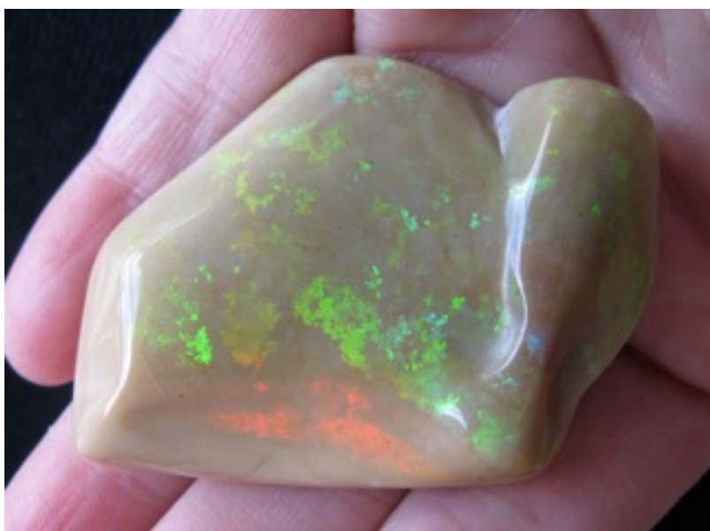
2. $245 IMG_7860 Andamooka Natural Honey Matrix 133.9cts - make a magnificent pendant