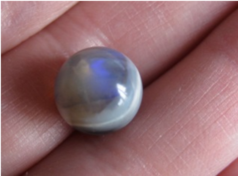
18. $66 IMG_9147 Lightning Ridge Black 11mm round loose bead 6.64cts