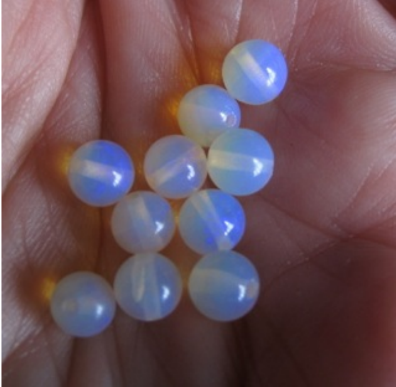
15. SOLD IMG_9334 Andamooka Blues 5mm round (10) $5.30/ct 9cts