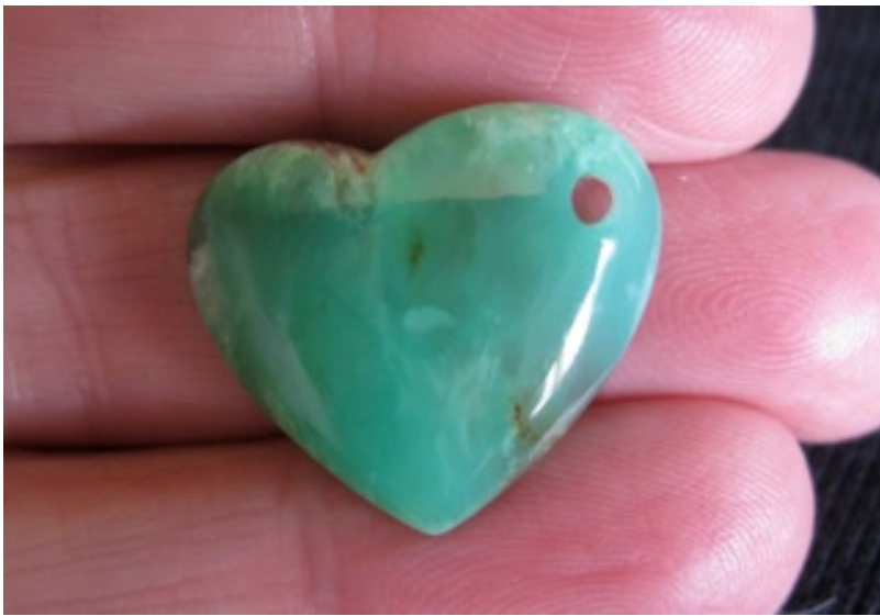
8. SOLD IMG_9562 Chrysoprase Heart front/side drilled 22mm x 18mm