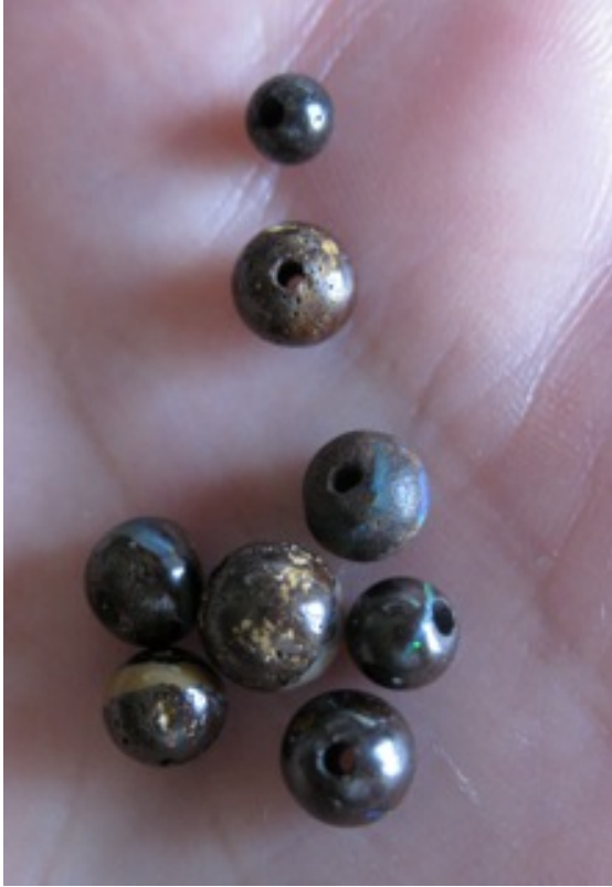
1. $10 IMG_9571 Boulder 4-7mm round loose beads (8)