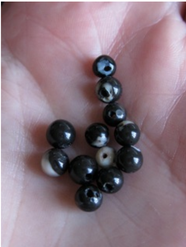
2. $11.50 IMG_9564 Lightning Ridge 4-6mm round loose beads (12)