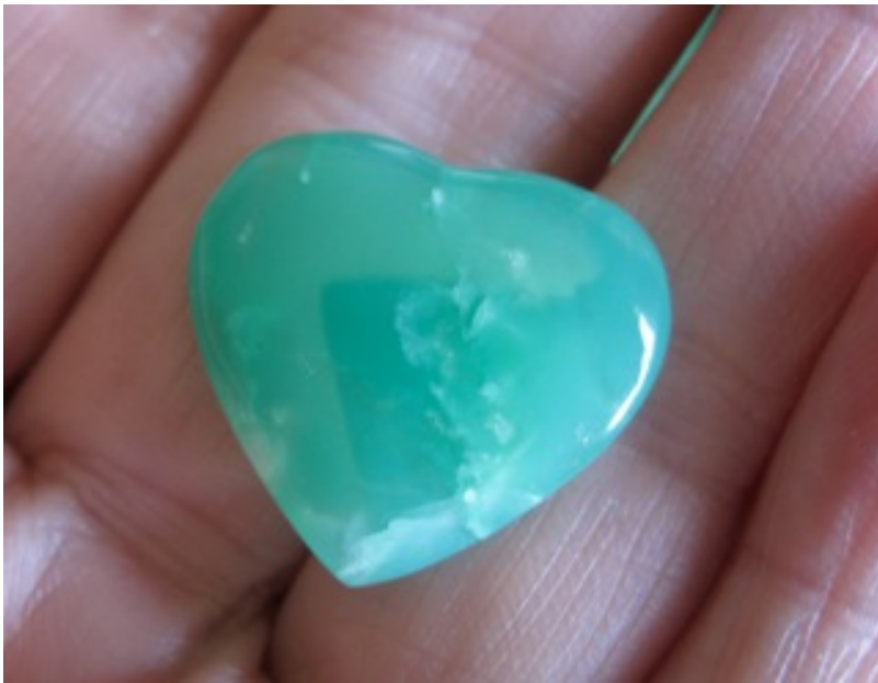
6. $20 IMG_9549 Chrysoprase Heart top drilled 21mm x 20mm