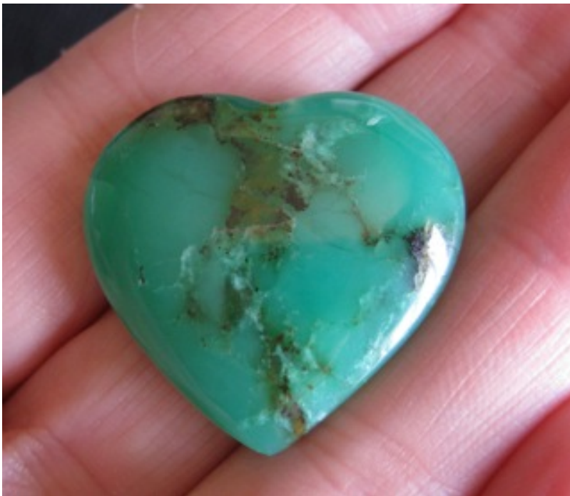
14. $40 IMG_9558 Chrysoprase Heart top drilled 28mm x 25mm