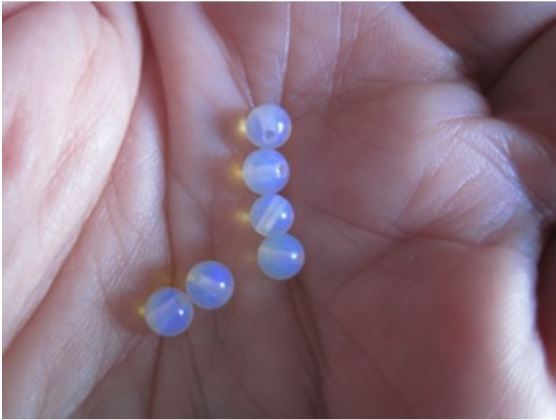
3. SOLD IMG_9331 Andamooka Blues 4mm round (6) $5.30/ct 2.41cts