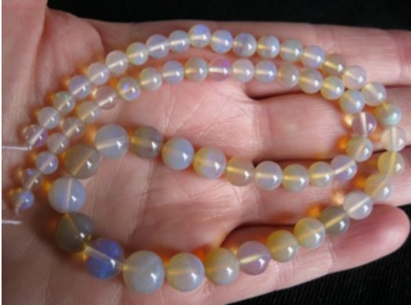
25. $324 IMG_6782 Andamooka some Crystal all translucent 6-10mm round 108cts