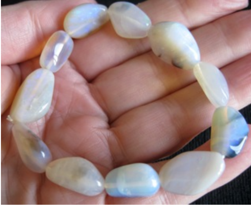
17. $60 IMG_9544 Lambina Freeform bracelet 90cts