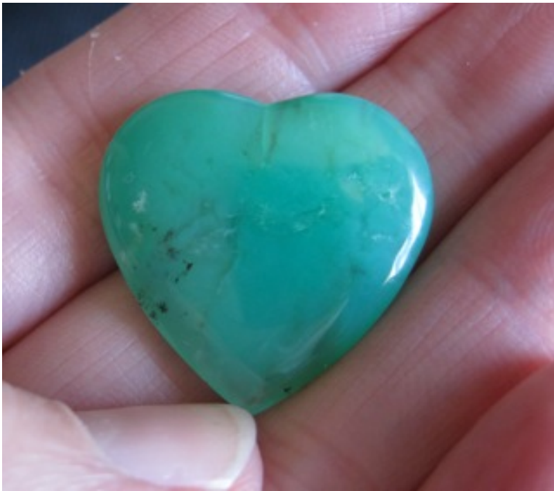
12. $30 IMG_9550 Chrysoprase Heart 26mm x 25mm