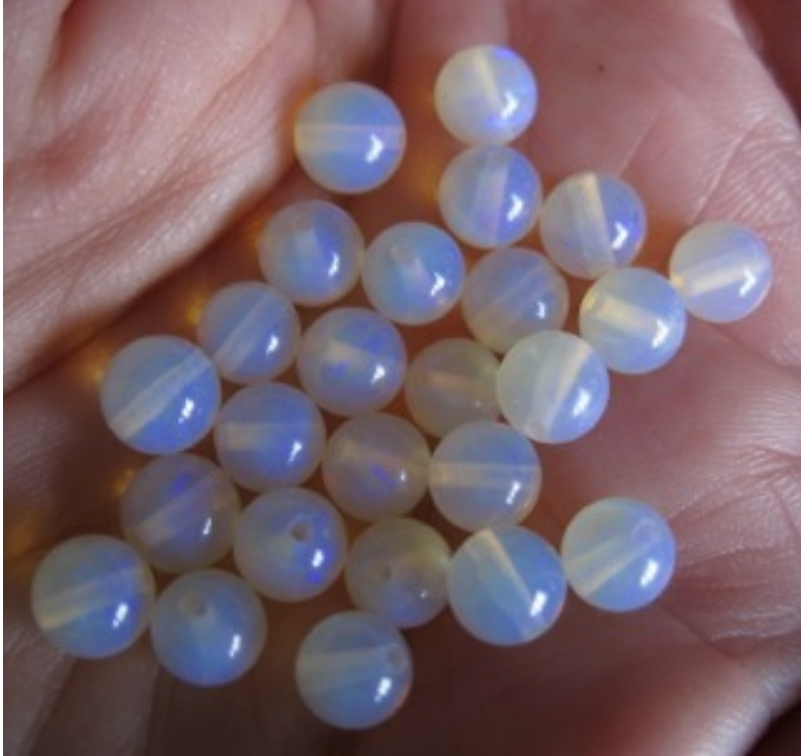
23. $144.15 IMG_9333 Andamooka Blues 6mm round (25) $5.30/ct 27.2cts