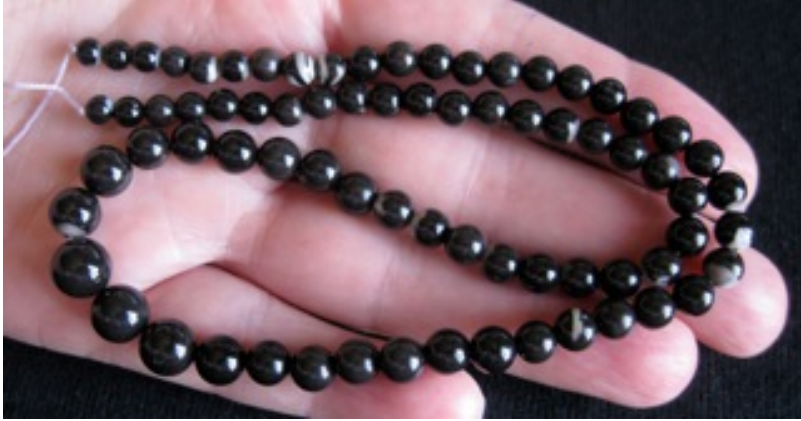
21. $99 IMG_9392 Lightning Ridge jet Black and White 4-9mm round 71cts