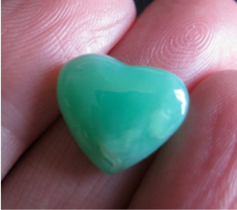
5. $15 IMG_9555 Chrysoprase Heart top drilled 14mm x 12mm