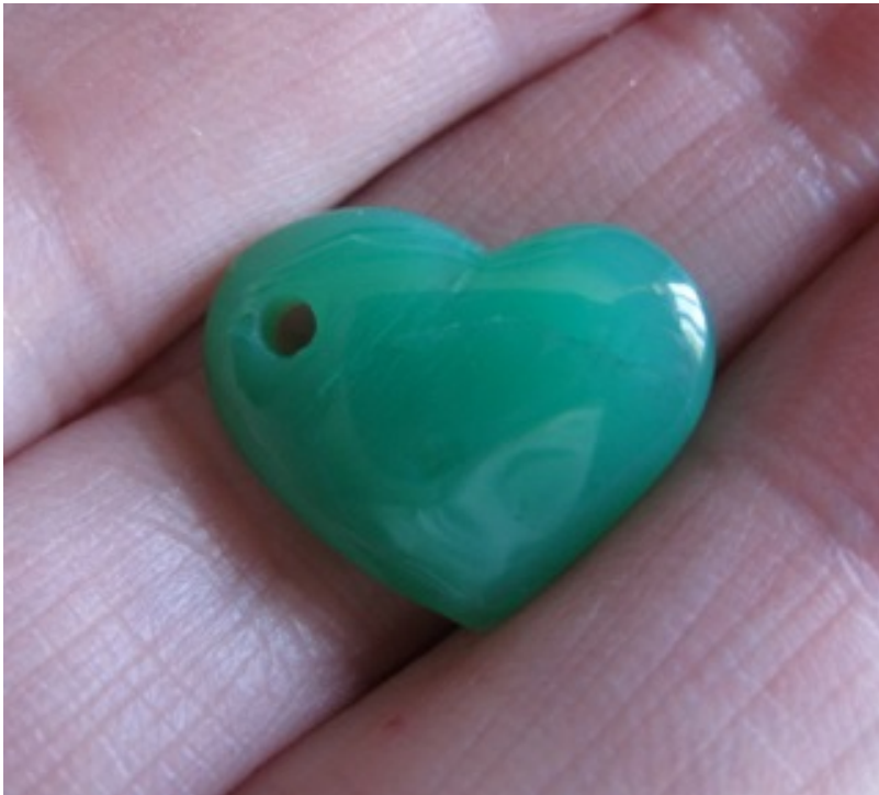
4. SOLD IMG_9554 Chrysoprase Heart front/side drilled 18mm x 14mm