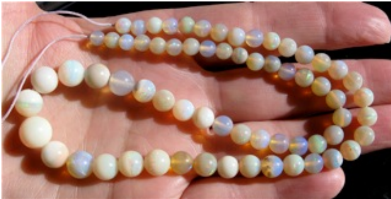
26. $795 IMG_0016.JPG Andamooka 5-10mm round 98cts