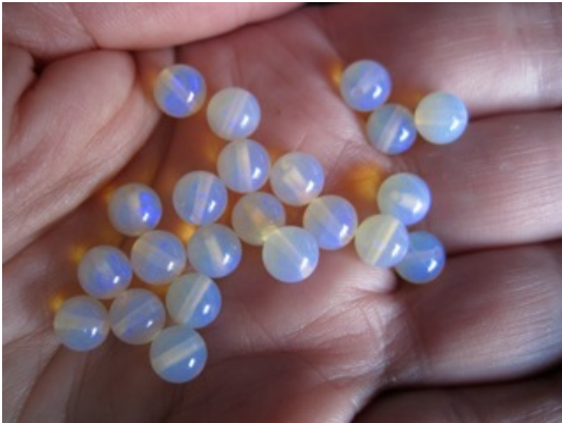
24. SOLD IMG_9329 Andamooka Blues 7mm round (22) $5.30/ct 30cts