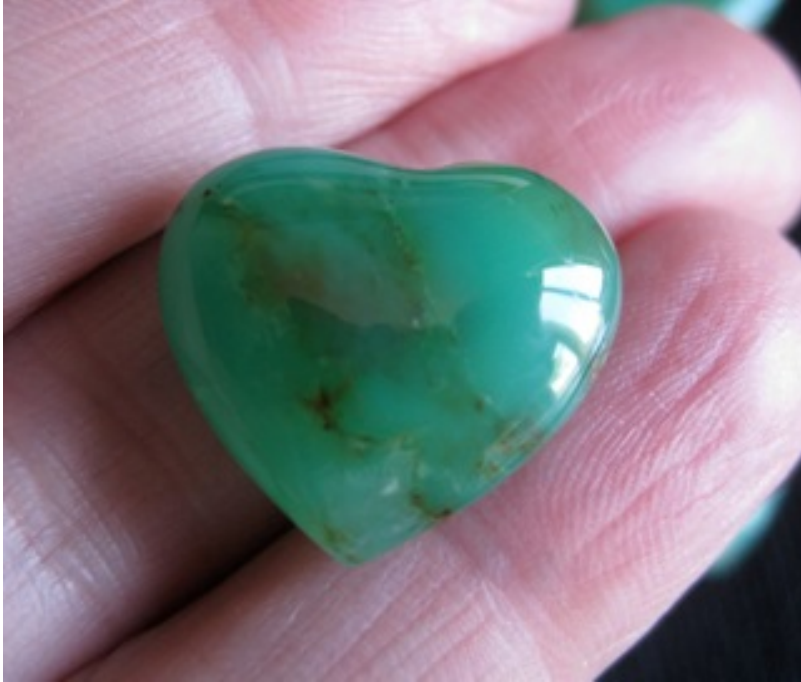
11. $25 IMG_9556 Chrysoprase Heart top drilled 20mm x 18mm