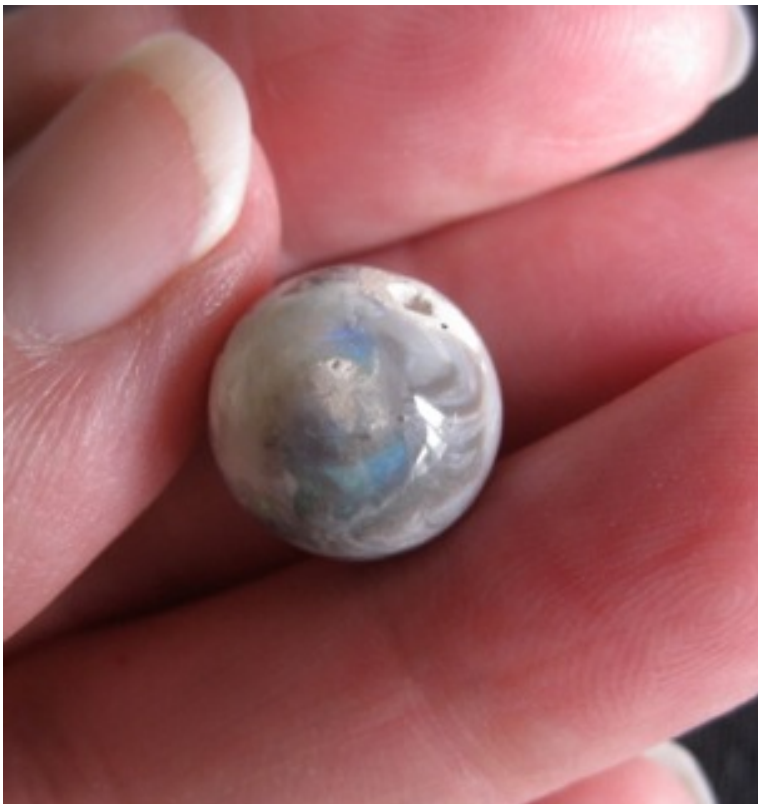
16. $59 IMG_9169 Lightning Ridge 13mm round loose bead 12.4cts