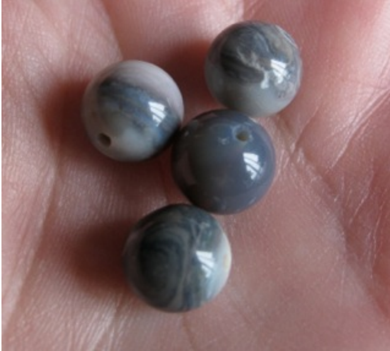
13. $36 IMG_9135 Lightning Ridge 10mm round loose beads (4) 18.29cts