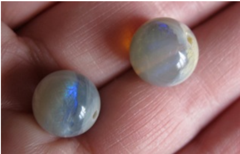
22. $115 IMG_9145 Lightning Ridge Semi Black pair 11mm round loose beads14.8cts