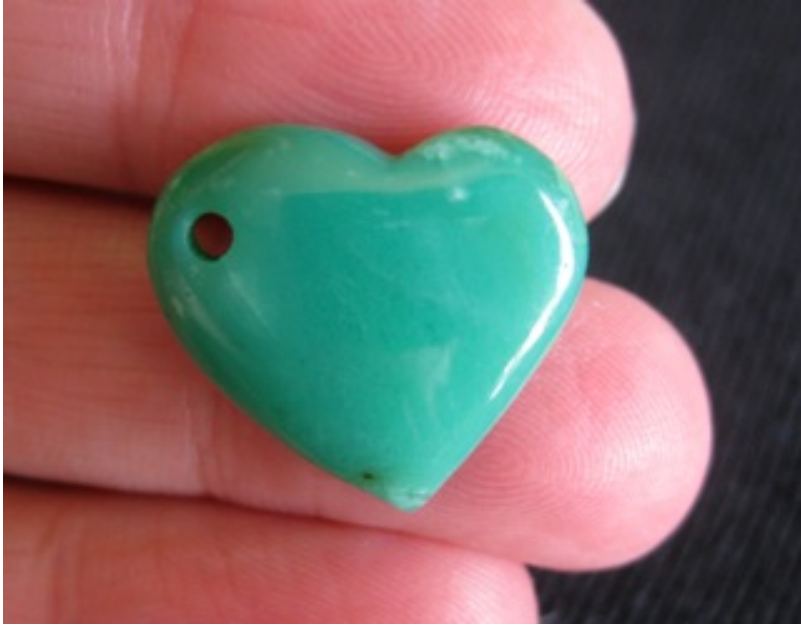
7. SOLD IMG_9560 Chrysoprase Heart front/side drilled 20mm x 17mm