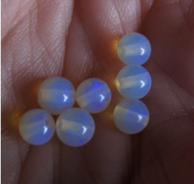
9. SOLD IMG_9336 Andamooka Blues 4.5mm round (7) $5.30/ct 4.17cts