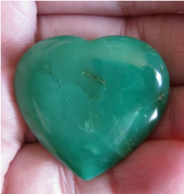
20. $75 IMG_9551 Chrysoprase Heart top drilled 34mm x 30mm