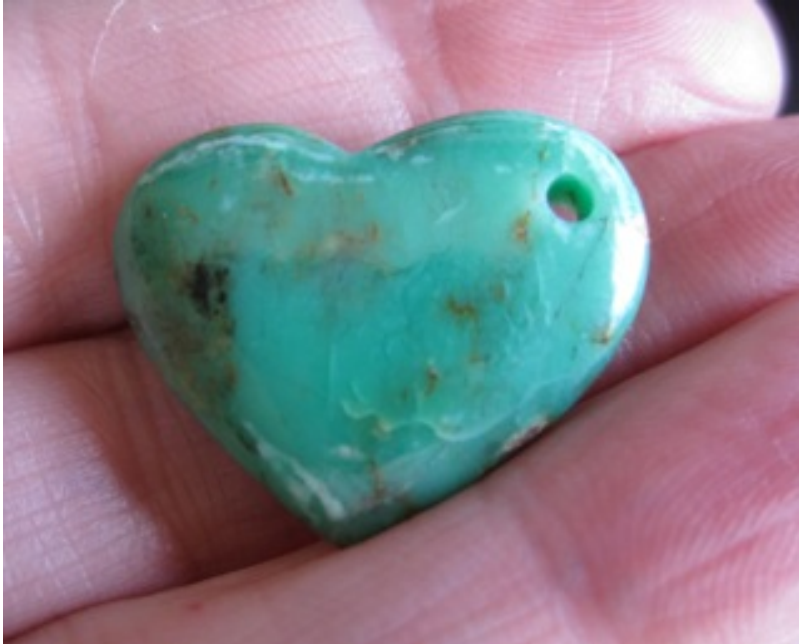
10. SOLD IMG_9552 Chrysoprase Heart front/side drilled 25mm x 19mm