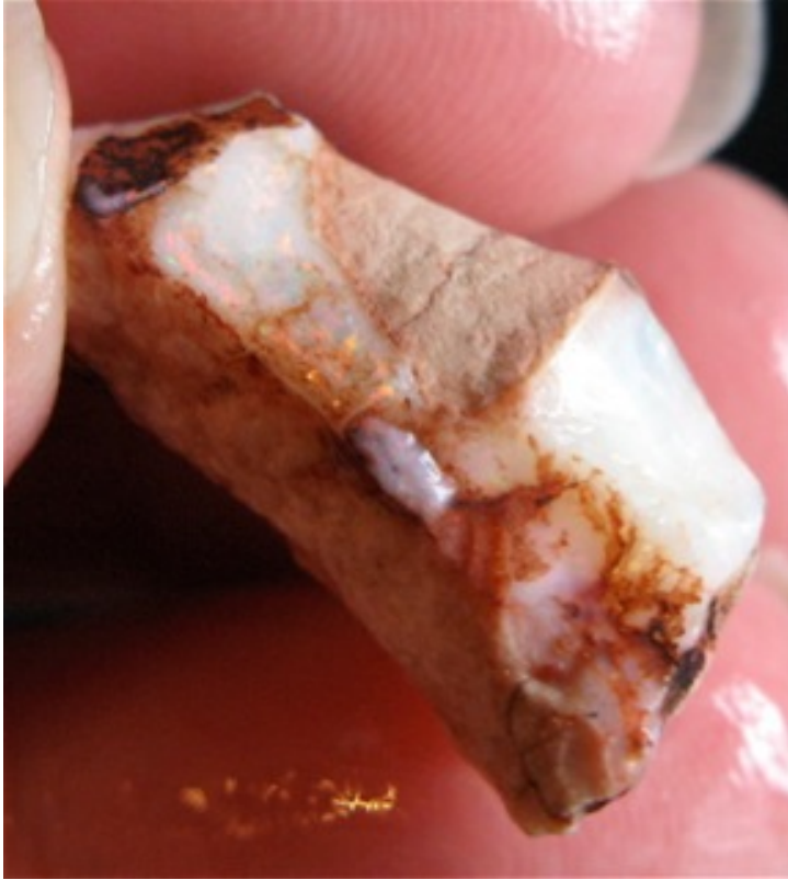
21. $306 IMG_9933.JPG Coober Pedy Reds & Greens $300/oz 1.02oz