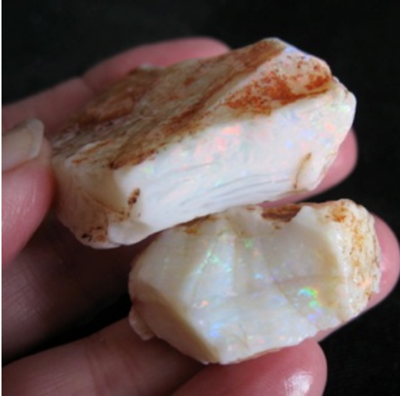
38. $1,800 IMG_4335.JPG Shell Patch Reds Greens Golds "skin to skin" 1oz