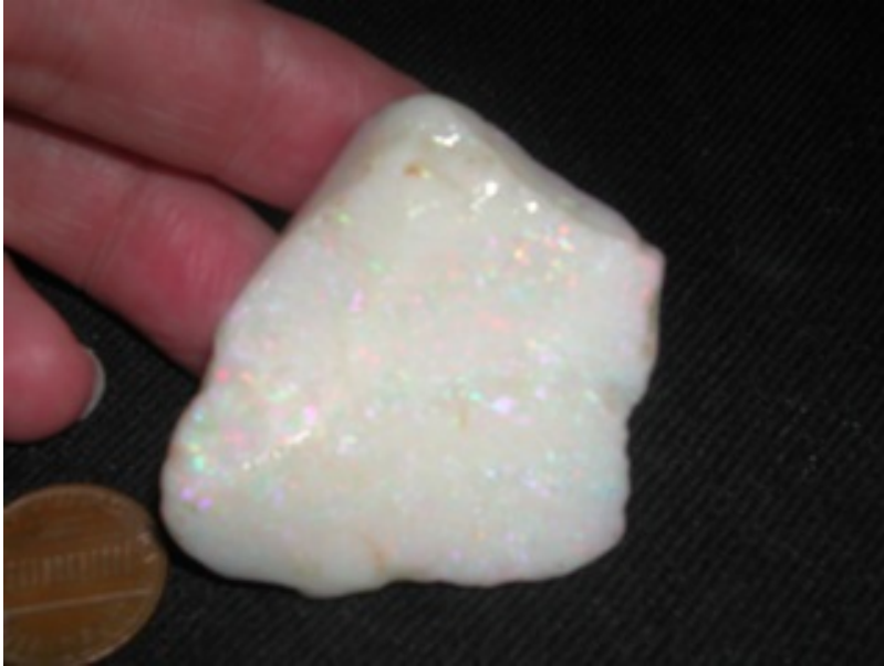
29. $460 DSCN0003 Southern Cross 1.15oz $400/oz