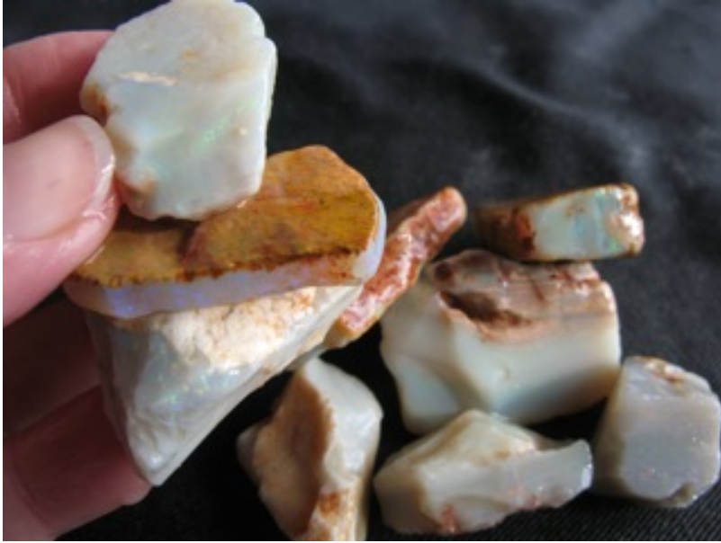
23. $360 IMG_3501 Coober Pedy Dark Base $45/oz 8oz