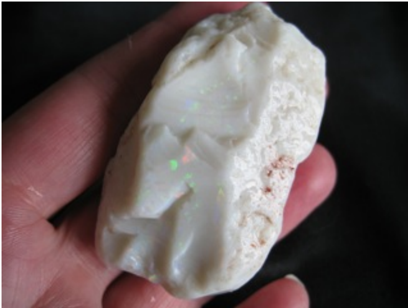
22. $360 the stone IMG_6917 Coober Pedy White Base Reds & Greens $200/oz 1.8oz