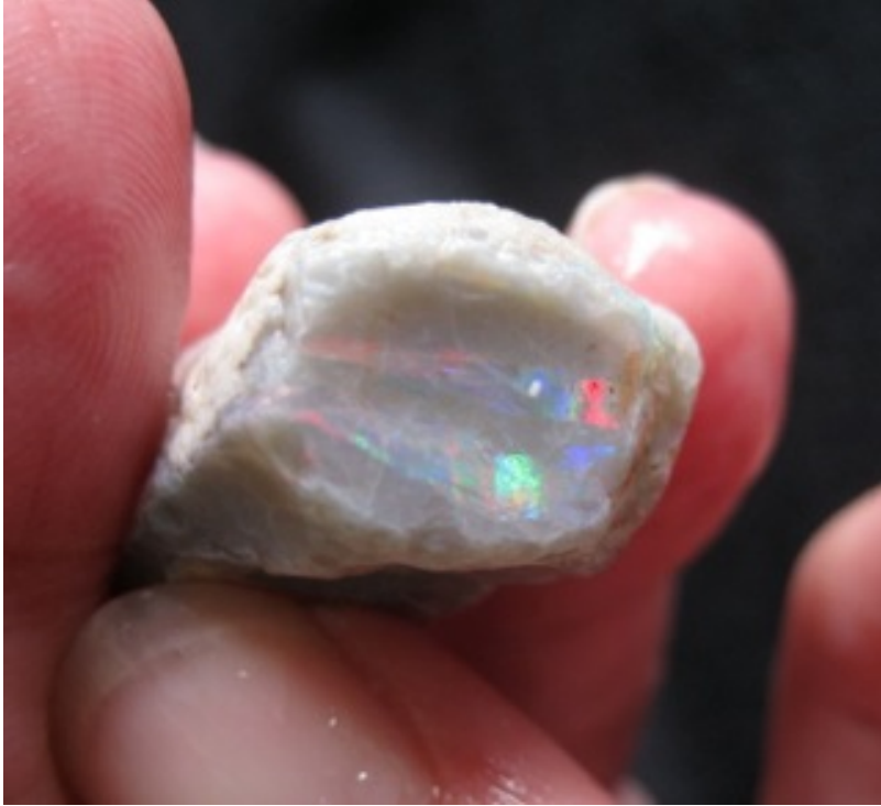
27. $412.50 IMG_0082 Coober Pedy 23 Mile .33oz $1250/oz