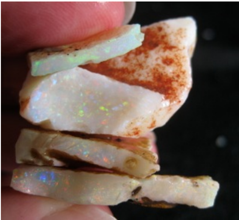
24. $390 IMG_0087 Reds $1,000/oz .39oz