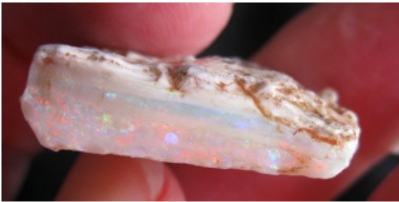
30. $462.50 IMG_0534 Coober Pedy 8 Mile $2,500/oz .185oz