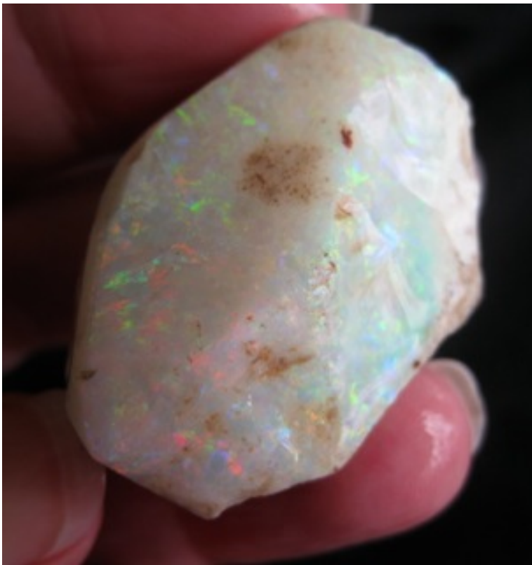
37. $1,560 IMG_0518 Coober Pedy $2,600/oz .6oz