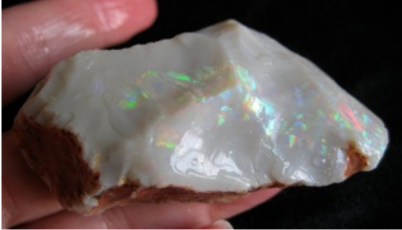
25. $396 IMG_7978 Coober Pedy $200/oz 1.98oz