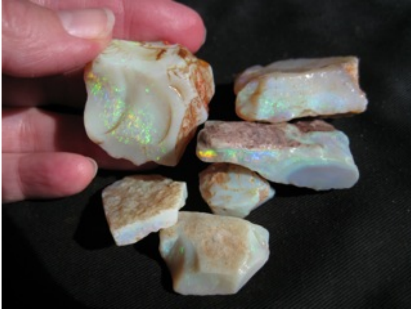
36. $1,488 IMG_5801 Coober Pedy Greens & Golds $600/oz 2.48oz