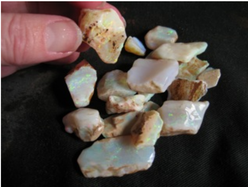
35. $1,071 IMG_5803 Coober Pedy Greens & Golds $700/oz 1.53oz