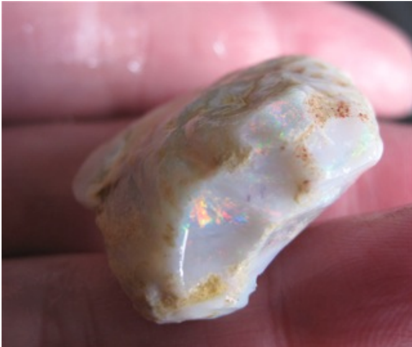
26. $400 IMG_1987.JPG Shell Semi Black Gem Reds 50cts