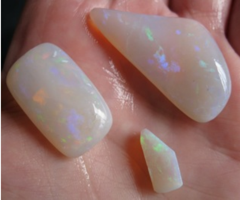
34. $1,040 IMG_0092 Jelly $20/ct 52.5cts