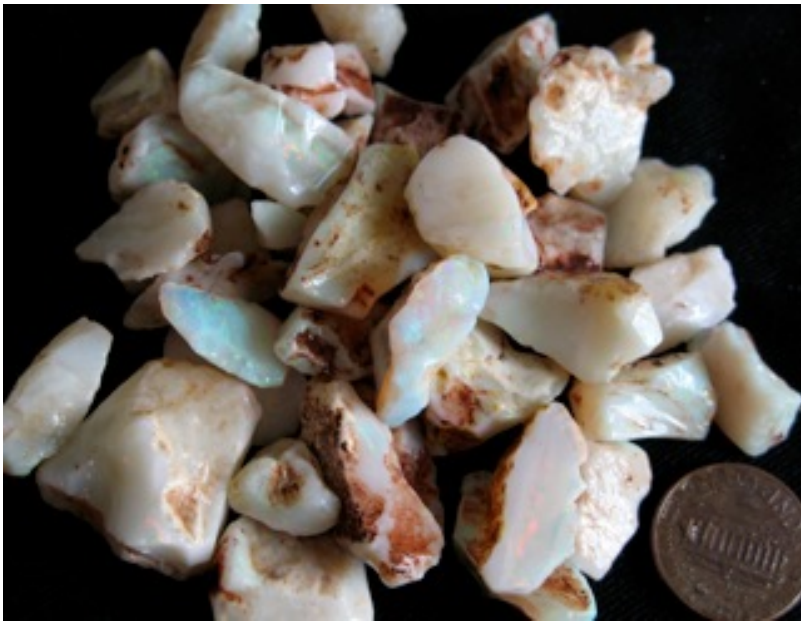
28. $435 IMG_9954.JPG Coober Pedy 8 Mile (may be cracky) $150/oz 2.9oz THE LAST OF IT