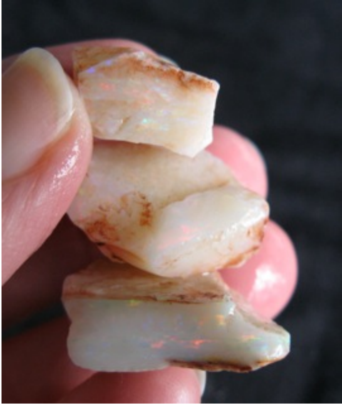
18. $280 IMG_1199 Olympic Reds & Greens $800/oz .35oz