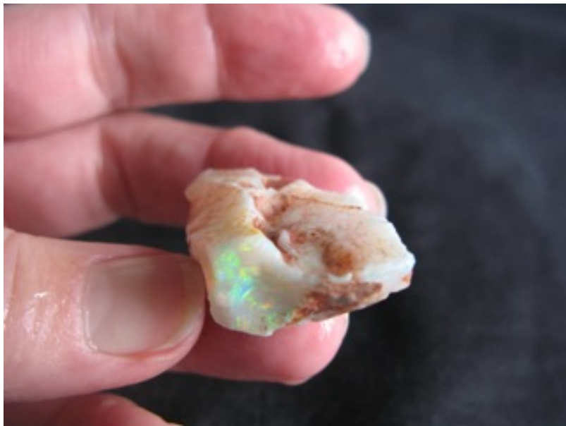
20. $520 IMG_1181 Olympic Gem $2,000/oz .26oz