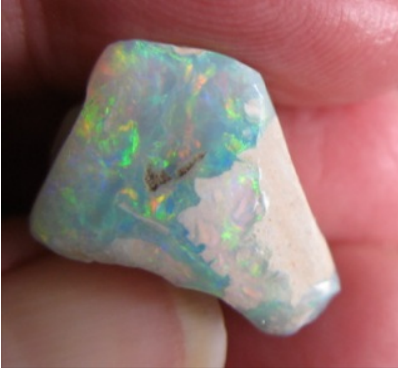
6. $99 IMG_1204 Lightning Ridge Nobbie brilliant Reds & Greens 12.2cts