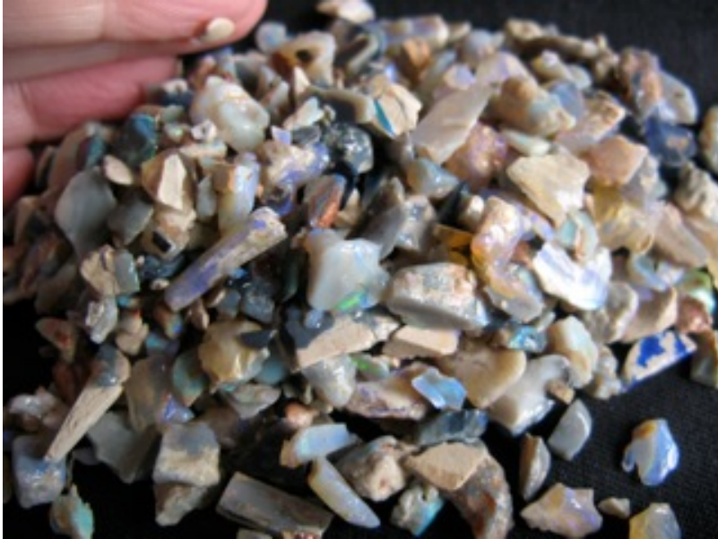
10. $125 IMG_1209 Lightning Ridge Chips $25/oz 5oz