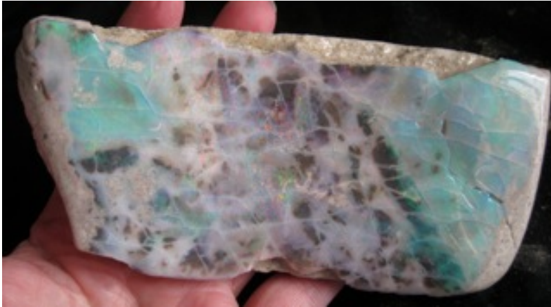
26. $895 IMG_1140 Mintubi Specimen including Black approx 12cm x 6cm x 1.5cm thick