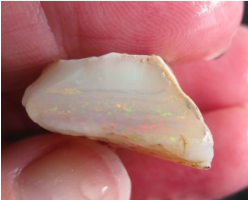
3. $85.60 IMG_0960 Olympic $400/oz .214oz