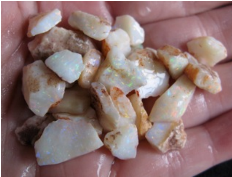
7. $118 IMG_9454 Olympic small bright stones .59oz - will make great little solids