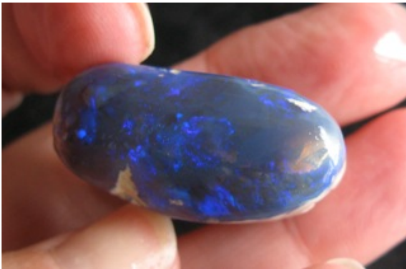
11. $172 IMG_1206 Lightning Ridge large Nobbie beautiful Blues to cut a 30mm x 14mm ring 60.9cts