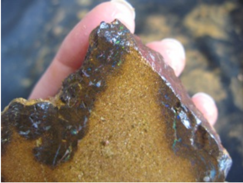
24. $345 IMG_0482 Boulder Matrix Opal 5.8oz