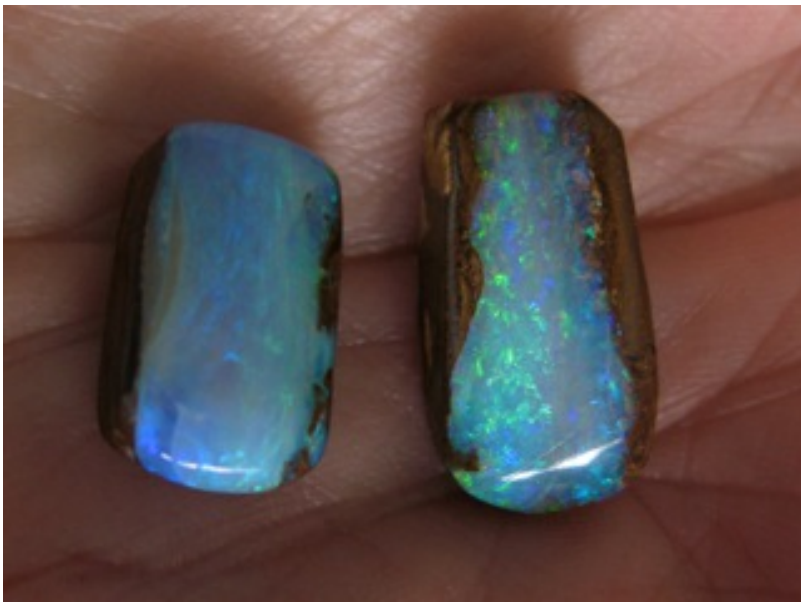
29. $600 IMG_1611 Boulder Pipe Opals (2) 18.97cts $300 each - one has a natural flaw