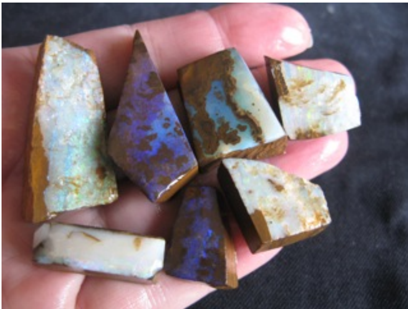
17. $200 the lot IMG_2038 Boulders (7)