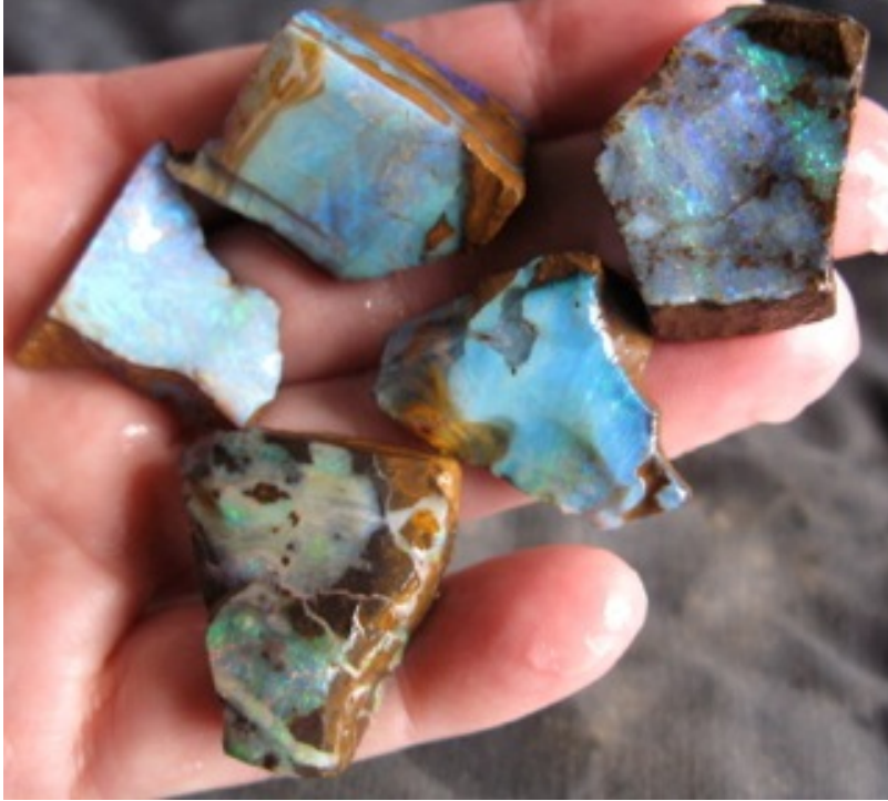
5. $25 each IMG_6759 Boulder Opals (5) $125