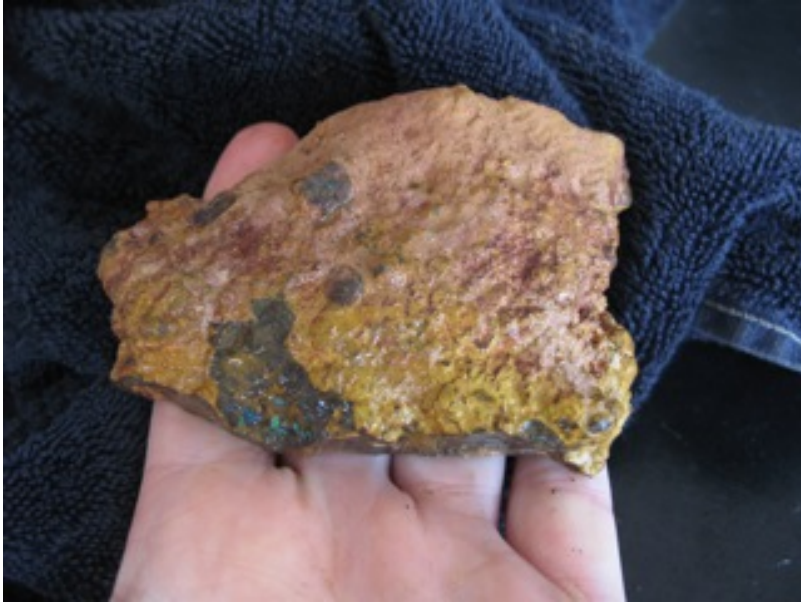
28. $345 IMG_0490 Boulder Matrix Opal 5.8oz