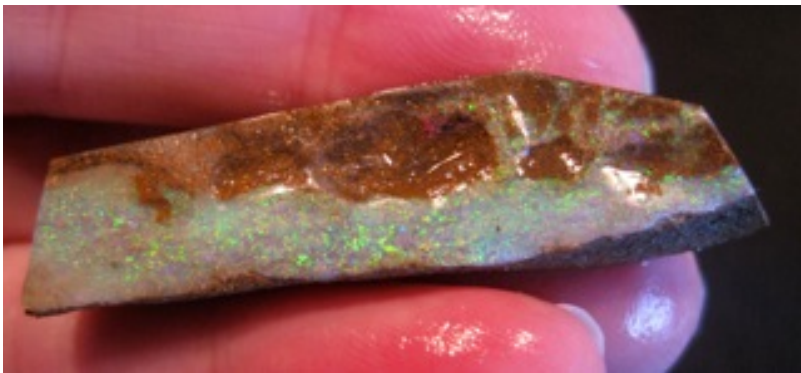
4. $27 IMG_3341 Boulder .24oz