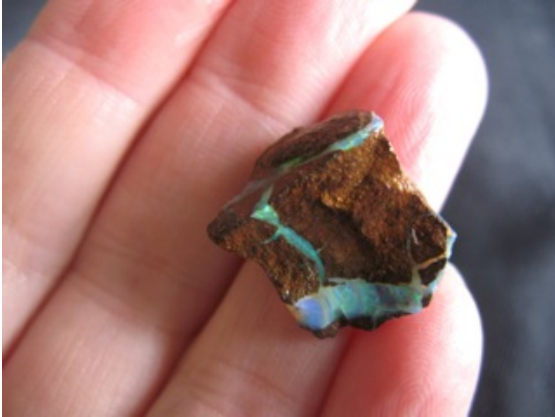
3. $25 IMG_2026 Boulder Gem .798oz