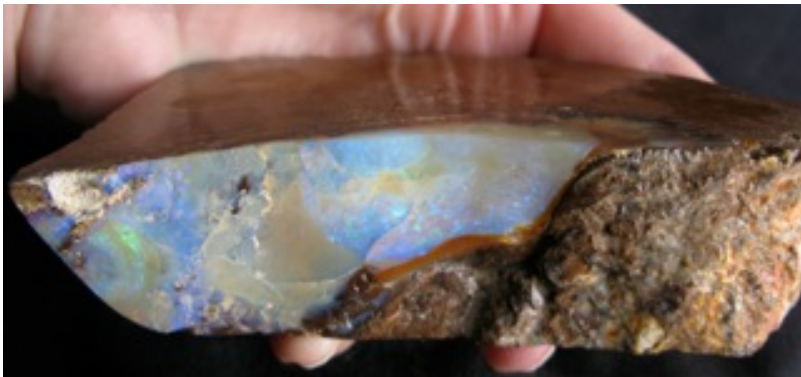
13. $125 IMG_1001 Boulder 340 grams