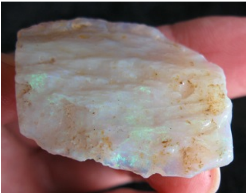
20. $320 IMG_4815 SPECIAL Andamooka .321oz