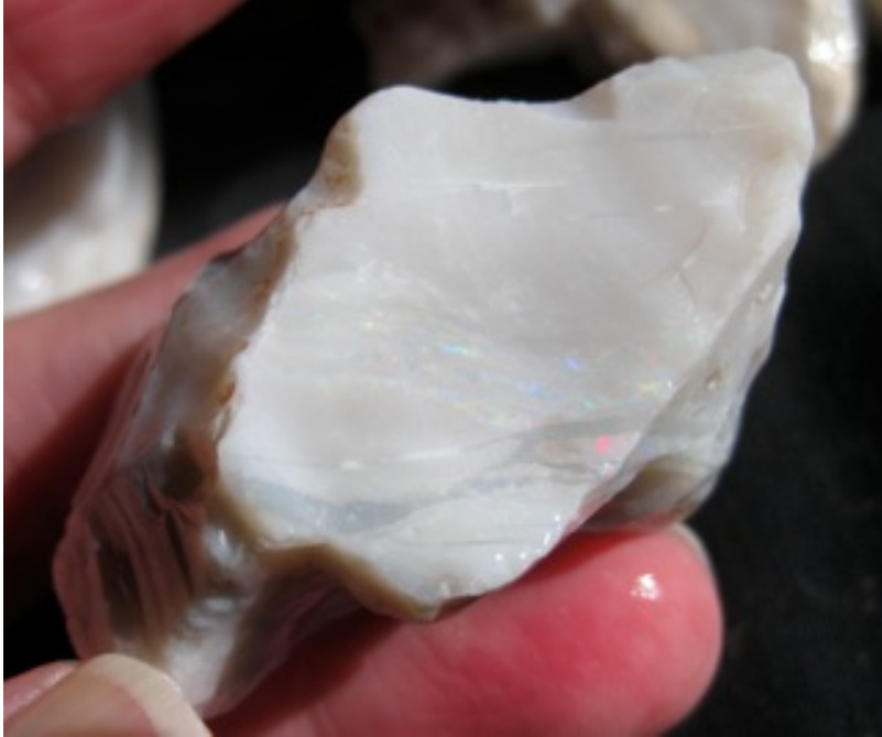
17. $259 IMG_1047 Olympic Dark Base $35/oz 7.4oz