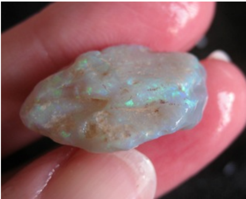
30. $834 IMG_0031 Lambina Dark $1,200/oz .695oz