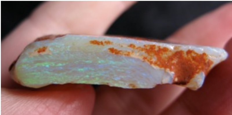
26. $536 IMG_3434 BARGAIN Lambina "kingstone" of the parcel $800/oz .67oz (45x30x9-12mm thick) "skin to skin"