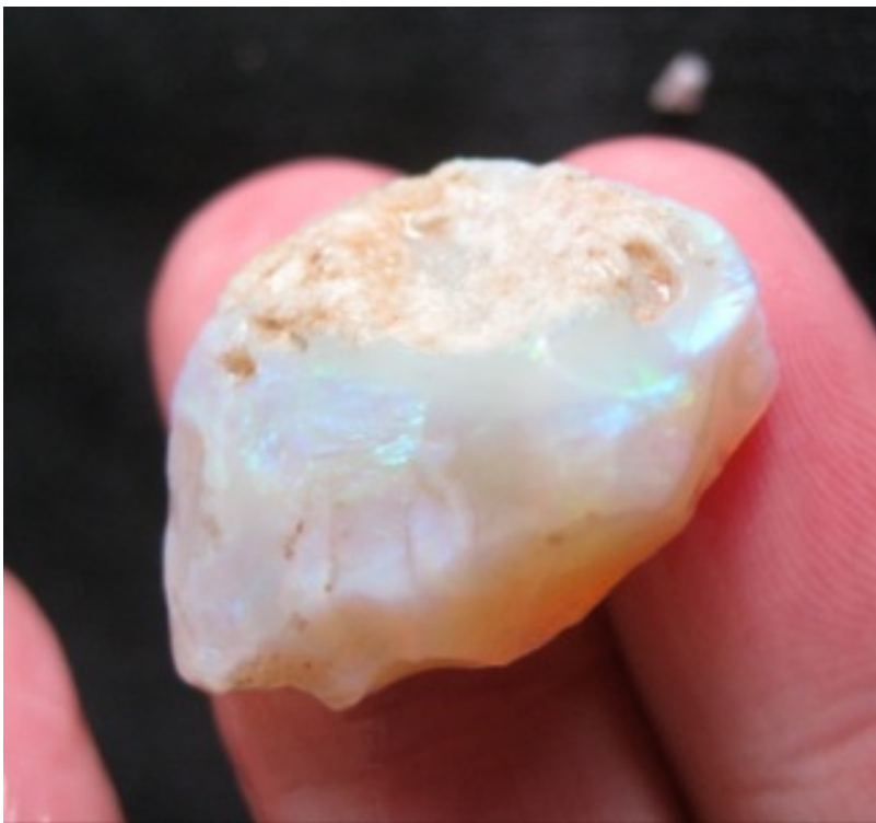
10. $133 IMG_0038 Gem Greens & Golds $950/oz .14oz