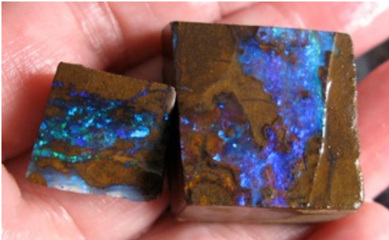
12. $165 each IMG_4809 Boulders (2) .87oz