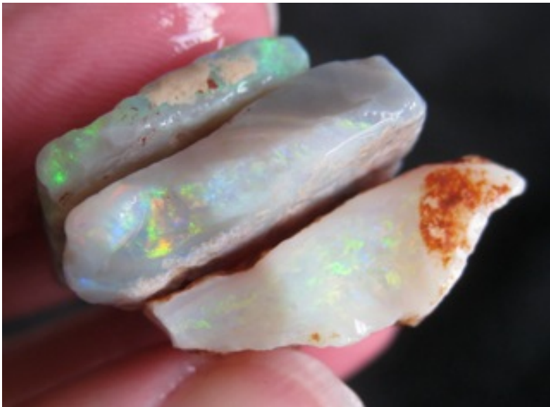
22. $361.80 IMG_0021 Lambina Dark $1,800/oz .201oz