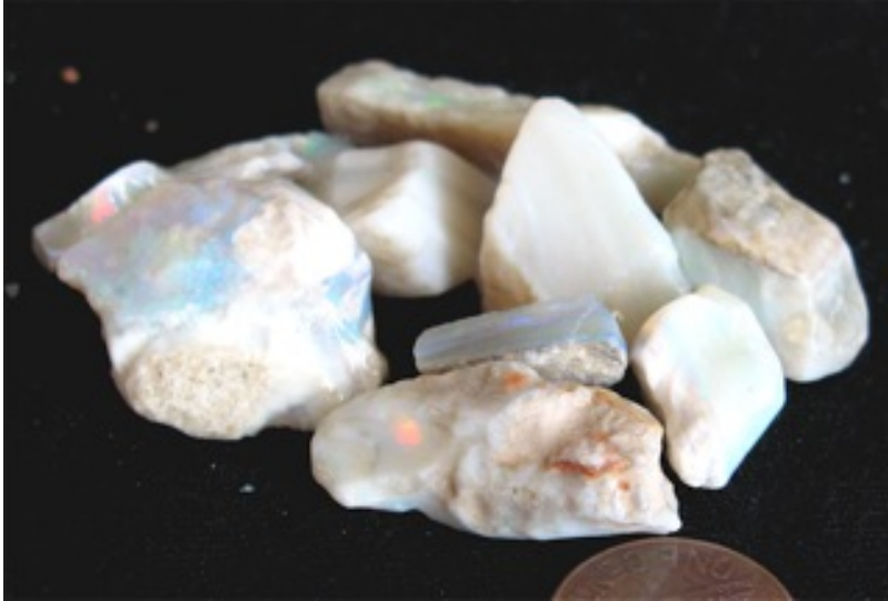
4. $100 IMG_9966.JPG International Field Dark Base 1oz