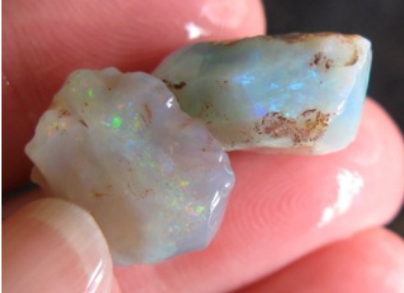
9. $127.50 IMG_4820 SPECIAL Lambina Black $850/oz .15oz