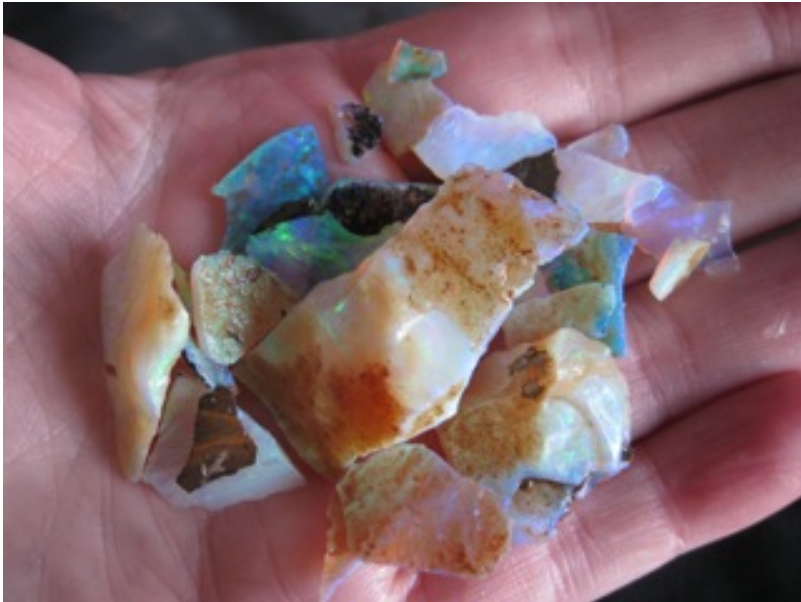
24. $468 IMG_0012 Queensland Seam Opal .52oz $900/oz