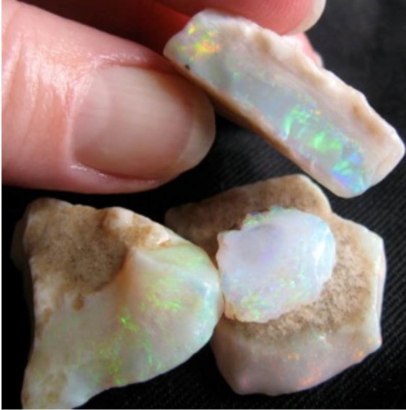
33. $1,968 IMG_4859 Mintubi $3,000/oz .656oz