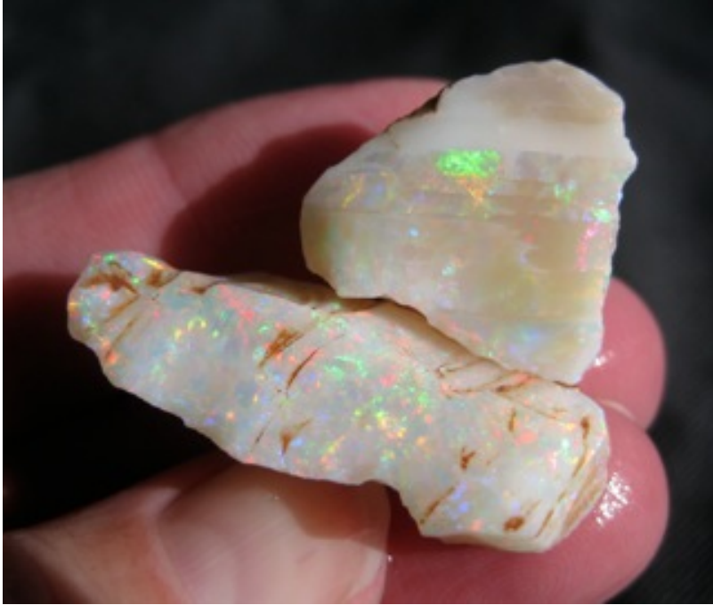
27. $644 IMG_1808 Shell Patch $1,800/oz .358oz - I have another 10oz or so, stones up to .97oz