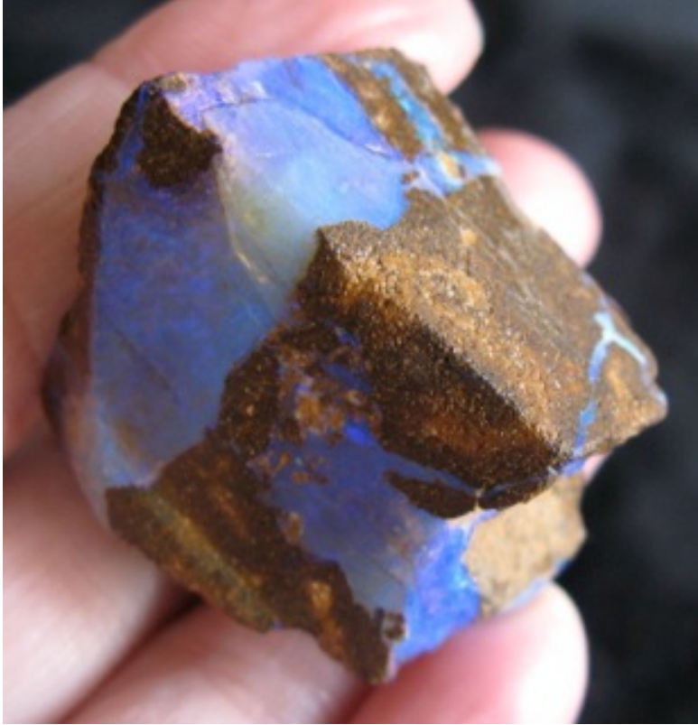
11. $145 IMG_4824 Boulder 1.05oz