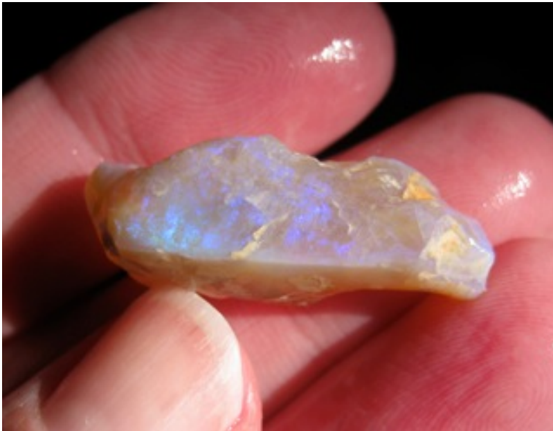
3. $100 IMG_1827 Lambina Blue Pendant stone $1,000/oz .1oz - (30x8x9mm thick) also has a gem green bar that will face beautifully (side 1)