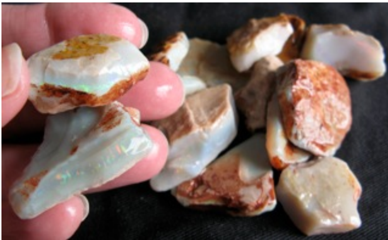
6. $120 IMG_4868 Opal Valley Dark Base $40/oz 3oz