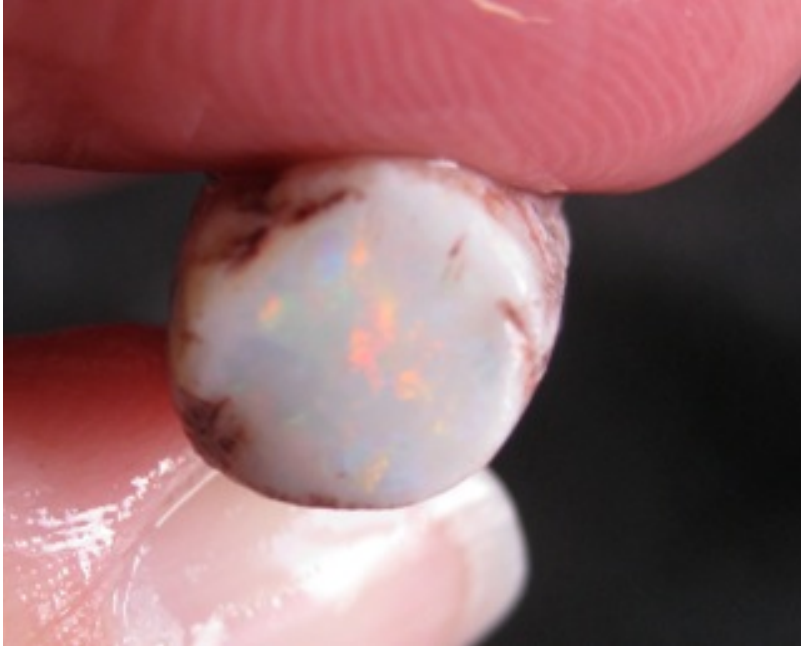
15. $225 IMG_0018 Opalised "Squid" Belemnite 28.29cts