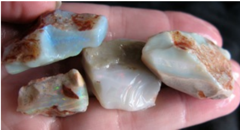
5. $102 IMG_4830 Opal Valley Dark Base $100/oz 1.02oz