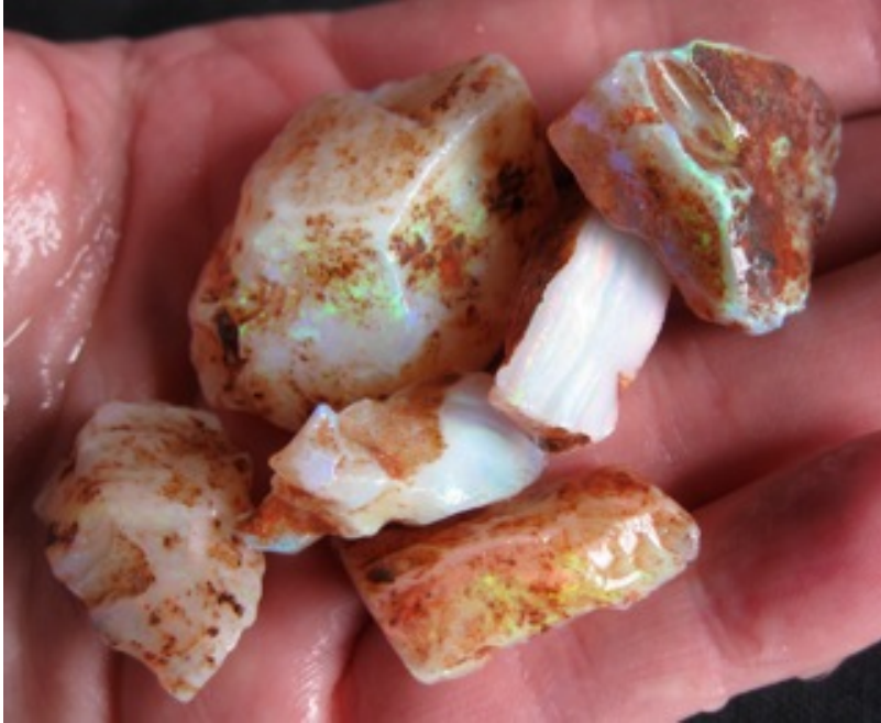
23. $436 IMG_9711 Lambina Mixed Reds & Greens 1.09oz $400/oz