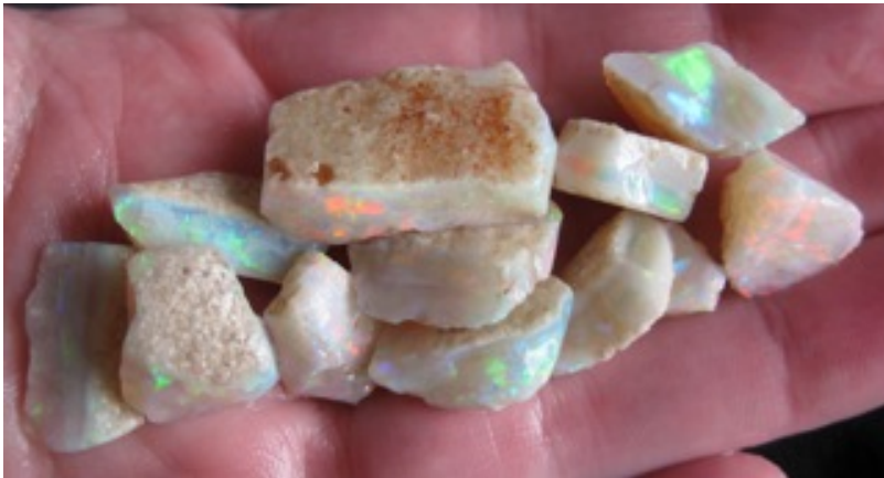
32. $1,800 IMG_2630 Mintubi Red & Green Crystals $3,000/oz .6oz