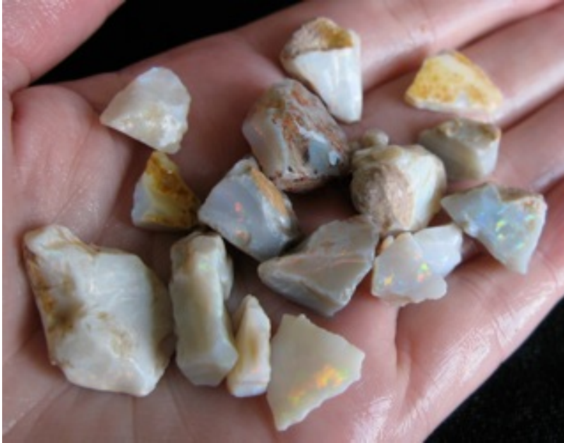
13. $200 IMG_4847 Mixed Small Stones $250/oz .8oz