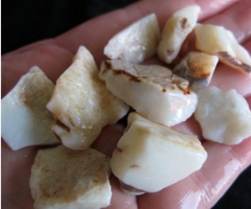
7. $120 IMG_4843 White Base Reds & Greens $60/oz 2oz