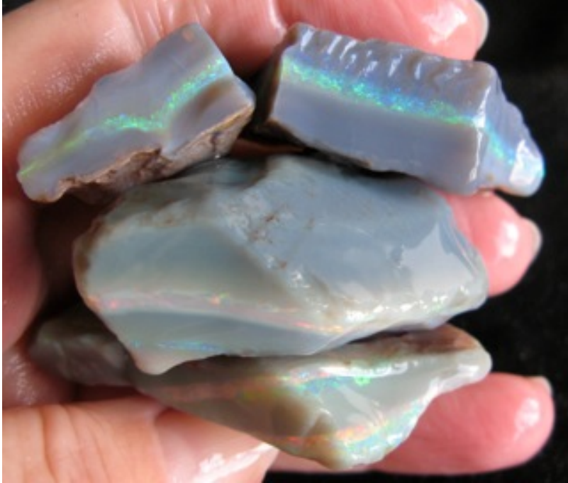
31. $1,610 IMG_4849 SPECIAL Coober Pedy 17 Mile Black $700/oz 2.3oz