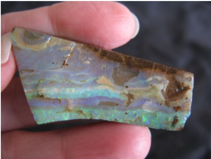
8. $125 IMG_4822 Boulder .697oz