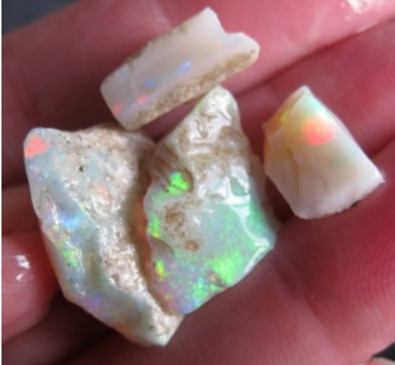
25. $528 IMG_2624 Mintubi Crystal Gems $3,000/oz .176oz