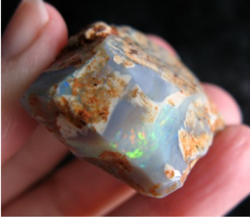
21. $351 IMG_3453 Lambina Dark Base Super Gem Bar $450/oz .78oz