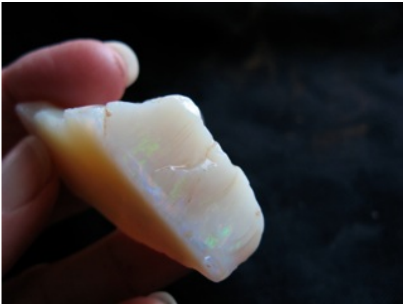
28. $707 IMG_4058.JPG Olympic Gem Bar on Jelly $1,000/oz .707oz