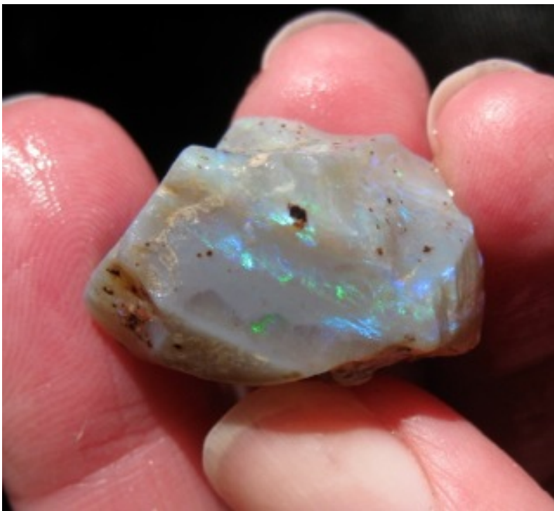
18. $262 IMG_1830 Lambina Black $1,250/oz .21oz