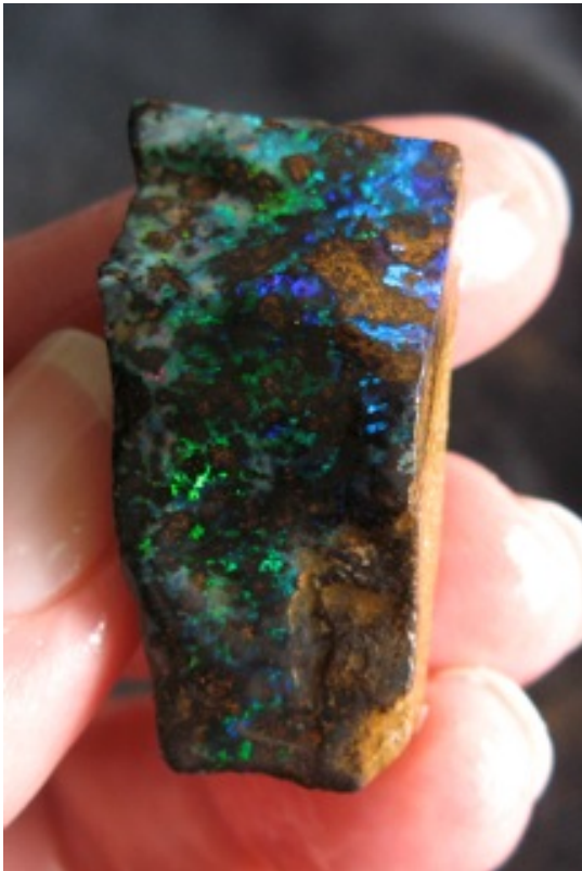
16. $225 IMG_4811 Boulder .352oz