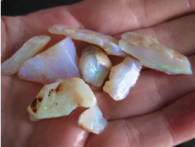
19. $300 IMG_0029 Inlay $600/oz .5oz