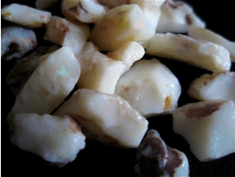
2. $96 IMG_0705.JPG Hans Peak Reds & Greens smaller stones (21) $75/oz 1.28oz