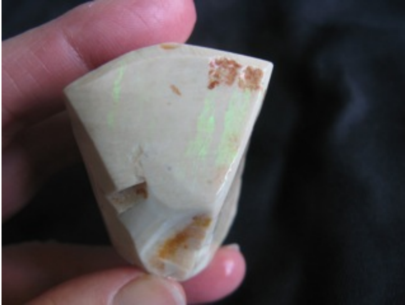
25. $1,255 IMG_1411 Andamooka untreated Matrix $500/oz 2.51oz