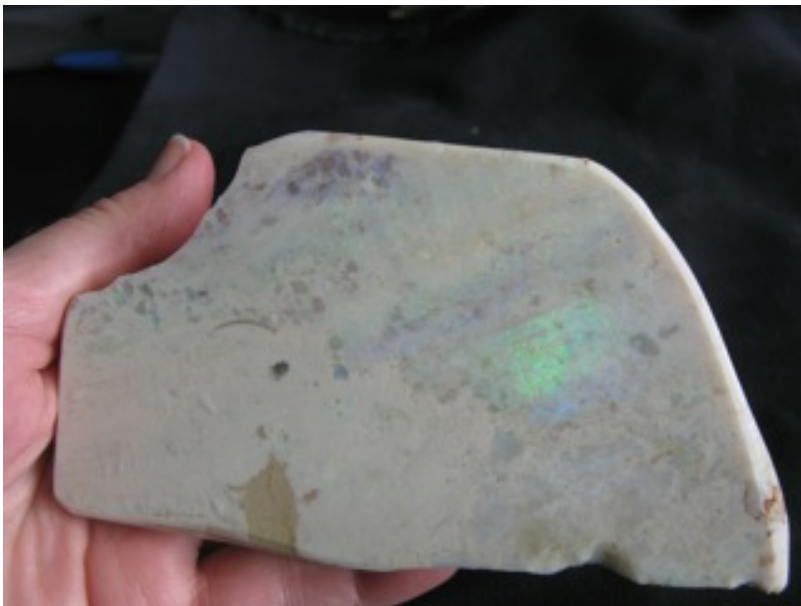
4. $175 IMG_1080 Andamooka Matrix Opal great colours 7.85oz