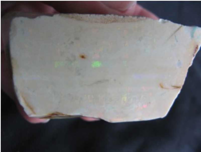
22. $820 IMG_1592 Andamooka Untreated Matrix Reds, Golds some Blues 60mm x 35mm x 30mm thick $200/oz 4.1oz