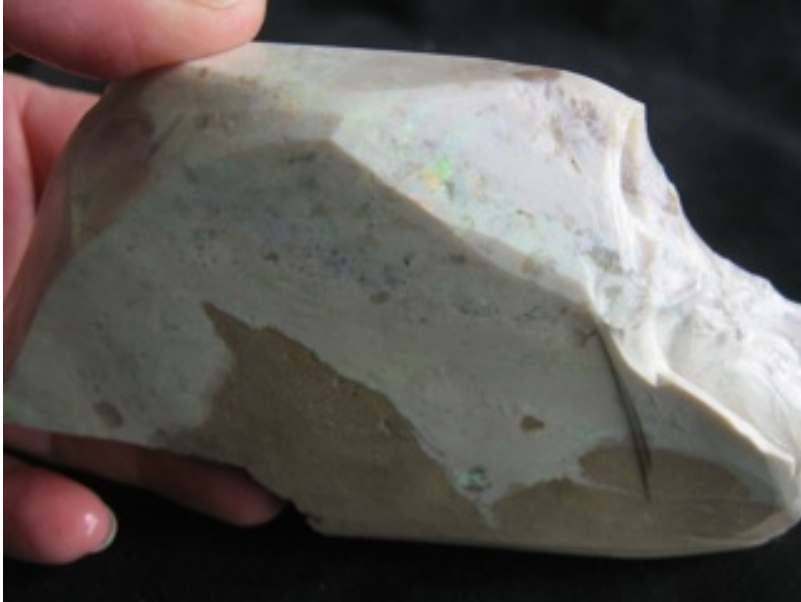
5. $175 IMG_1081 Andamooka Matrix Opal great colours 7.85oz