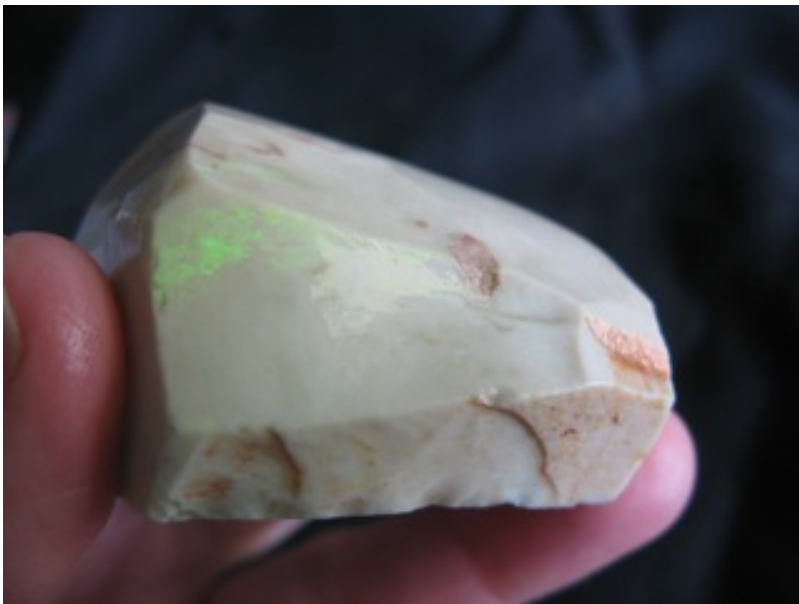
26. $1,255 IMG_1414 Andamooka untreated Matrix $500/oz 2.51oz