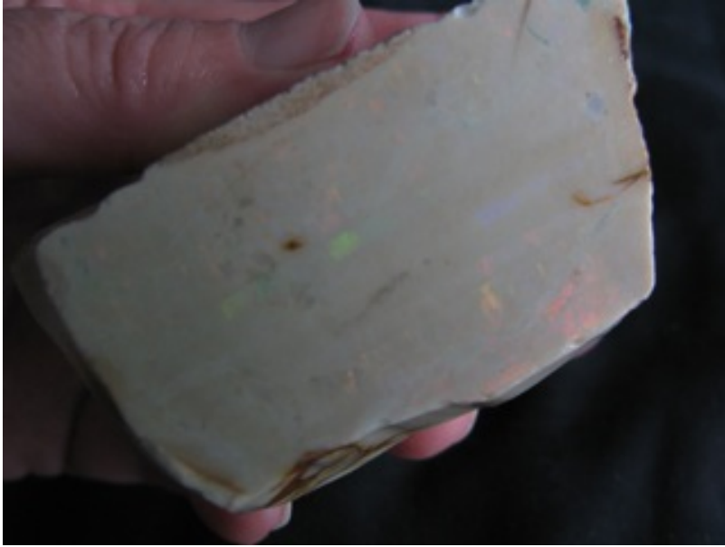
21. $820 IMG_1590 Andamooka Untreated Matrix Reds, Golds some Blues 60mm x 35mm x 30mm thick $200/oz 4.1oz